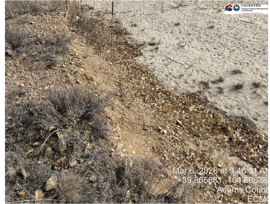
Pic 1 Unable to access wellhead due to road being washed out