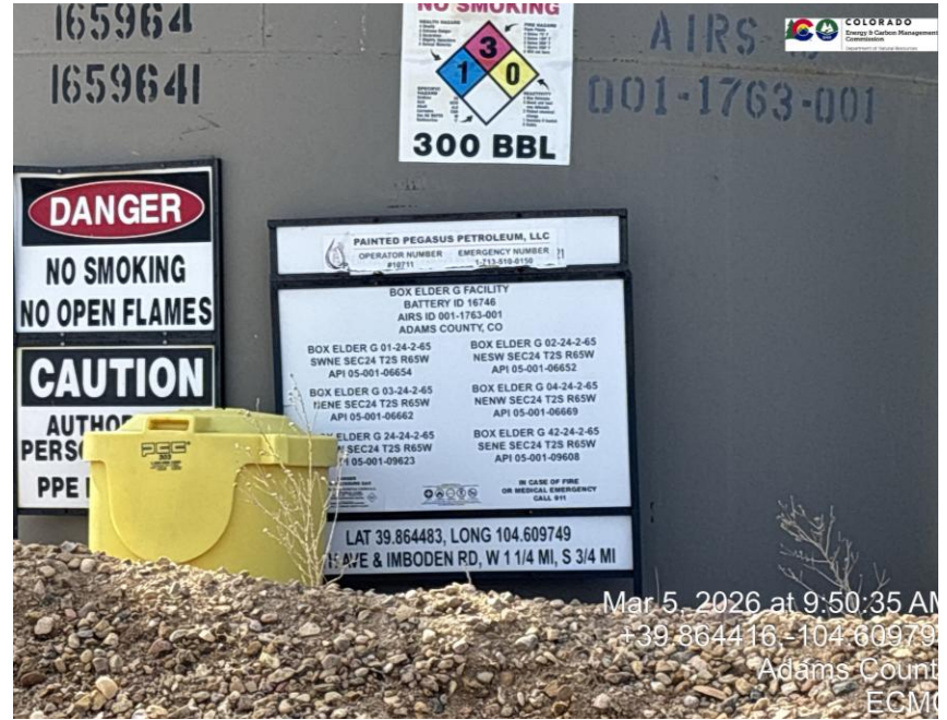
Pic 5 Tanks