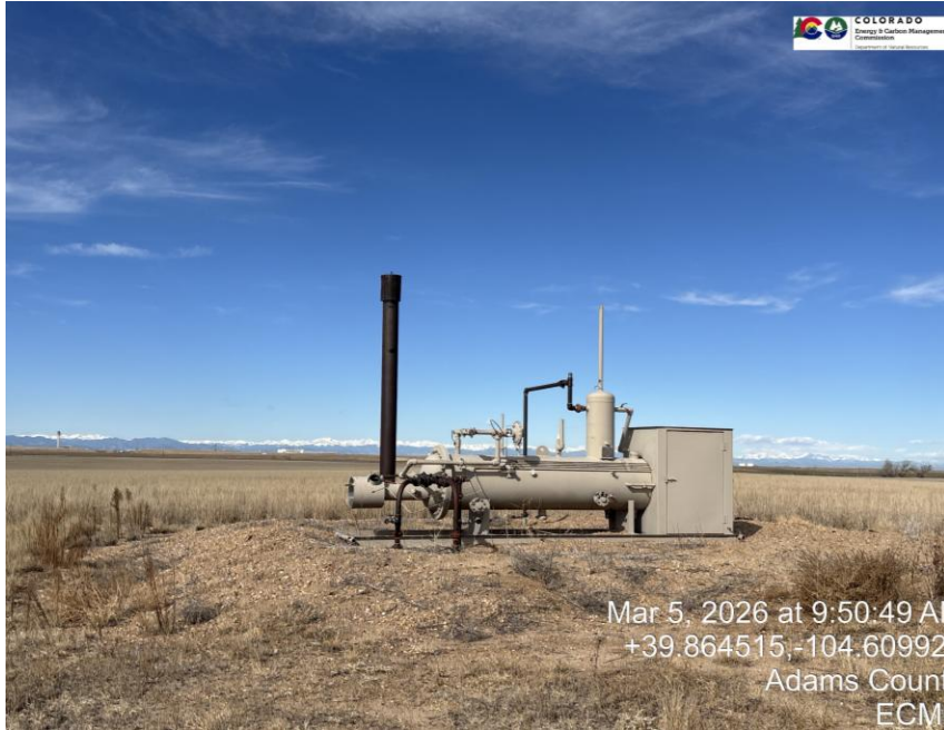
Pic 7 separator