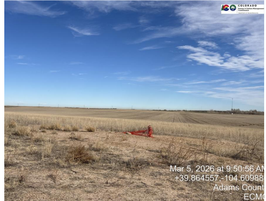
Pic 8 GMR riser