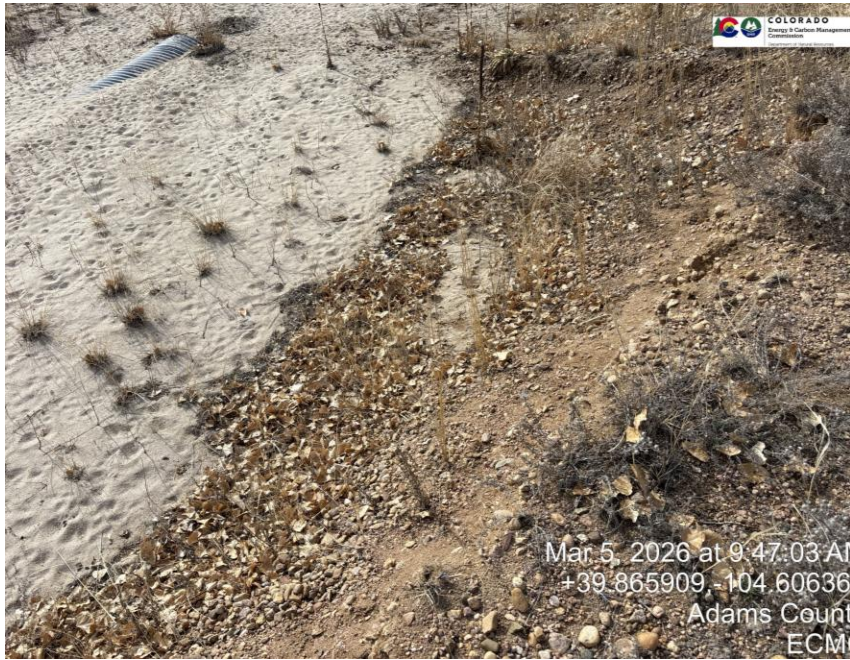
Pic 3 washed out road