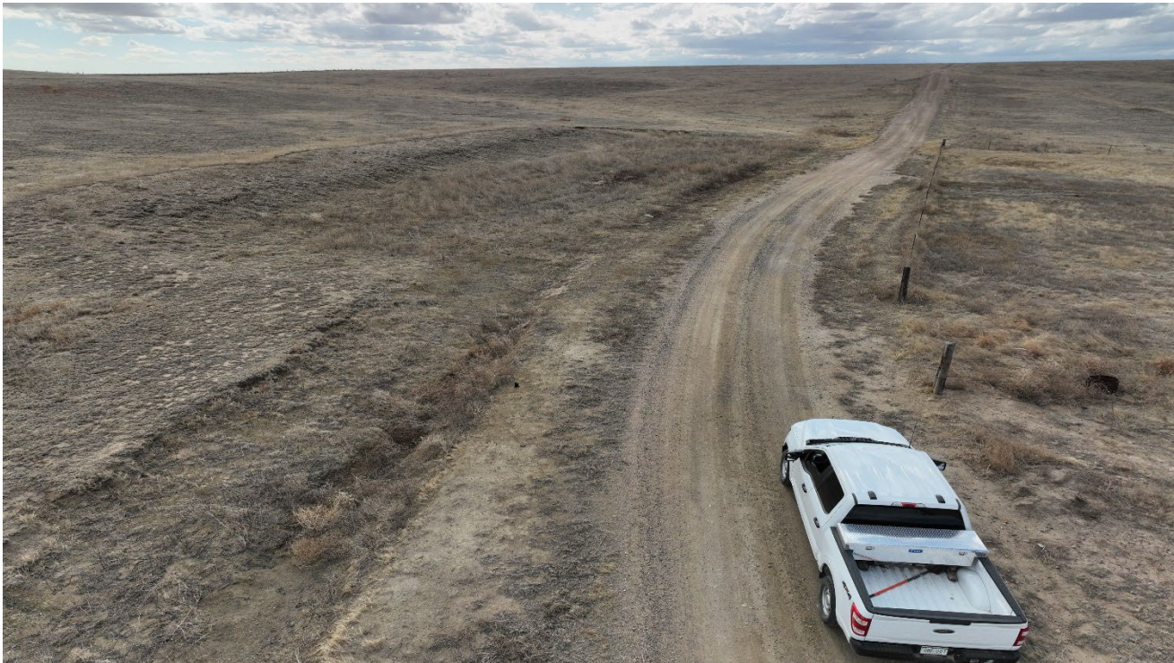
Photo 1. Drone aerial photo facing southwest at the location. The location has not been recontoured back to the original contour.