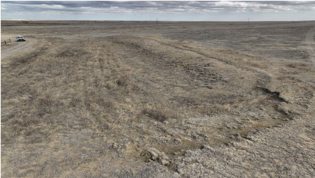
Photo 4. Drone aerial photo facing east overlooking the cut slope. This area need to be recontoured and reclaimed.