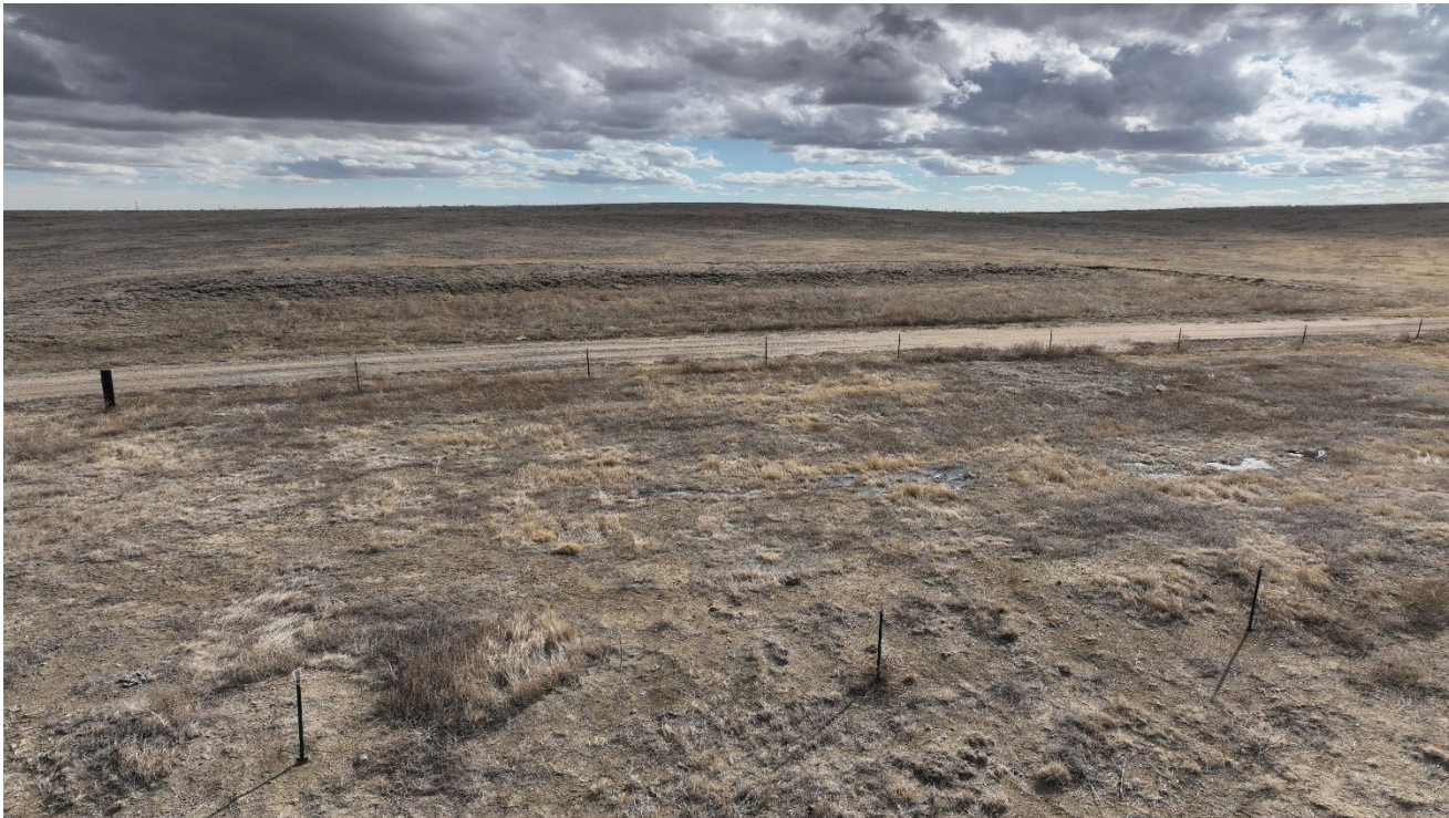
Photo 3. Facing south overlooking the location. The fenced area is not establishing desirable vegetation.