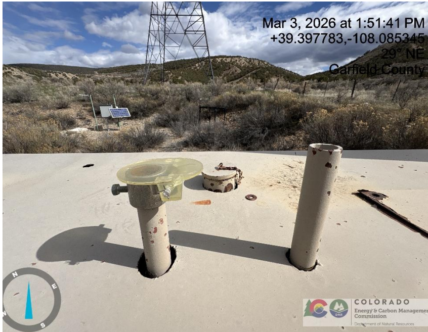
Photo # 5180 PRV vent line on separator does not comply with CECMC pressure safety device rules