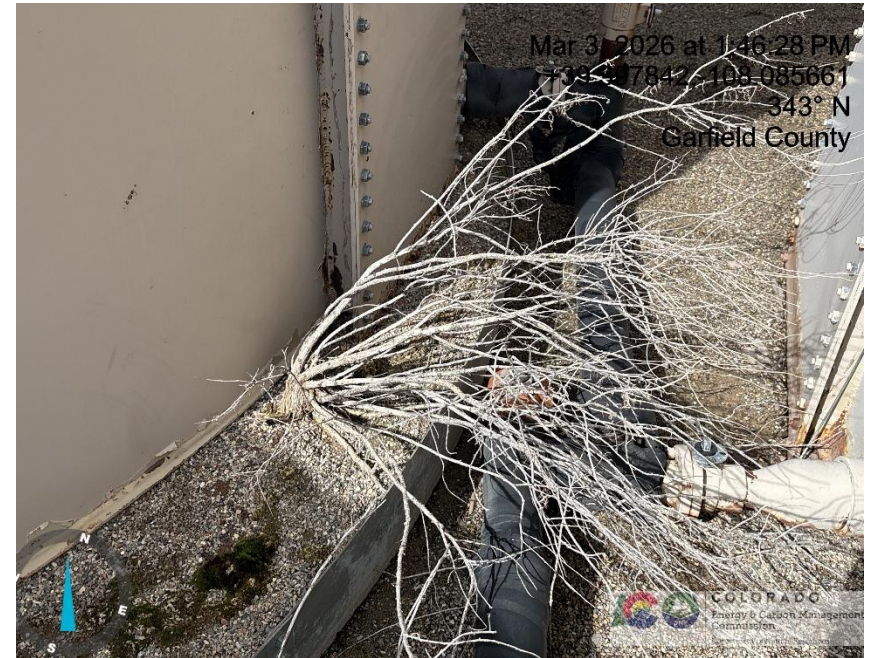
Photo # 5187 Weeds/undesirable plant species in tank battery secondary containment