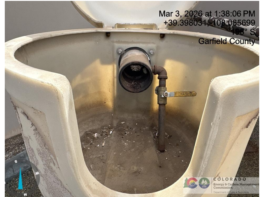
Photo # 5170 Open ended piping on unused production tank /wildlife hazard/available for entry by wildlife