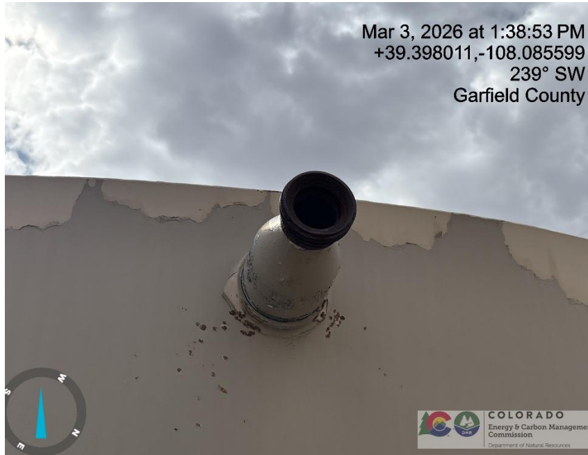
Photo # 5156 Open ended piping on unused production tank /wildlife hazard/available for entry by wildlife