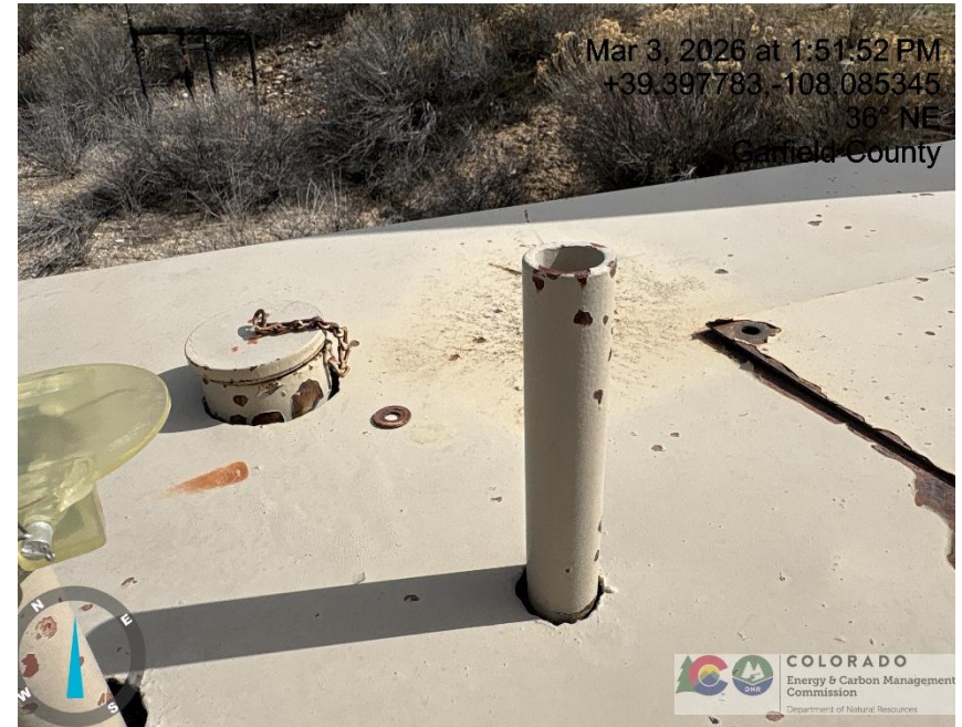
Photo # 5181 PRV vent line on separator does not comply with CECMC pressure safety device rules