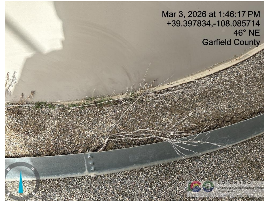
Photo # 5185 Weeds/undesirable plant species in tank battery secondary containment