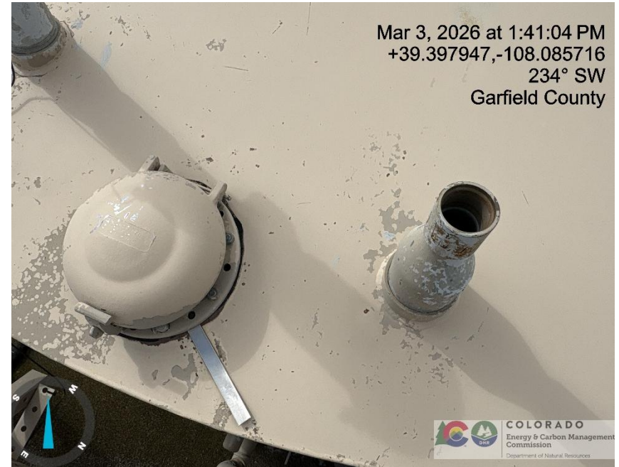
Photo # 5159 Open ended piping on unused production tank /wildlife hazard/available for entry by wildlife