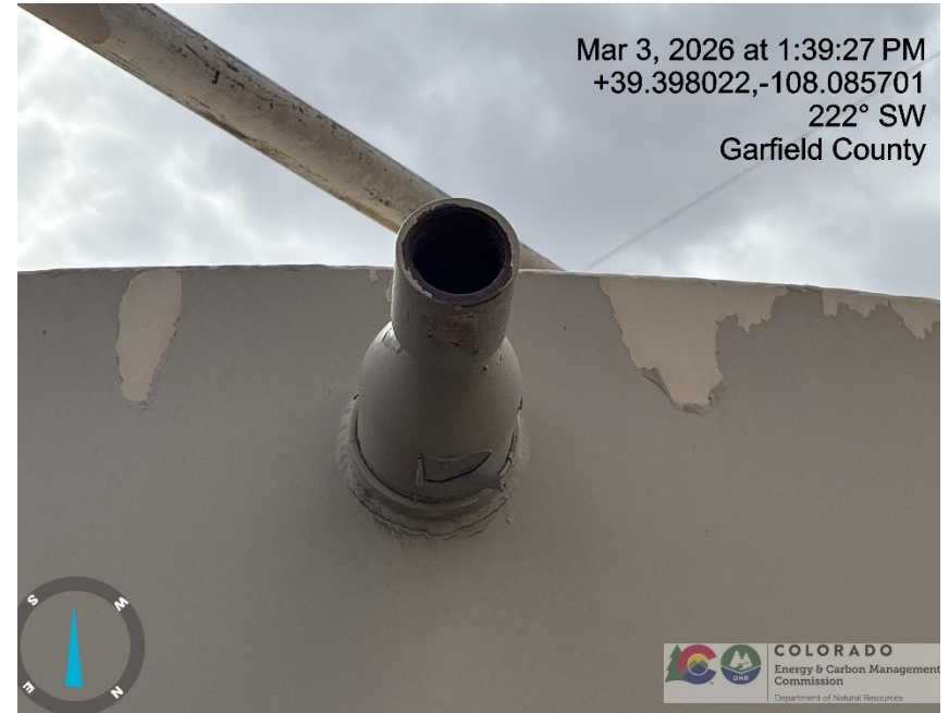
Photo # 5157 Open ended piping on unused production tank /wildlife hazard/available for entry by wildlife