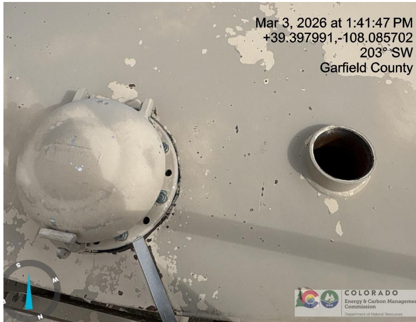
Photo # 5162 Open ended port on unused production tank/wildlife hazard/available for entry by wildlife