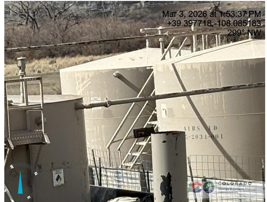
Photo # 5183 Burner exhaust stack on separator lacks bird protection