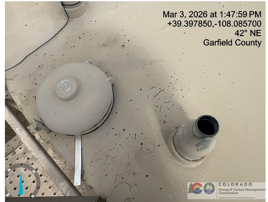
Photo # 5167 Open ended piping on unused production tank /wildlife hazard/available for entry by wildlife