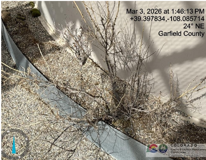
Photo # 5184 Weeds/undesirable plant species in tank battery secondary containment