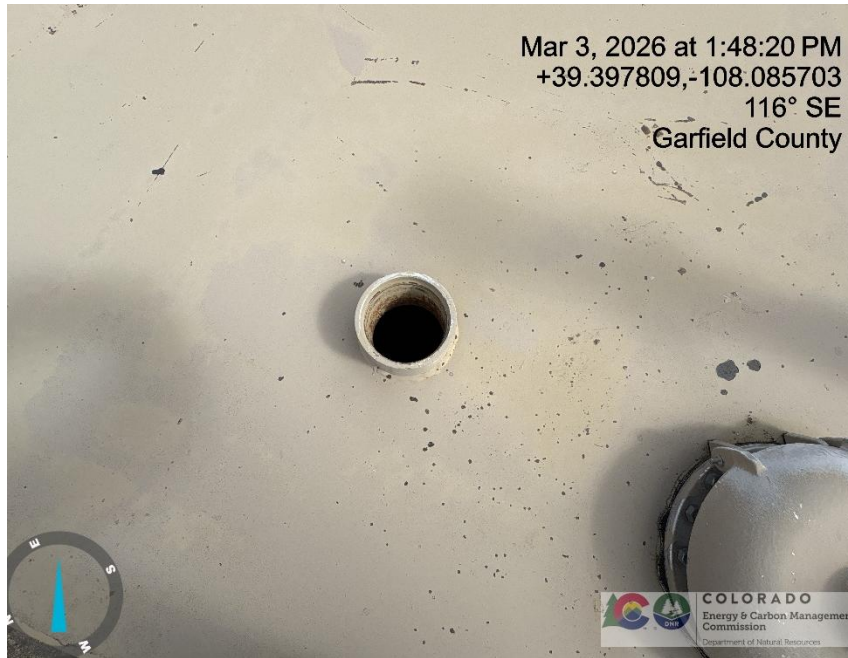
Photo # 5168 Open ended port on unused production tank/wildlife hazard/available for entry by wildlife