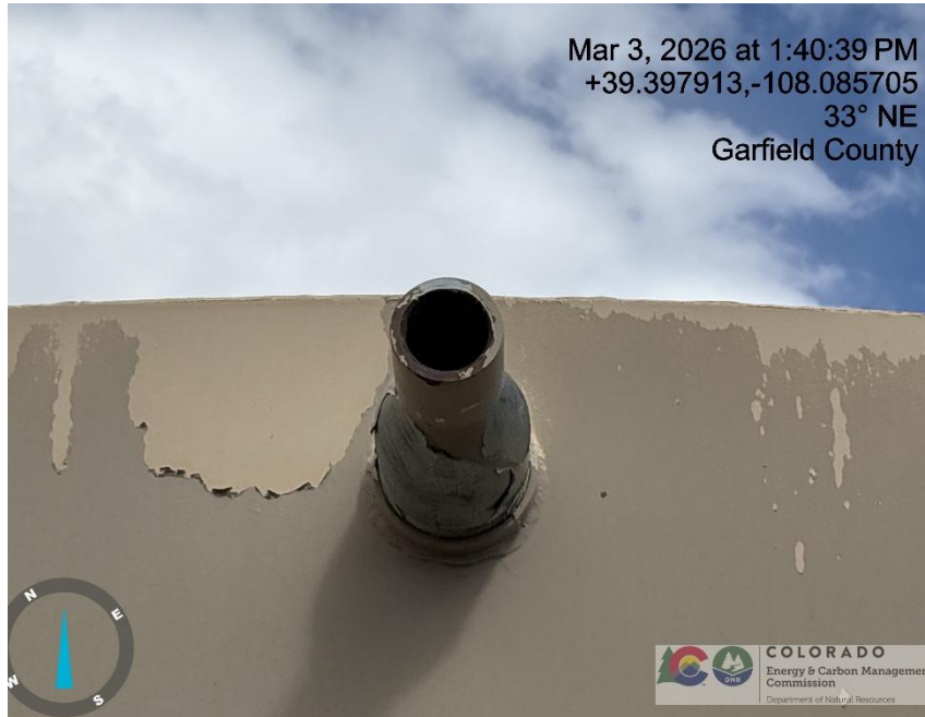
Photo # 5158 Open ended piping on unused production tank /wildlife hazard/available for entry by wildlife