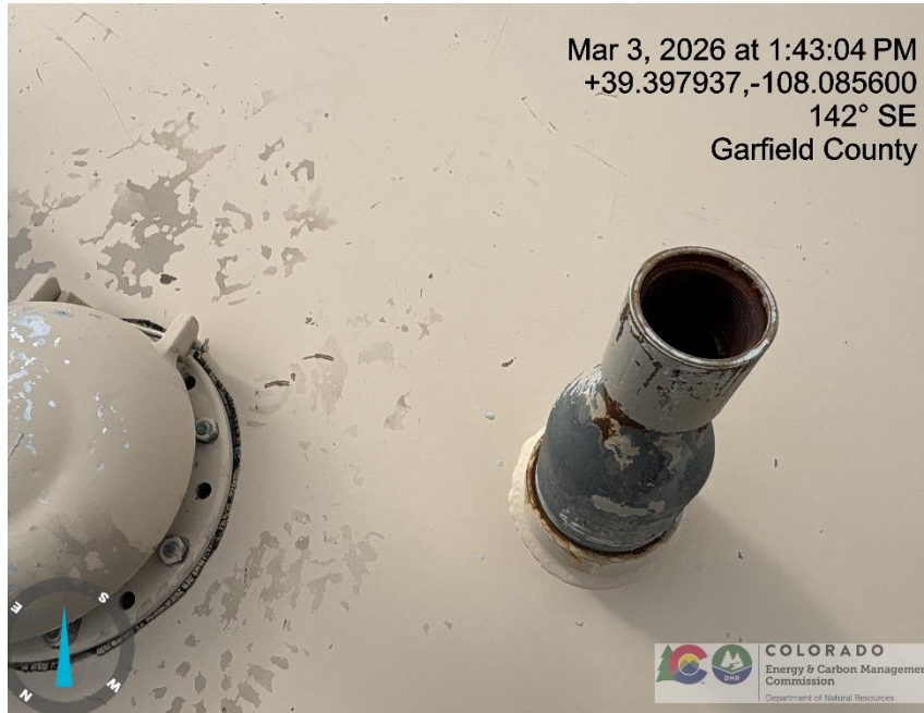
Photo # 5164 Open ended piping on unused production tank /wildlife hazard/available for entry by wildlife