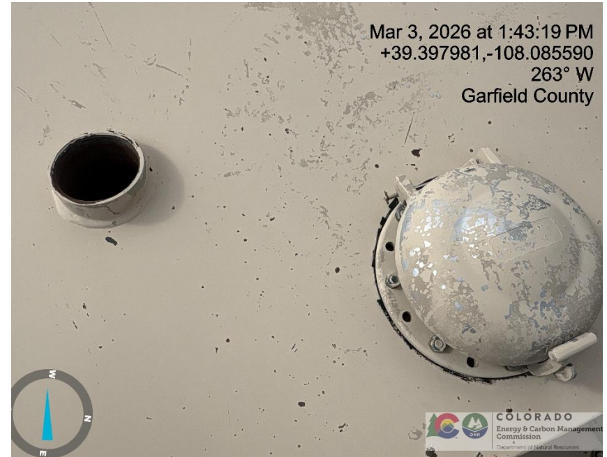
Photo # 5165 Open ended port on unused production tank/wildlife hazard/available for entry by wildlife