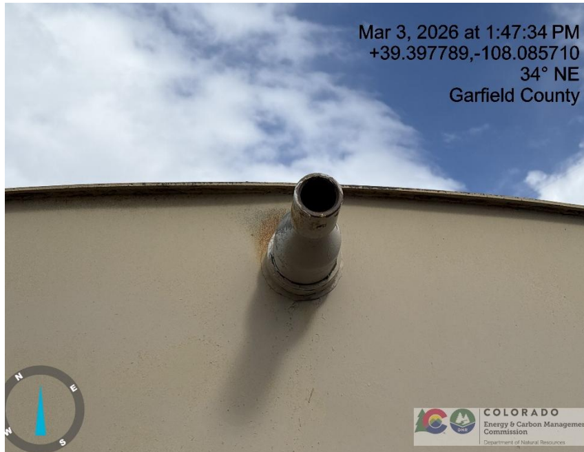
Photo # 5166 Open ended piping on unused production tank /wildlife hazard/available for entry by wildlife