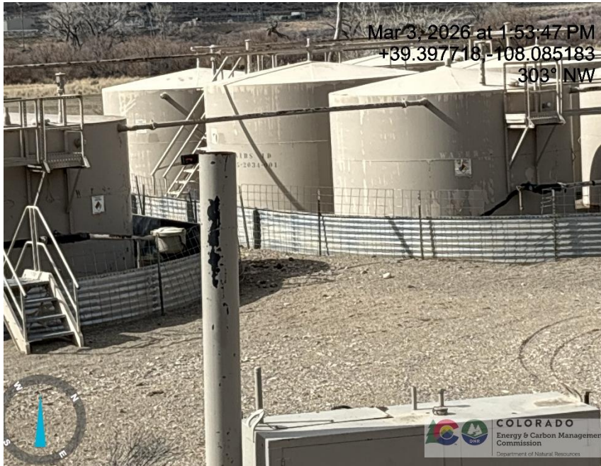
Photo # 5182 Burner exhaust stack on separator lacks bird protection