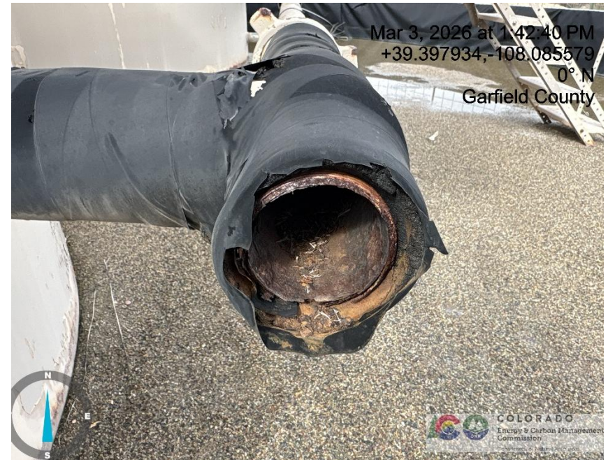
Photo # 5163 Open ended piping on unused production tank/wildlife hazard/available for entry by wildlife