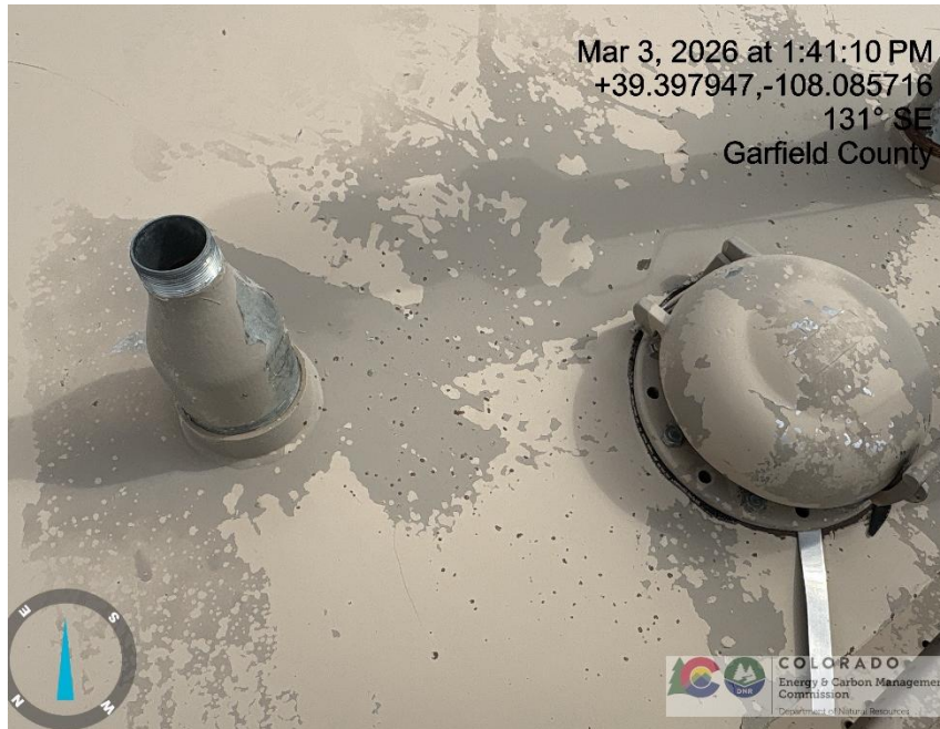
Photo # 5160 Open ended piping on unused production tank /wildlife hazard/available for entry by wildlife