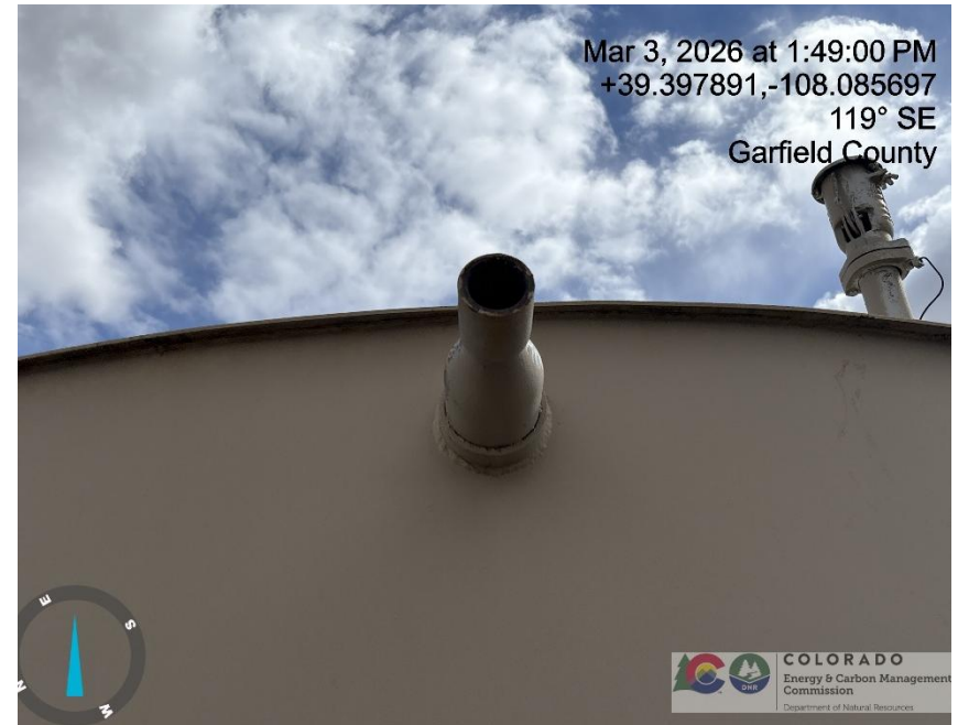
Photo # 5169 Open ended piping on unused production tank /wildlife hazard/available for entry by wildlife