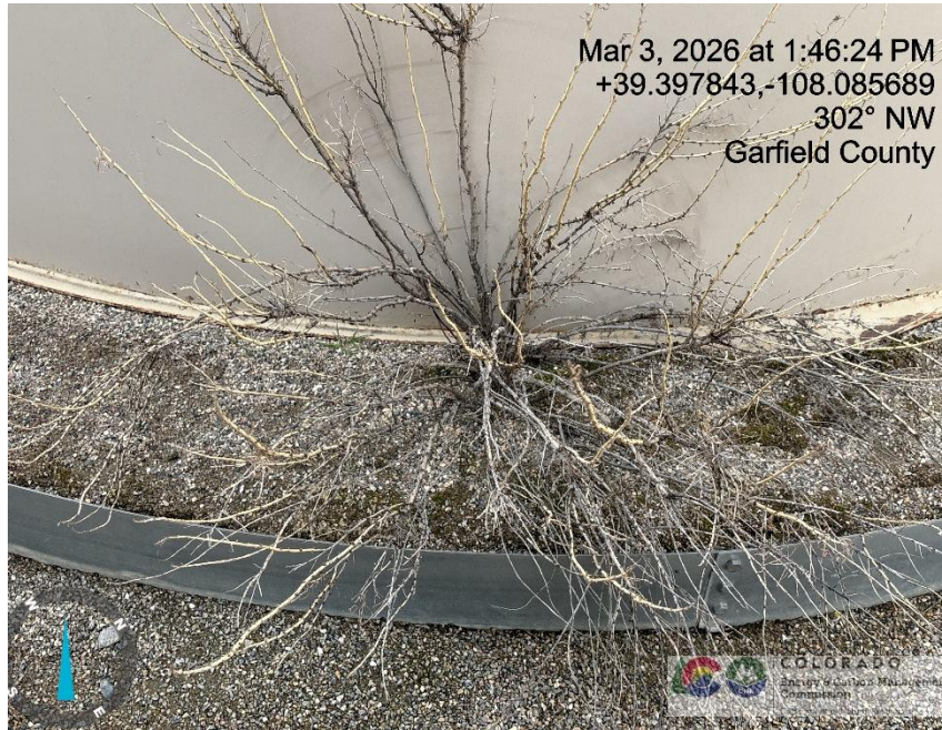
Photo # 5186 Weeds/undesirable plant species in tank battery secondary containment