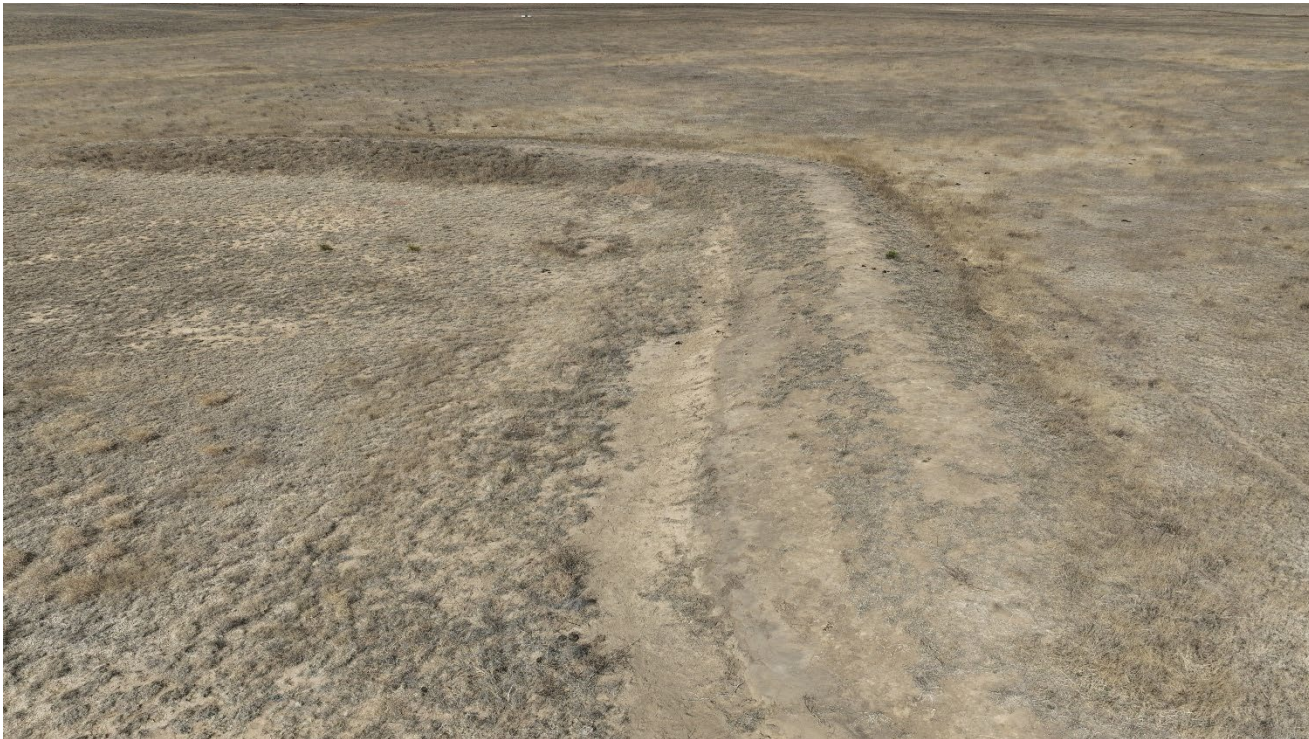
Photo 5. Facing north overlooking the cutslope which has area that are bare of vegetation.