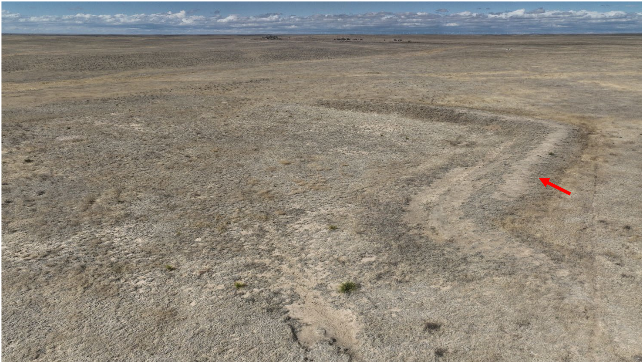
Photo 4. Drone aerial photo facing northwest overlooking the location. There is a bermed cut slope that remains along the north and east side shown at red arrow.