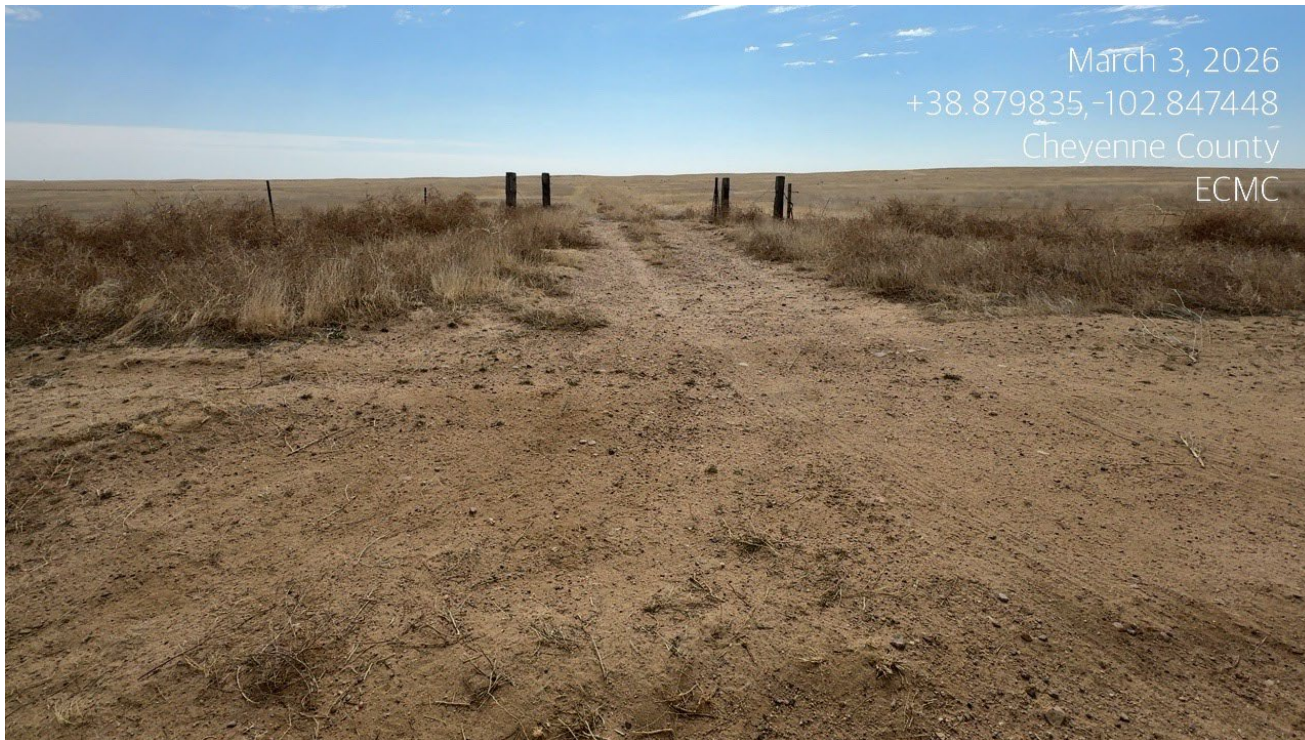
Photo 1. Facing south toward the beginning of the access road. The fence was not installed back to original position and the cattleguard remains.