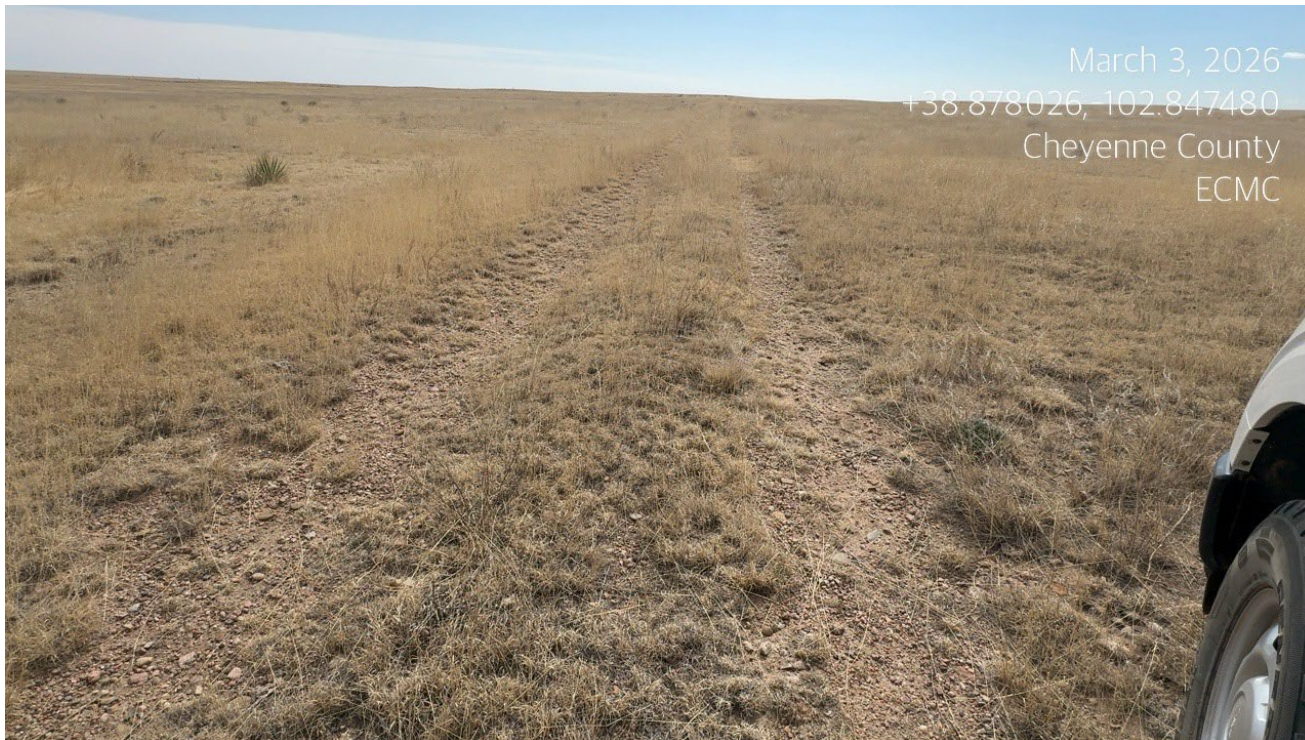
Photo 2. There is a two track road that remains through the pasture.