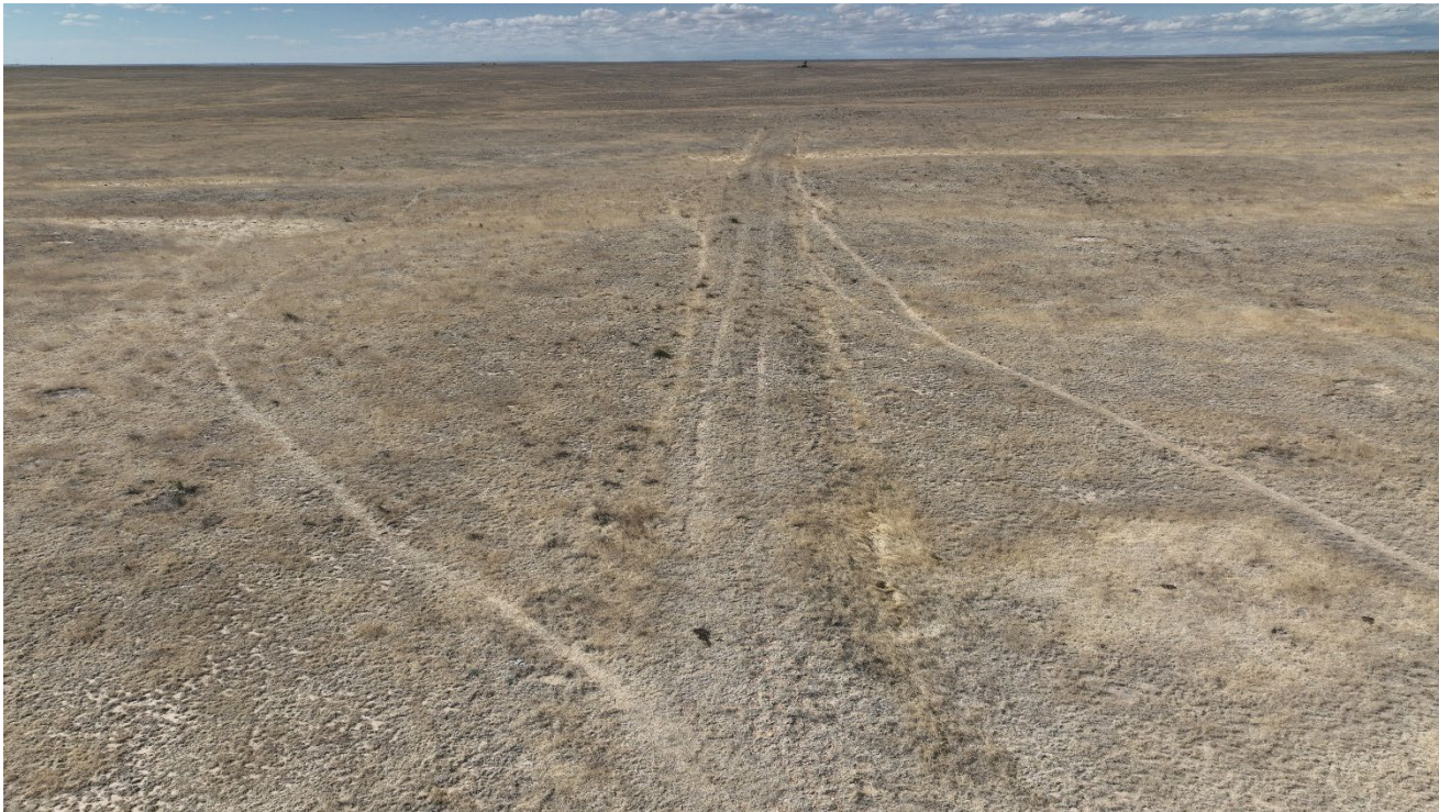
Photo 3. Drone aerial phot where access road turns to the west. The road remains elevated and was not recontoured. The native vegetation has reestablished along the former road.