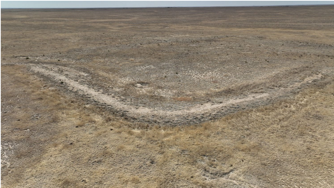
Photo 6. Drone aerial photo facing southwest toward the location.