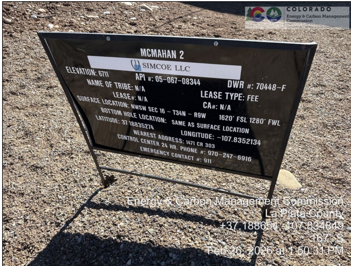
1. Well Sign.