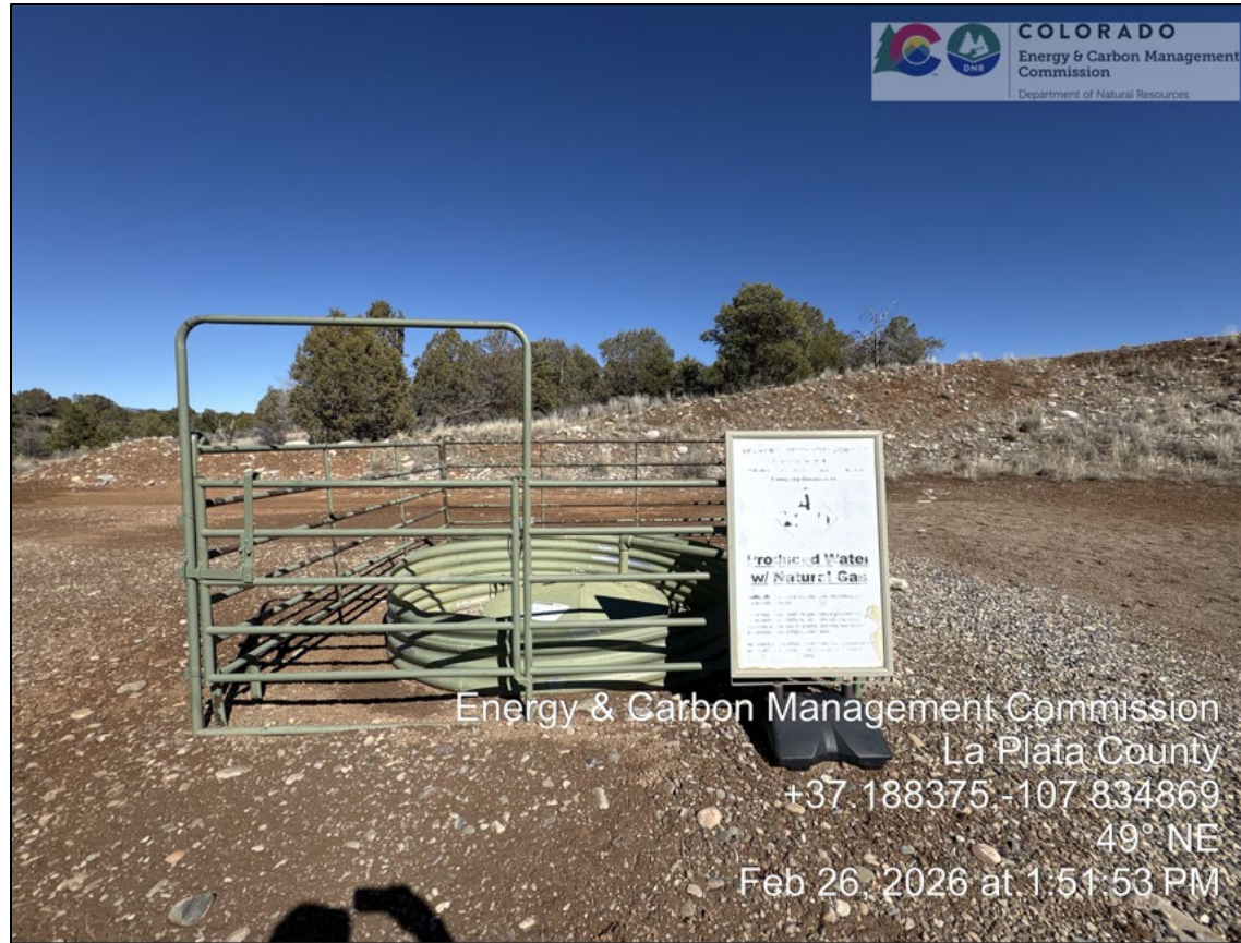
4. 21 BBL PBV steel tank with steel secondary containment. Sign is becoming illegible.

Inspector Name: James Blair. Inspection Date: 02/26/2026 Inspection Doc #: 721100172