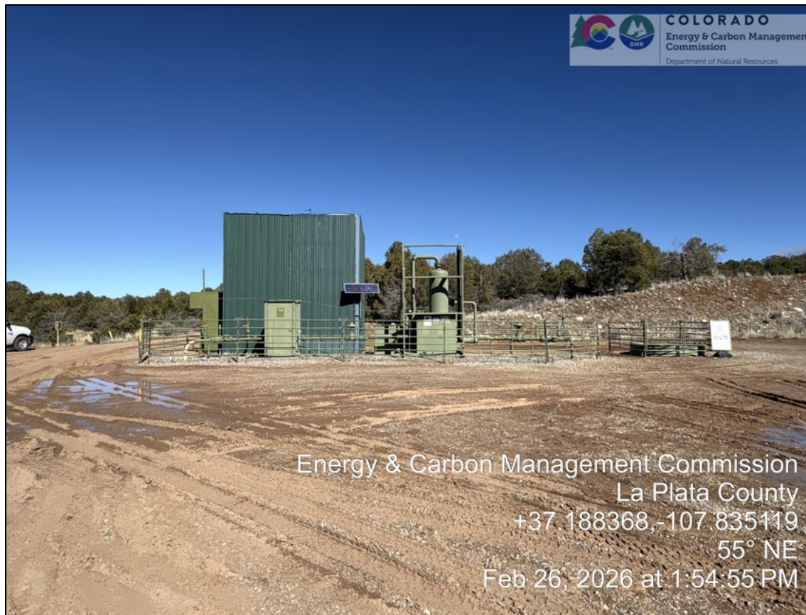
7. From left to right: Compressor sound shed, meter run, vertical heated separator, flow lines, and 21 bbl PBV tank in containment.

Inspector Name: James Blair. Inspection Date: 02/26/2026 Inspection Doc #: 721100172