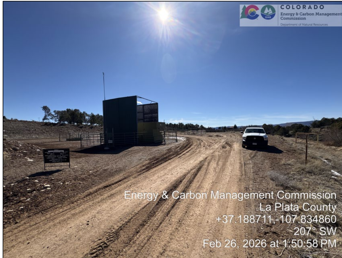
3. Location overview from access road showing well sign and compressor sound shed.

Inspector Name: James Blair. Inspection Date: 02/26/2026 Inspection Doc #: 721100172