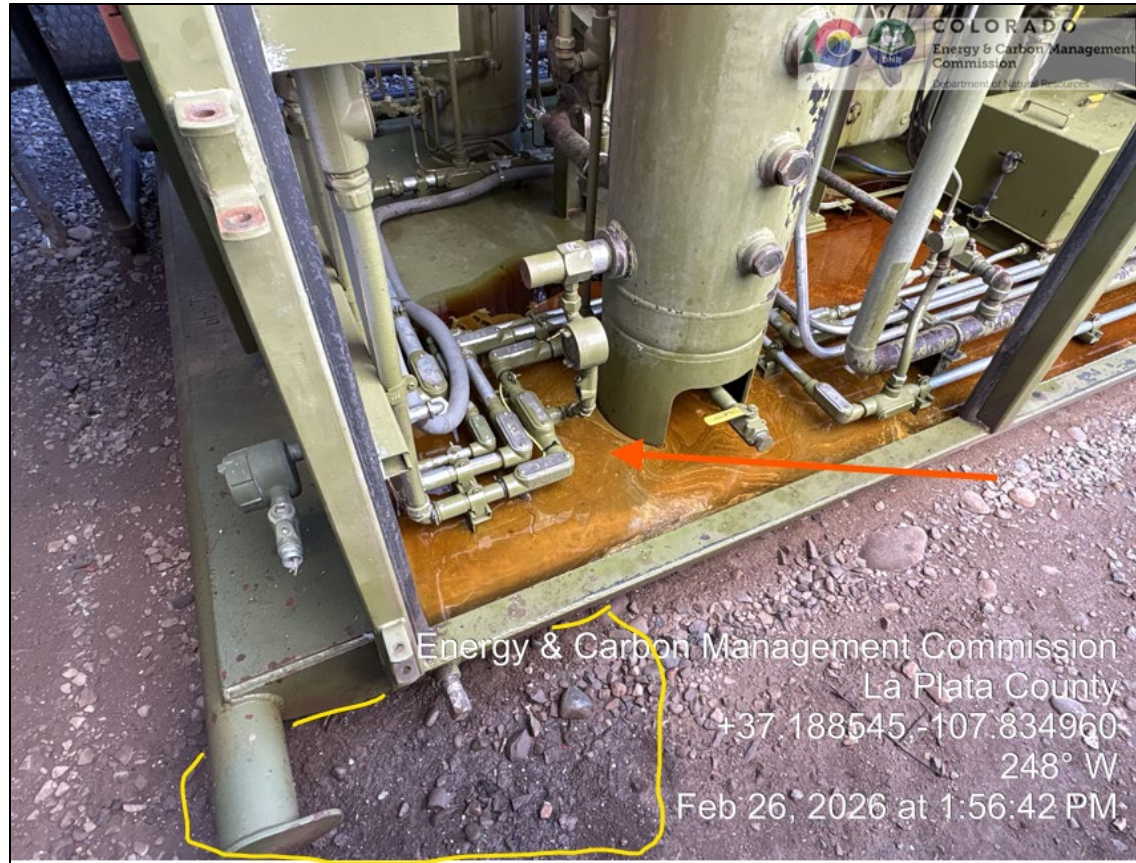
2. Stained soil outlined in yellow caused by what appears to be mixture of oil and water from compressor motor indicated by red arrow.

Inspector Name: James Blair. Inspection Date: 02/26/2026 Inspection Doc #: 721100172