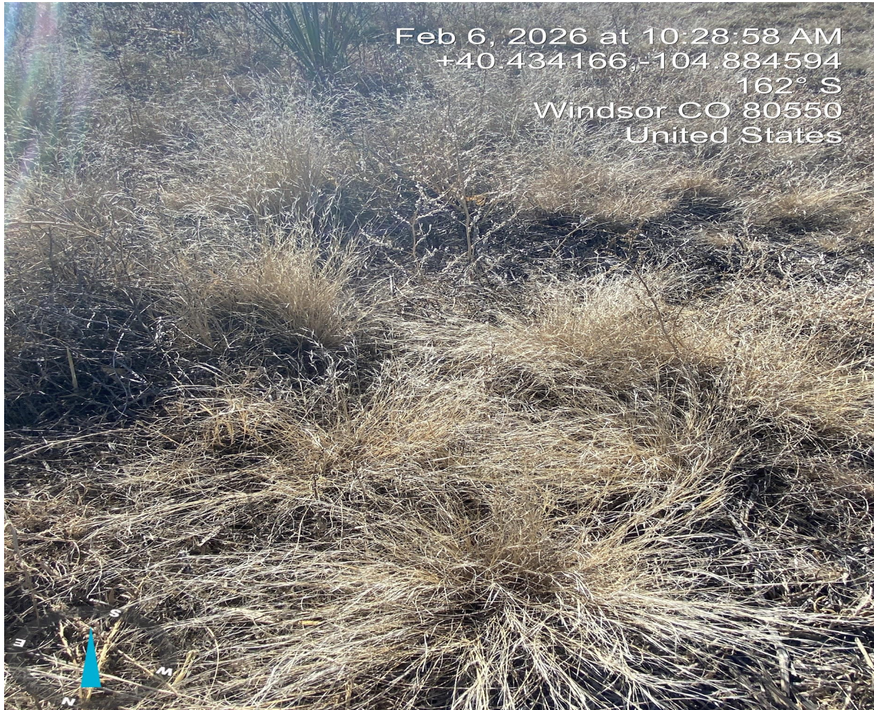
Photo 9. Photo shows native desirable grass species just off of location on the south eastern side of well head.