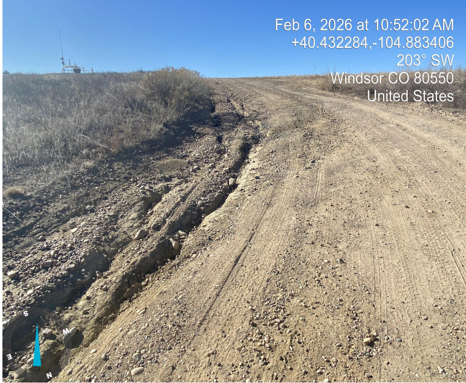
Photo 15. Photo shows erosion on main access road.