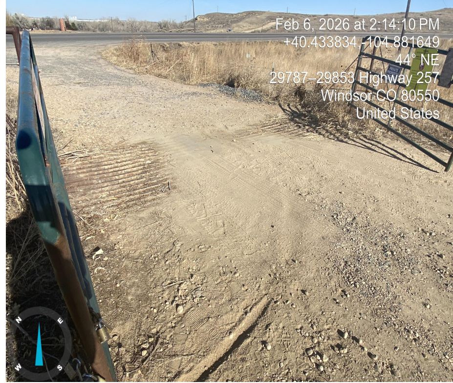
Photo 16. Photo shows soil from main access road filling cattle guard at the access gate to SH 257.