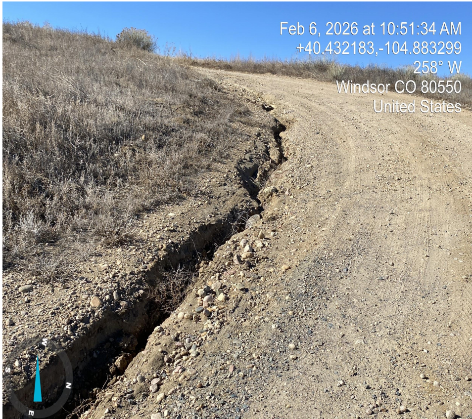
Photo 13. Photo shows erosion on main access road.