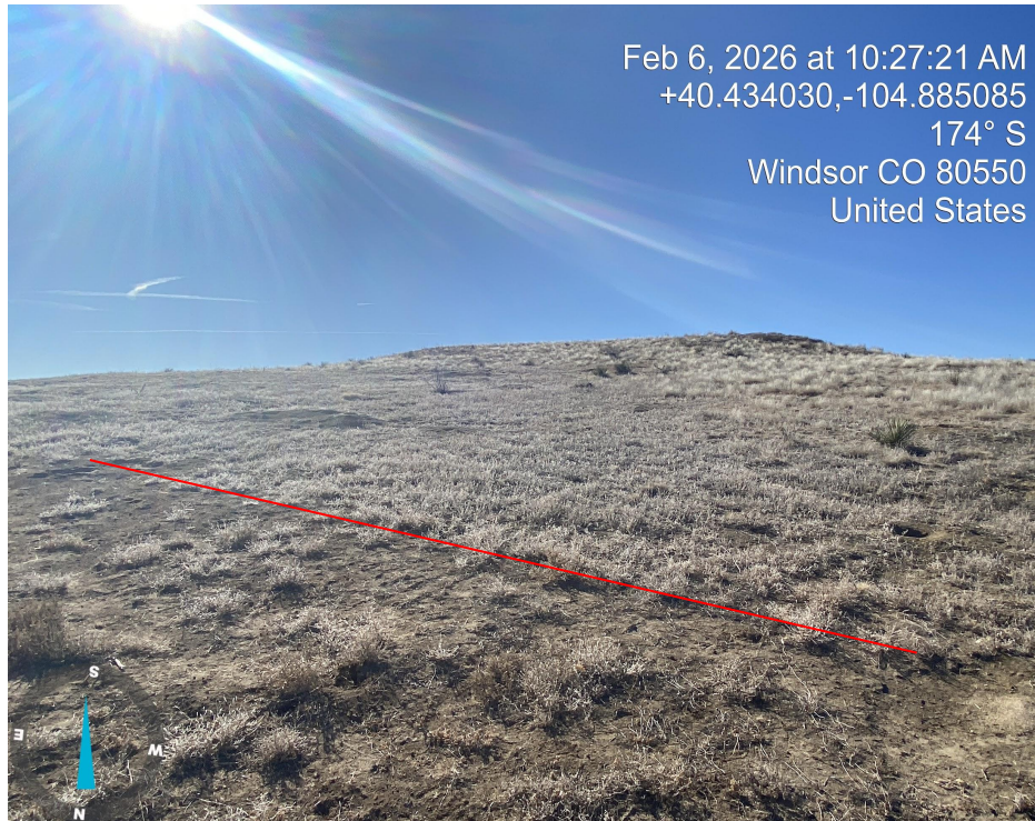
Photo 5. Photo taken from southern end of location facing south. Clear line is present where disturbance occurred and vegetation is lacking. Above redline is undisturbed and below was disturbed.