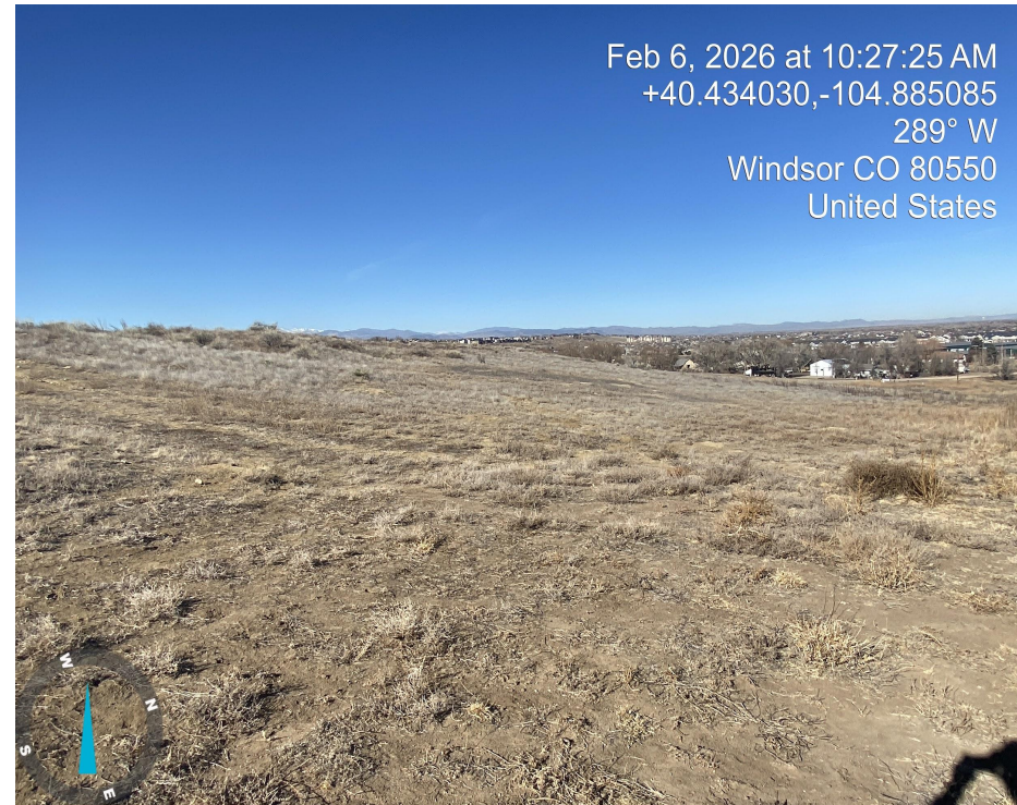
Photo 6. Photo taken from location facing north west, on the north west corner of the well pad. See comment in photo 3.