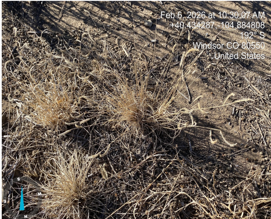
Photo 10. Photo shows desirable grass species that was present on location giving some evidence of previous reclamation work however undesirable plants outnumber natives significantly.