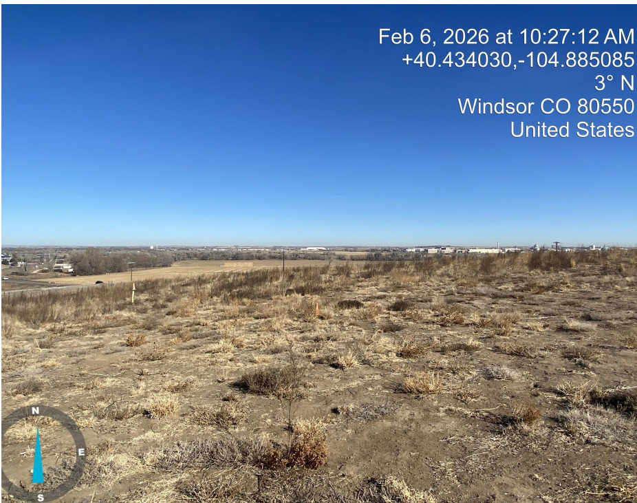
Photo 3. Photo taken from location facing north, shows overview of the location. Location does not meet final reclamation standards significant area is bare and large number of weeds are present on location.