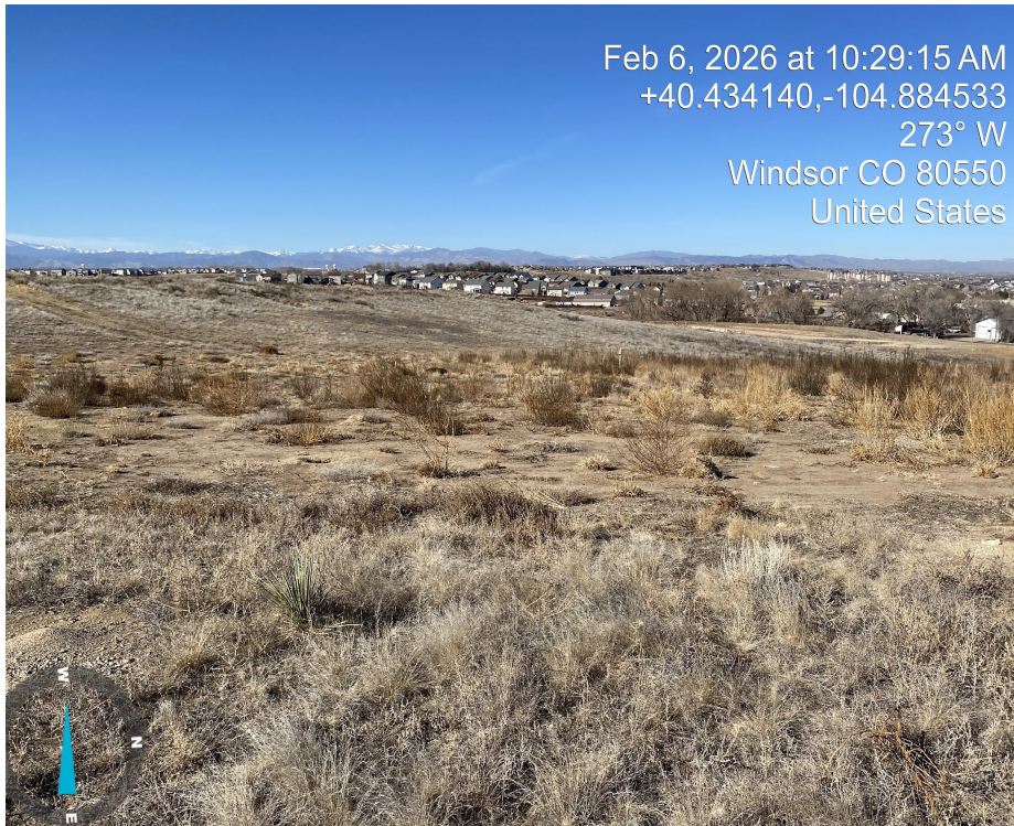
Photo 7. Photo taken from southeastern edge of location facing west. There is a clear line where well pad was. Where well pad was weeds are present and significant bare areas are present throughout the location.