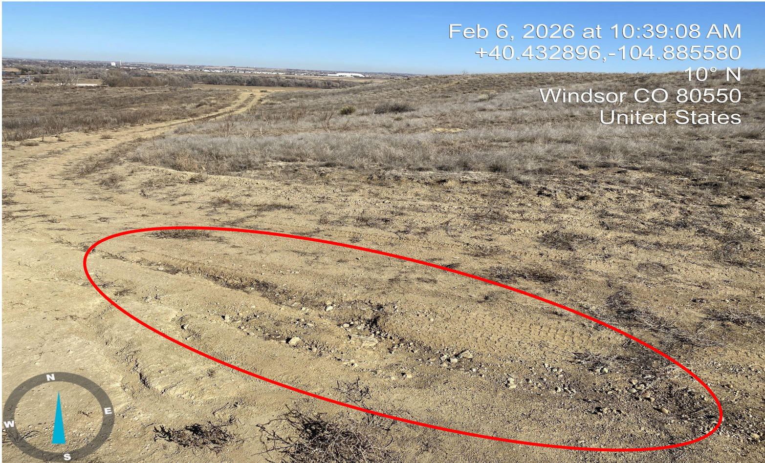
Photo 12. Photo shows location access road has not been reclaimed, is mostly bare and there is evidence of stormwater erosion (red circle) .

Feb 6, 2026 at 10:39:08 AM +40.432896,-104.885580 10° N Windsor CO 80550 United States