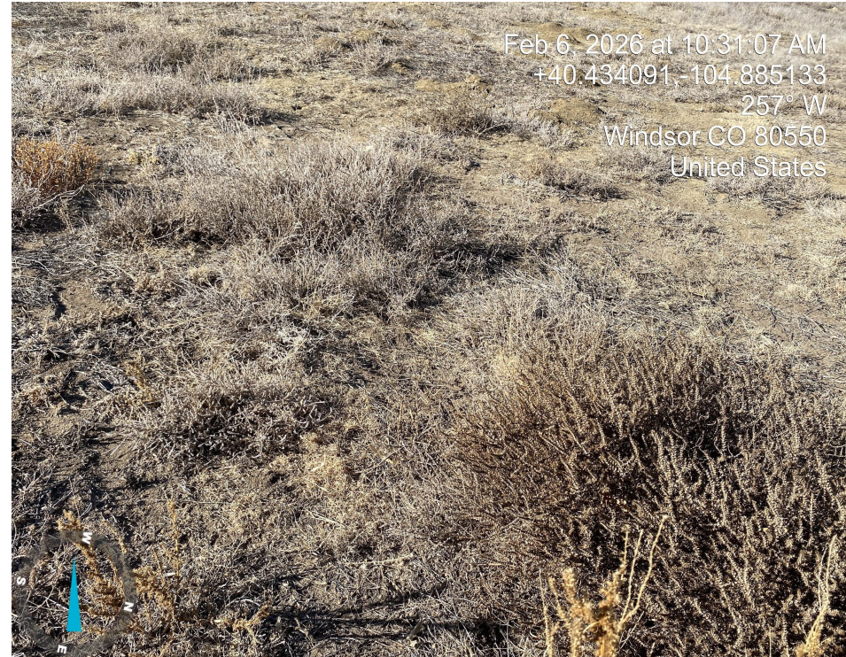
Photo 11. Photo shows undesirable plant species russian thistle present on location