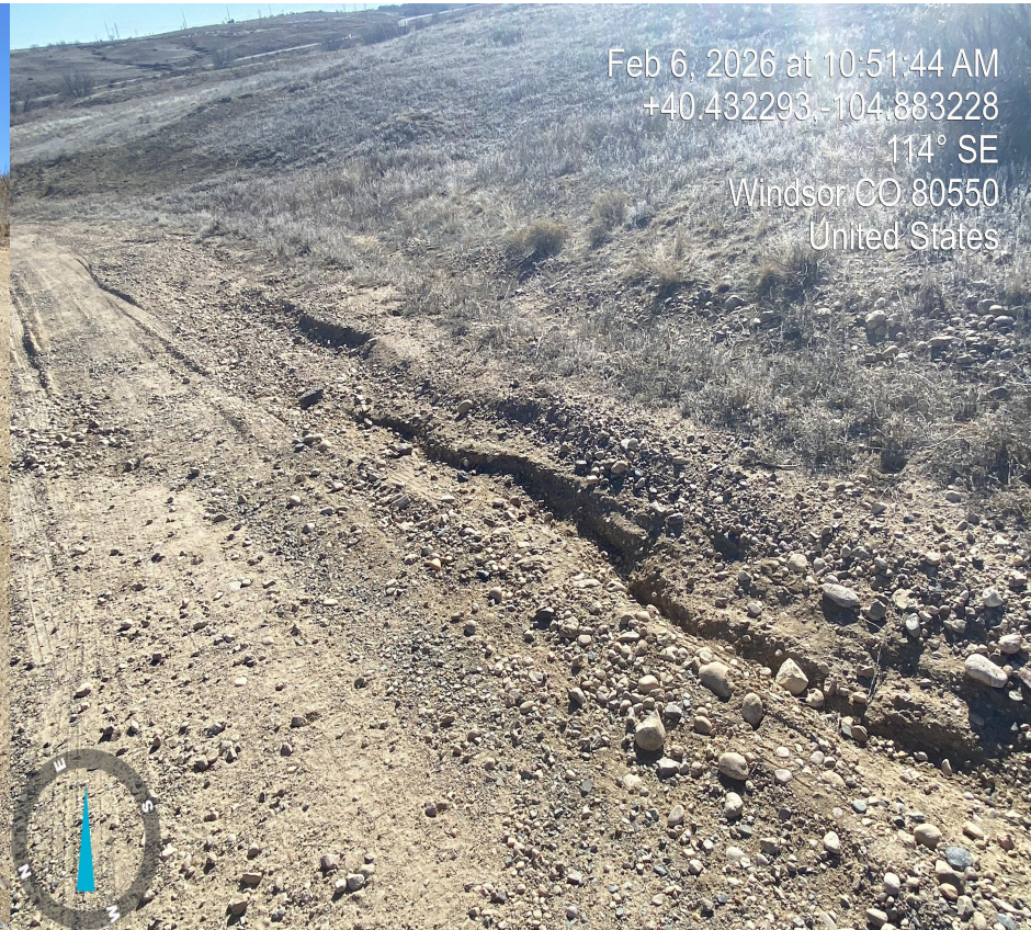
Photo 14. Photo shows erosion on main access road.