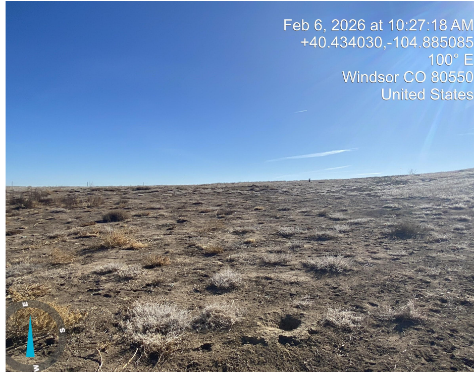
Photo 4. Photo taken from location facing east. See comments under photo 3.