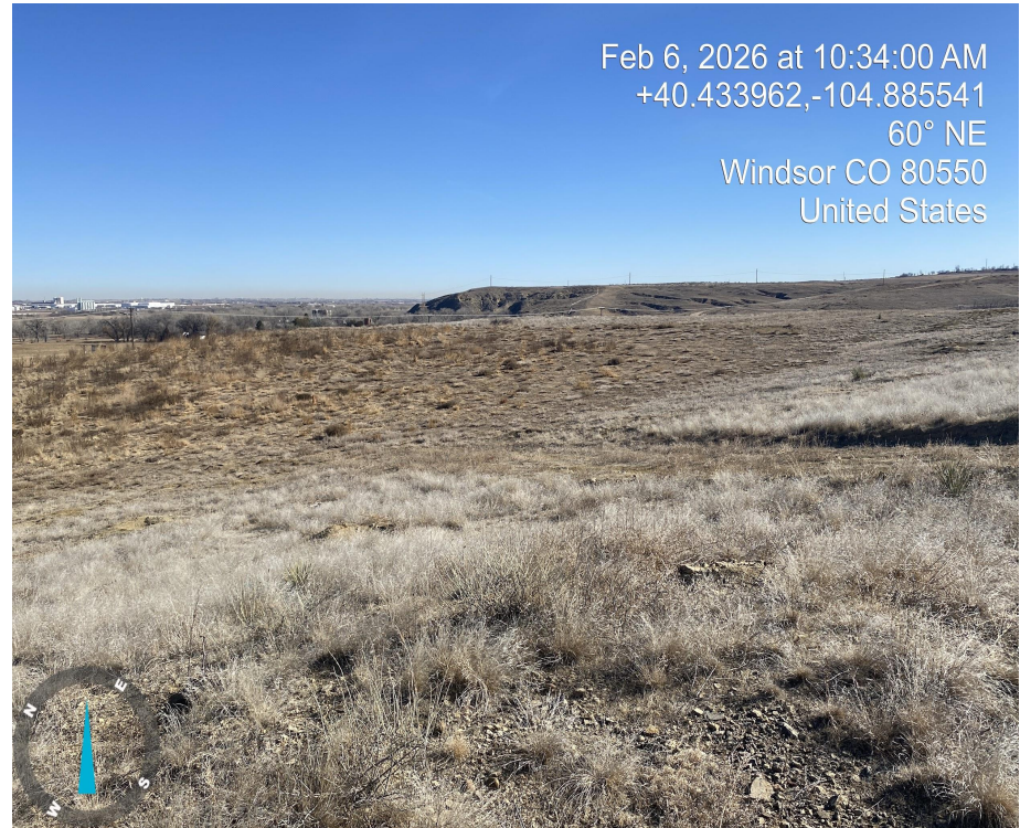
Photo 8. Photo taken from the south western side of well pad demonstrating a clear outline of where the well pad was and where the road enters.