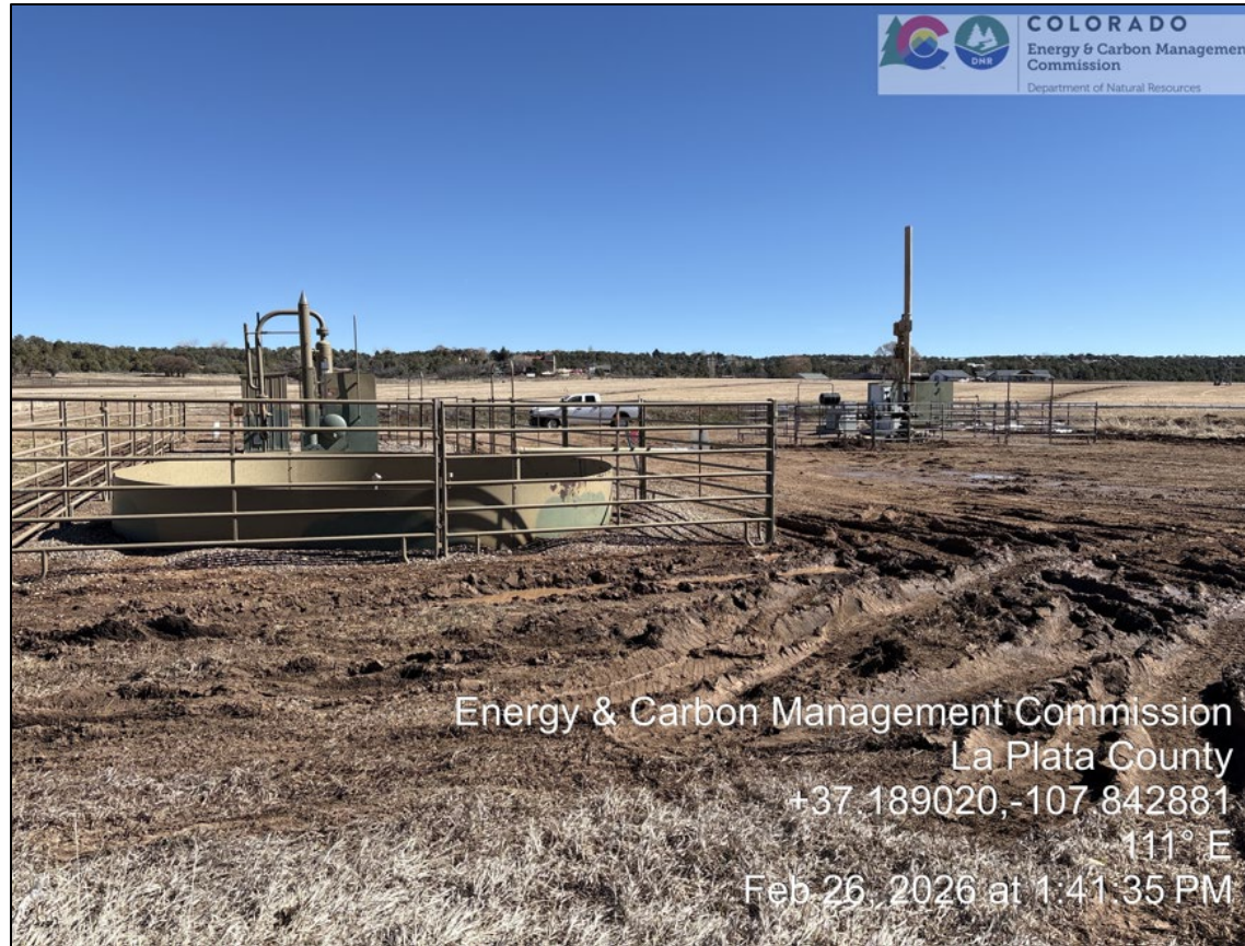
9. Location looking east. Note ruts in foreground from workover a few days prior.

Inspection Photos Simcoe/ Mach Natural Resources – JOE HOTTER #2 API # 05-067-08708 Inspector Name: James Blair. Inspection Date: 02/26/2026 Inspection Doc #: 721100166