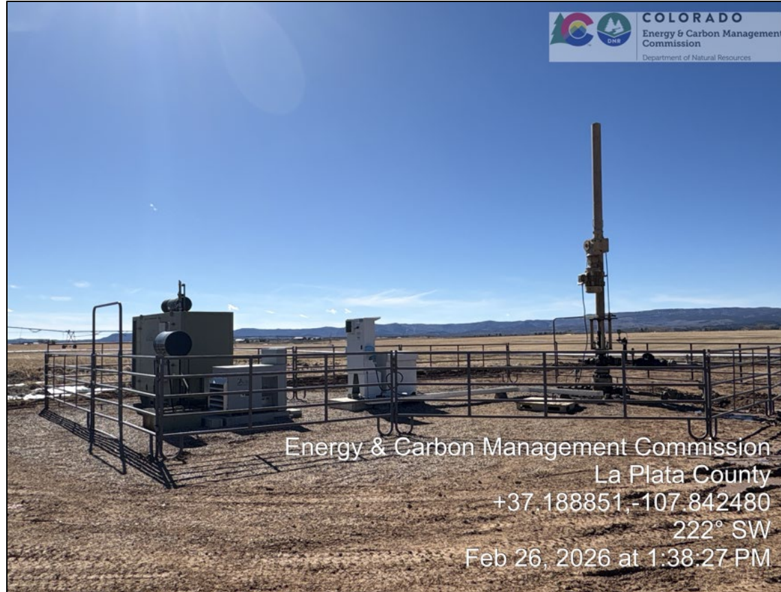
4. Wellhead, progressive cavity pump, and electrical controls behind cattle panel fence.

Inspection Photos Simcoe/ Mach Natural Resources – JOE HOTTER #2 API # 05-067-08708 Inspector Name: James Blair. Inspection Date: 02/26/2026 Inspection Doc #: 721100166