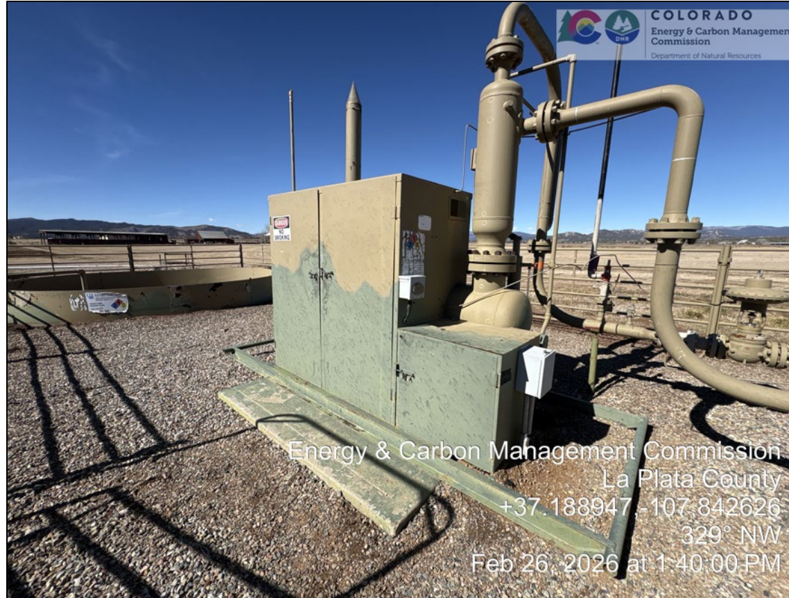
7. Horizontal heated separator.

Inspection Photos Simcoe/ Mach Natural Resources – JOE HOTTER #2 API # 05-067-08708 Inspector Name: James Blair. Inspection Date: 02/26/2026 Inspection Doc #: 721100166