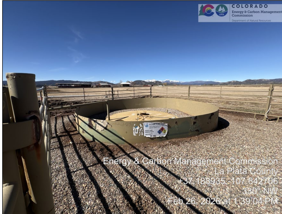
05. PBV tank and secondary containment.

Inspection Photos Simcoe/ Mach Natural Resources – JOE HOTTER #2 API # 05-067-08708 Inspector Name: James Blair. Inspection Date: 02/26/2026 Inspection Doc #: 721100166