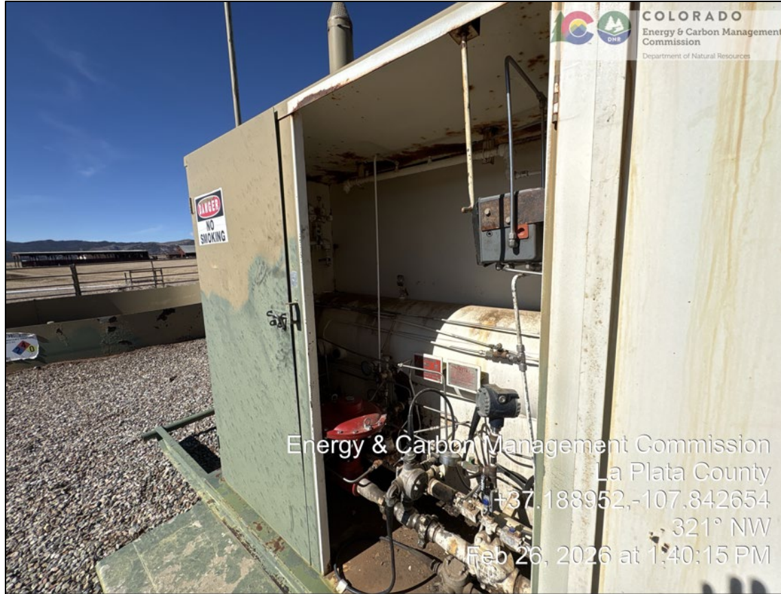
8. Inside horizontal heated separator.