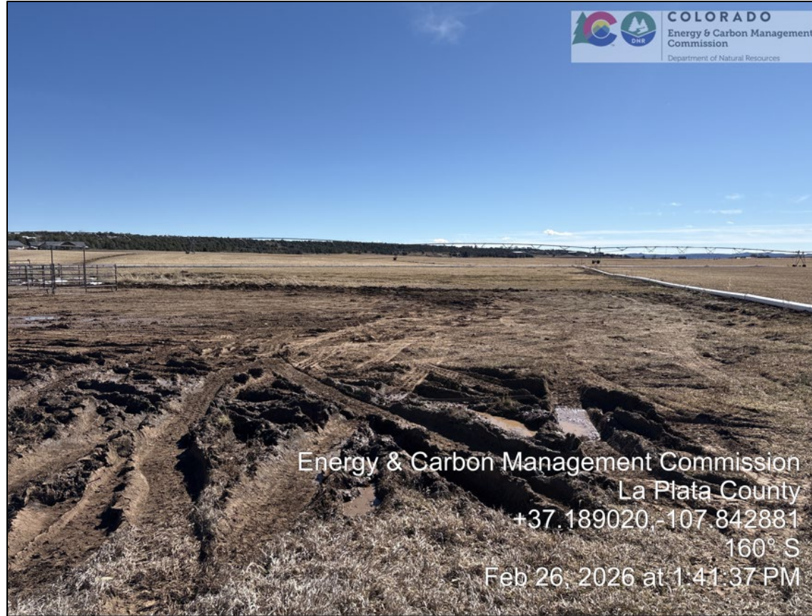
11 Ruts on pad. Ag fields immediately adjacent.