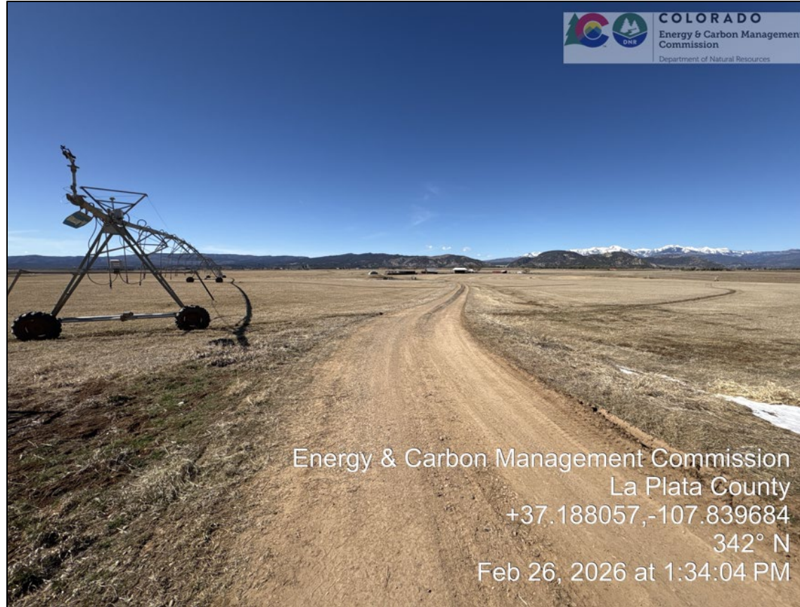
12. Access road looking towards well location.

Inspection Photos Simcoe/ Mach Natural Resources – JOE HOTTER #2 API # 05-067-08708 Inspector Name: James Blair. Inspection Date: 02/26/2026 Inspection Doc #: 721100166