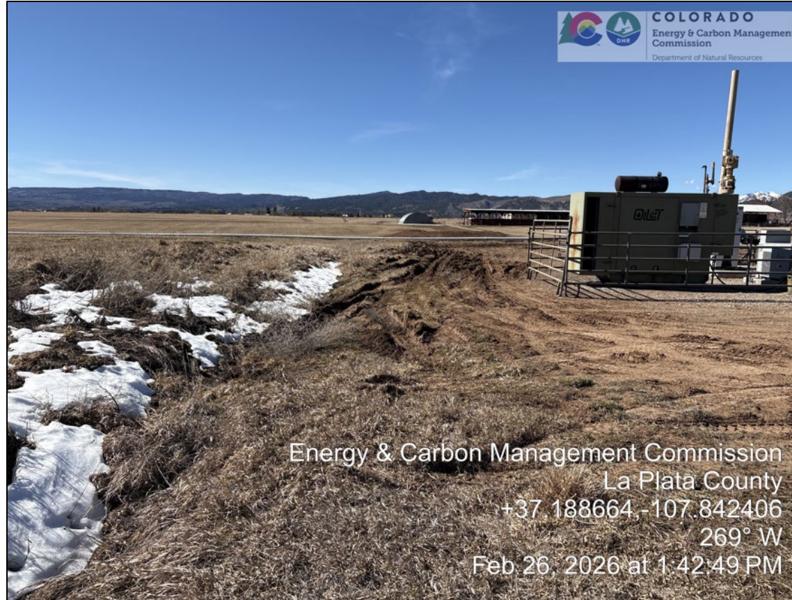
10. Drainage ditch separates location from ag field.

Inspection Photos Simcoe/ Mach Natural Resources – JOE HOTTER #2 API # 05-067-08708 Inspector Name: James Blair. Inspection Date: 02/26/2026 Inspection Doc #: 721100166