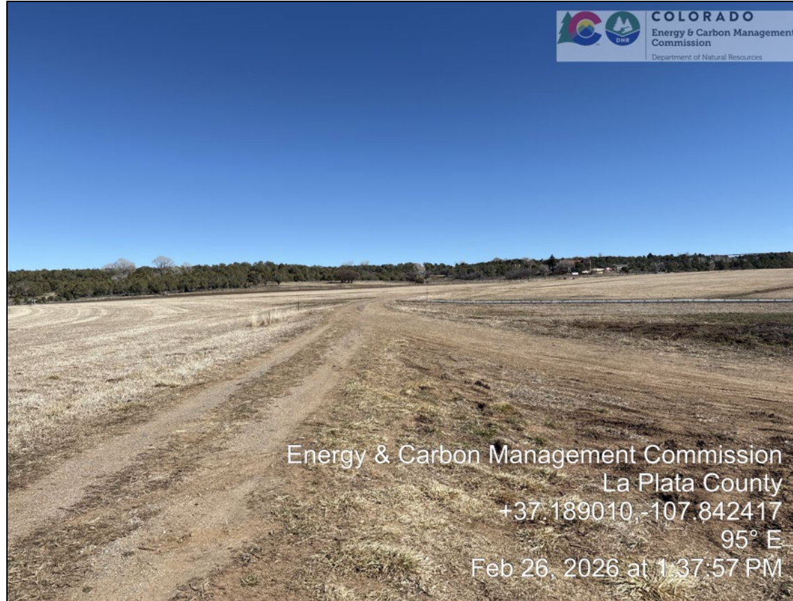
13. Access road from well location looking east.

Inspection Photos Simcoe/ Mach Natural Resources – JOE HOTTER #2 API # 05-067-08708 Inspector Name: James Blair. Inspection Date: 02/26/2026 Inspection Doc #: 721100166