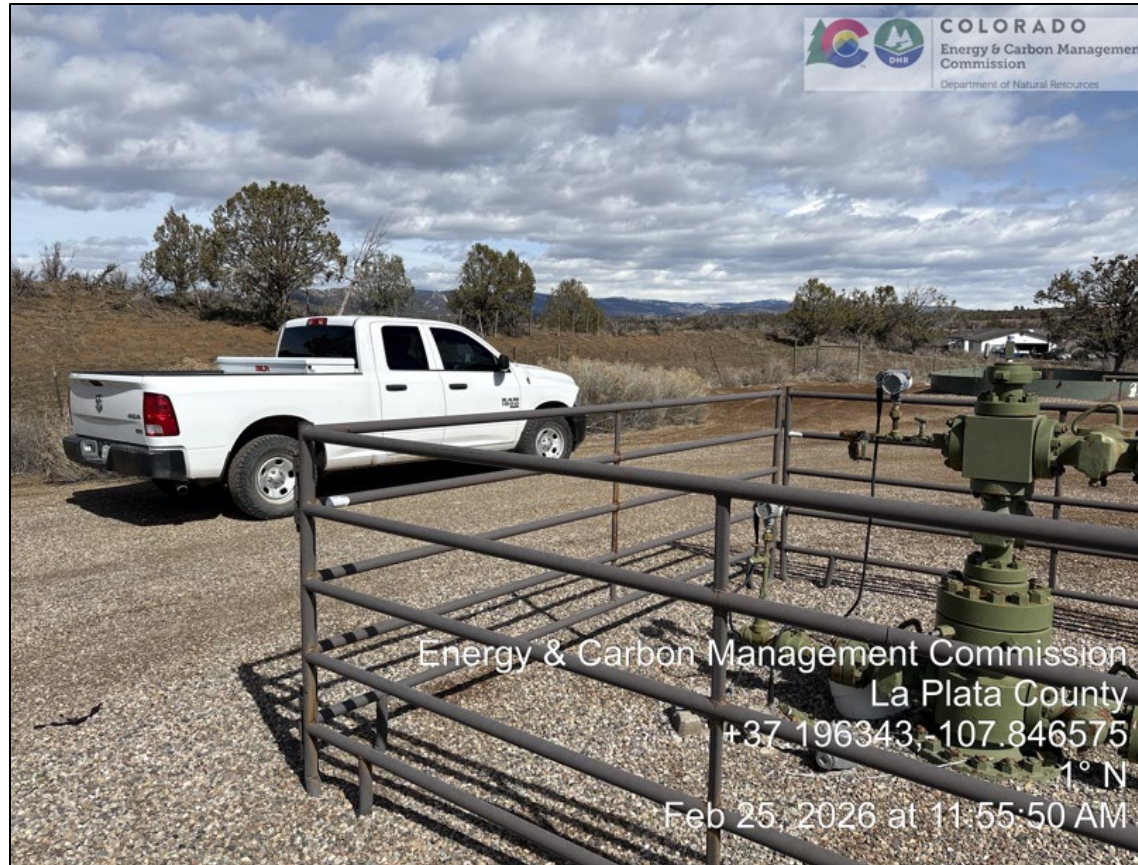
15. View of well pad looking due north from wellhead.

Inspector Name: James Blair. Inspection Date: 02/25/2026 Inspection Doc #: 721100157