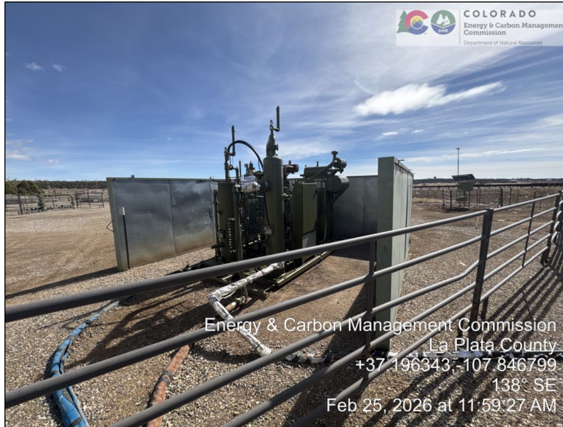
07. Compressor behind sound wall. Motor was running at time of inspection.

Inspector Name: James Blair. Inspection Date: 02/25/2026 Inspection Doc #: 721100157