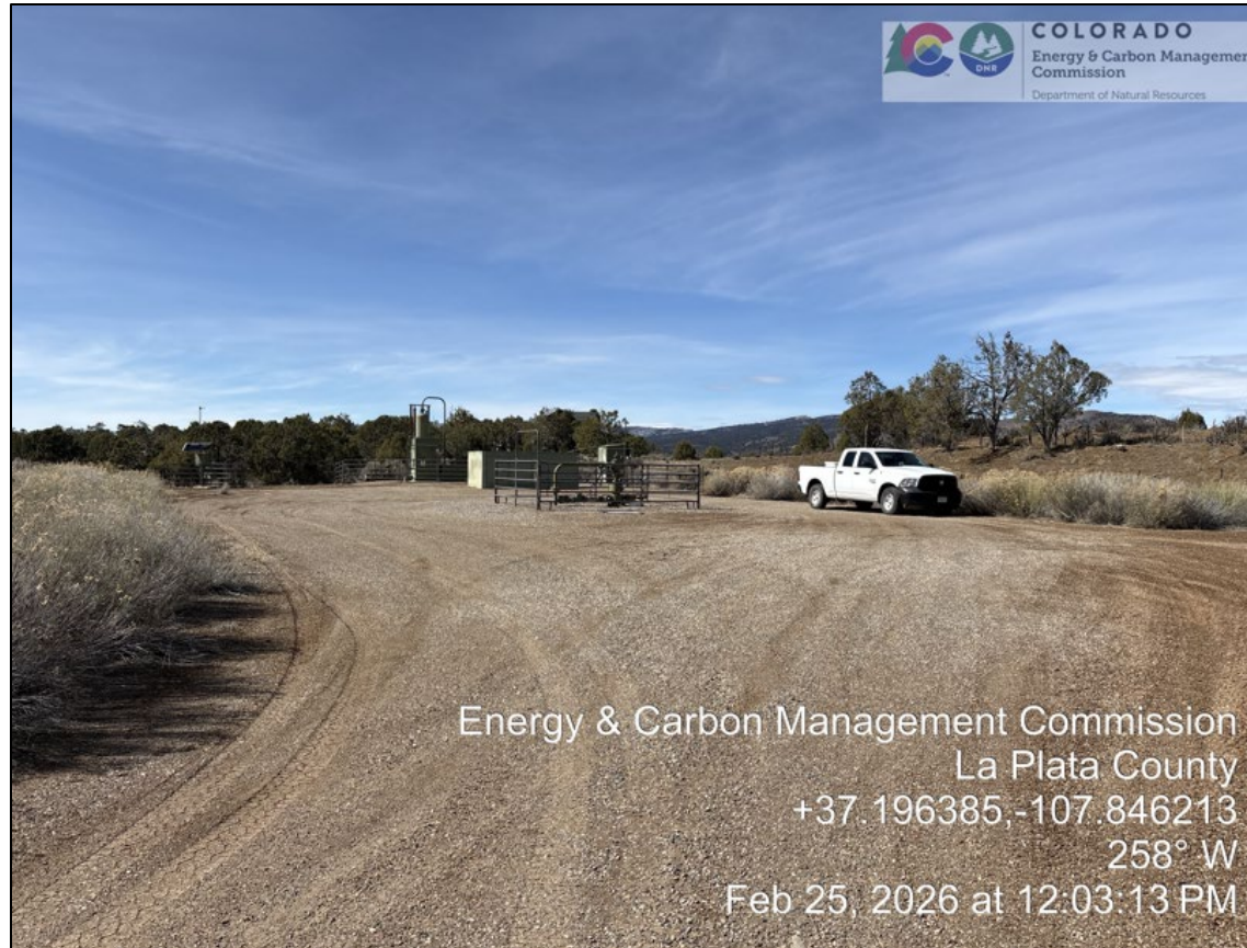
14. View of well pad from entrance gate. Gate was open at time of inspection.

Inspector Name: James Blair. Inspection Date: 02/25/2026 Inspection Doc #: 721100157