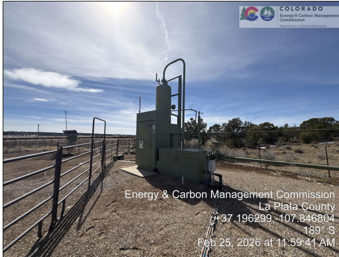
05. Vertical heated separator inside cattle panel fence. Telemetry and solar behind to left.

Inspector Name: James Blair. Inspection Date: 02/25/2026 Inspection Doc #: 721100157