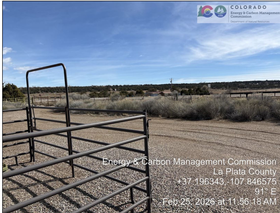
18. View looking due east from wellhead. US HWY 550 is just east of location. Barbed wire and mesh fence is visible.

Inspector Name: James Blair. Inspection Date: 02/25/2026 Inspection Doc #: 721100157