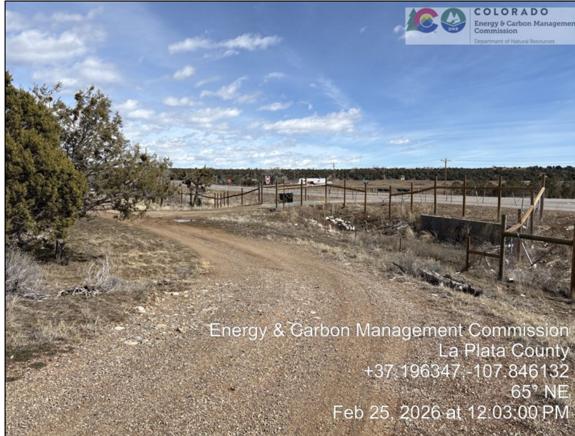
12. Access road looking to the northeast to highway 550, adjacent to site.

Inspector Name: James Blair. Inspection Date: 02/25/2026 Inspection Doc #: 721100157