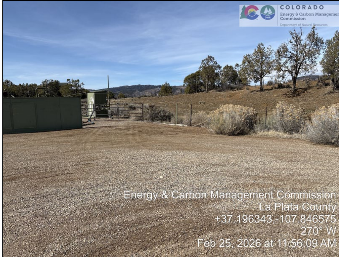
17. View looking due west from wellhead.

Inspector Name: James Blair. Inspection Date: 02/25/2026 Inspection Doc #: 721100157