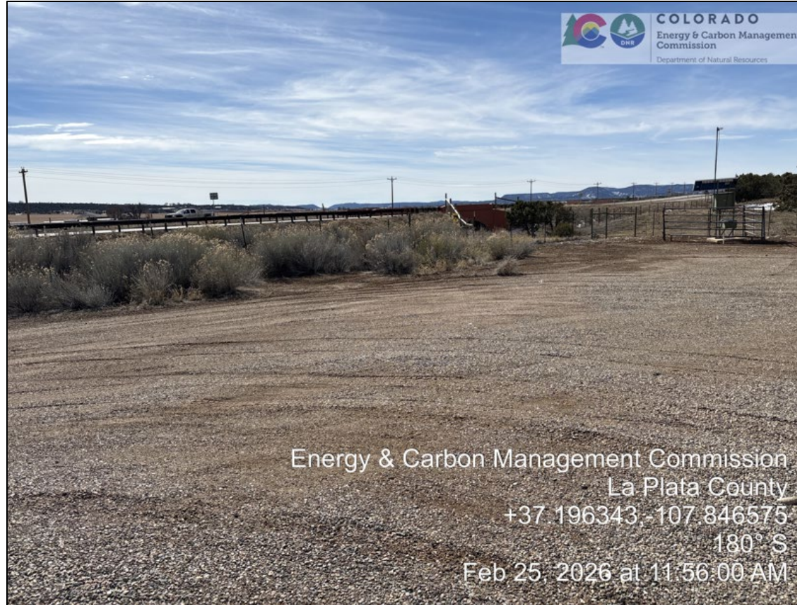
16. View looking due south from wellhead.

Inspector Name: James Blair. Inspection Date: 02/25/2026 Inspection Doc #: 721100157