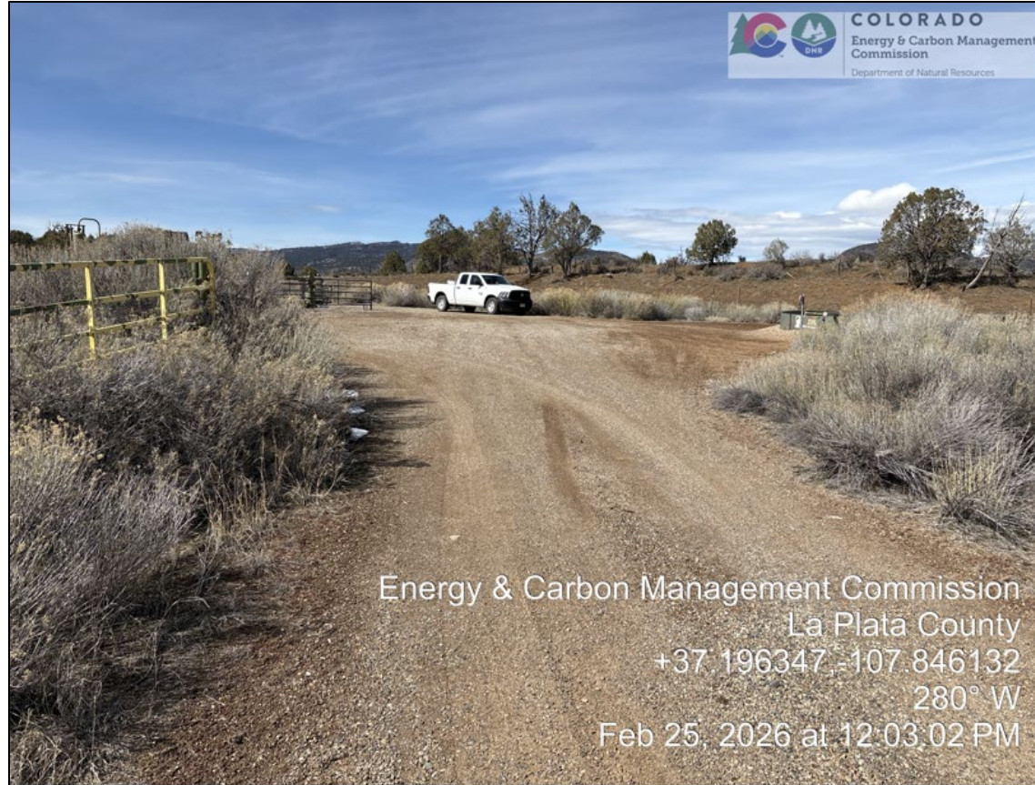
13. Access road to well pad looking west.

Inspector Name: James Blair. Inspection Date: 02/25/2026 Inspection Doc #: 721100157