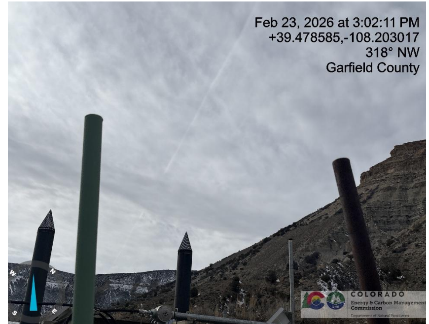
Photo # 2803 PRV vent lines do not comply with CECMC pressure safety device rules