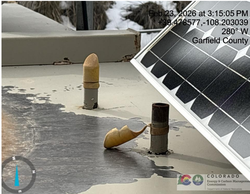
Photo # 2806 Rupture disc vent line does not comply with CECMC pressure safety device rules