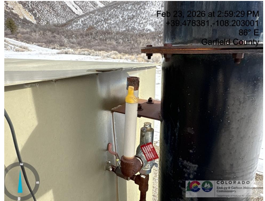
Photo # 2807 PRV vent line does not comply with CECMC pressure safety device rules