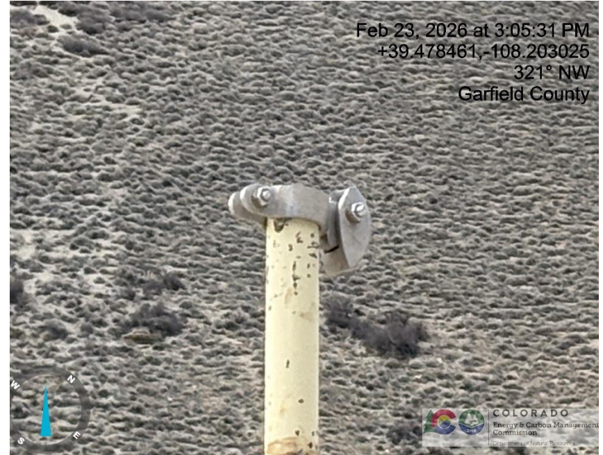
Photo # 2804 PRV vent line does not comply with CECMC pressure safety device rules