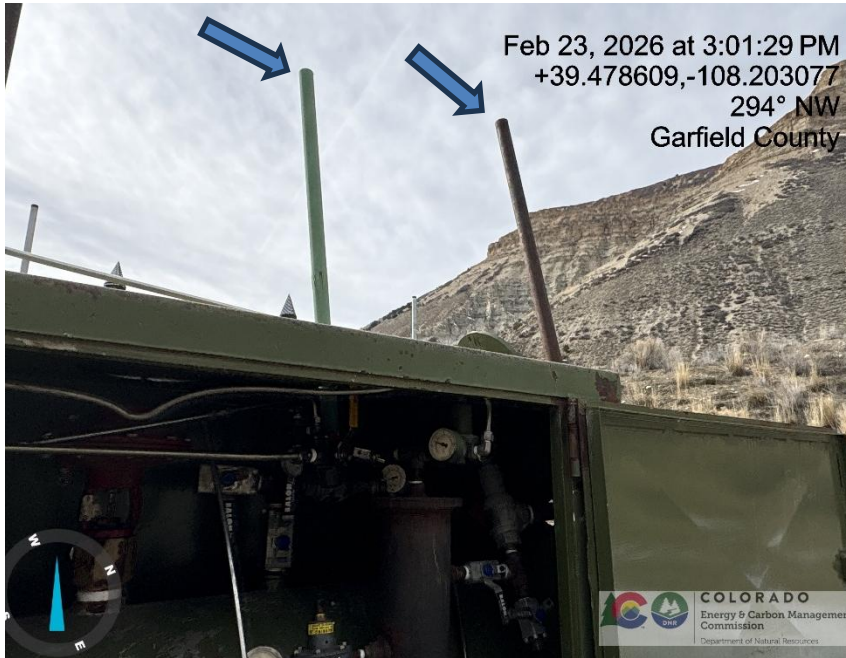
Photo # 2802 PRV vent lines do not comply with CECMC pressure safety device rules