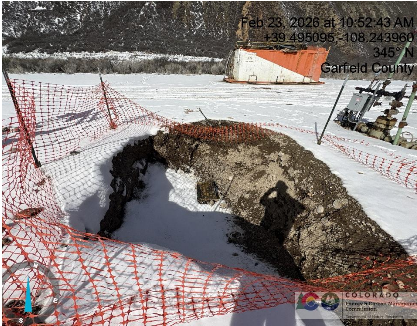
Photo # 1567 Wildlife & safety protection around hole needs maintenance