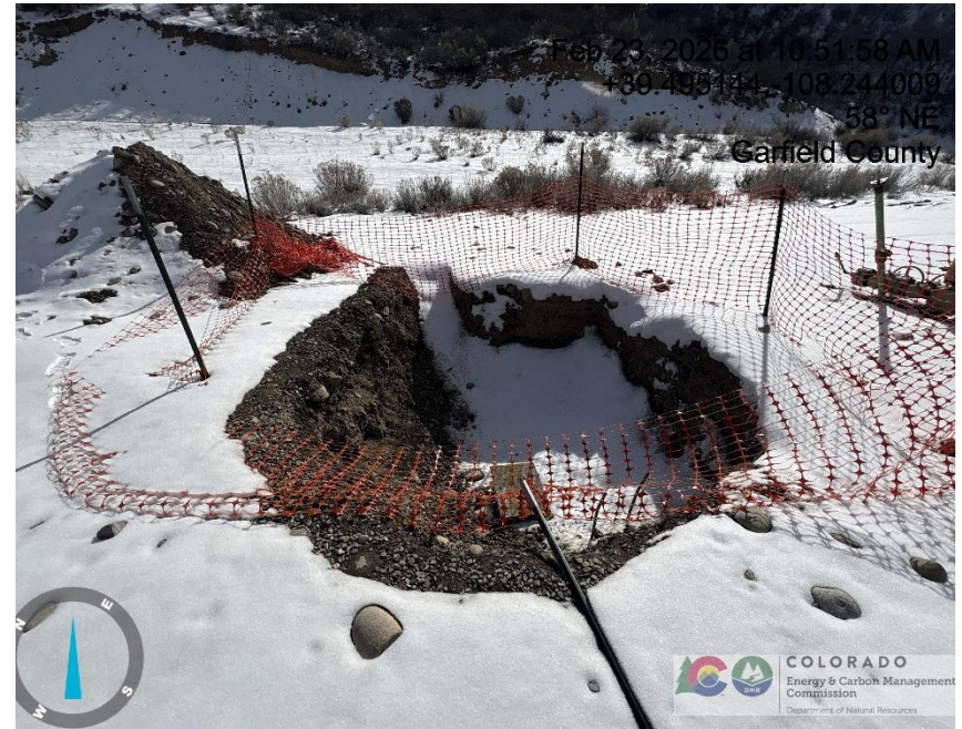
Photo # 1566 Wildlife & safety protection around hole needs maintenance