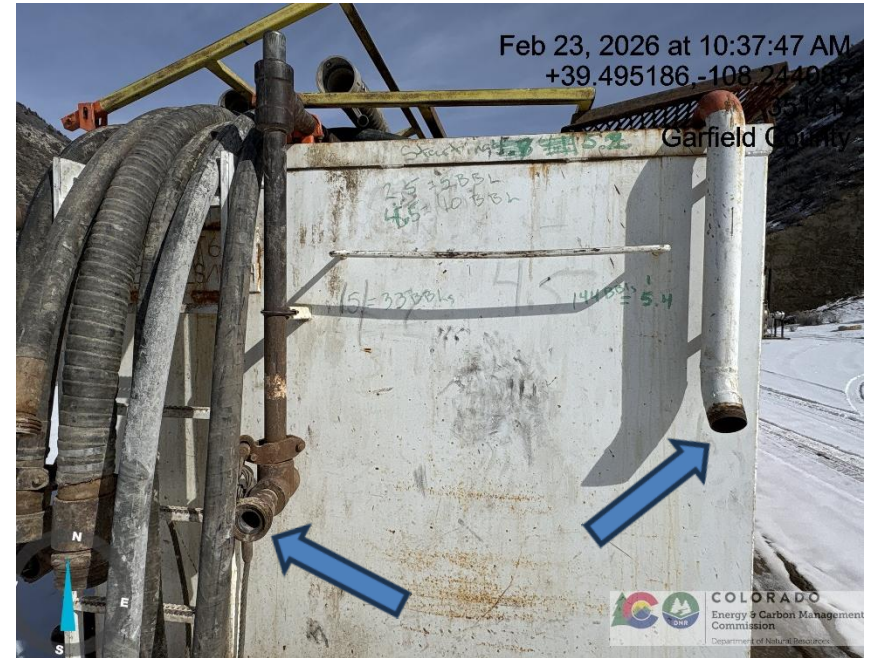
Photo # 1564 Open ended pipes on stored equipment /wildlife hazards/available for entry by wildlife