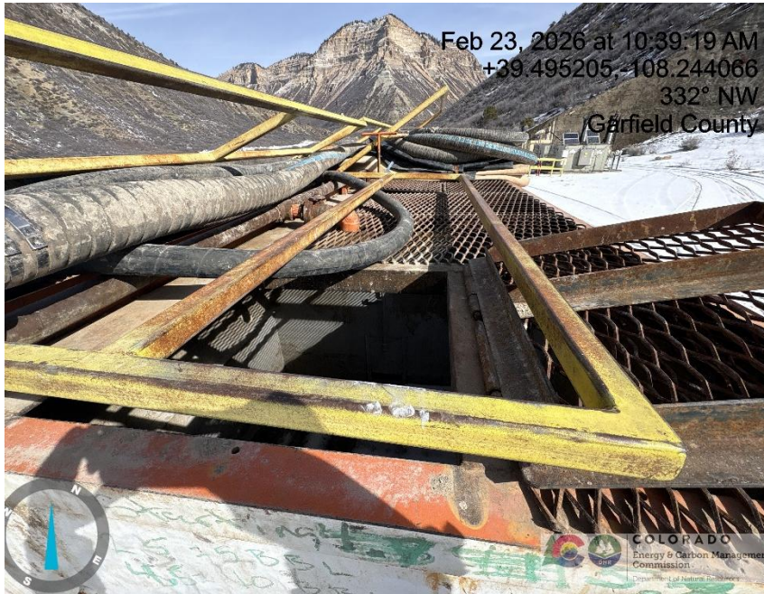
Photo # 1565 Open hatch on stored equipment/wildlife hazard/available for entry by wildlife