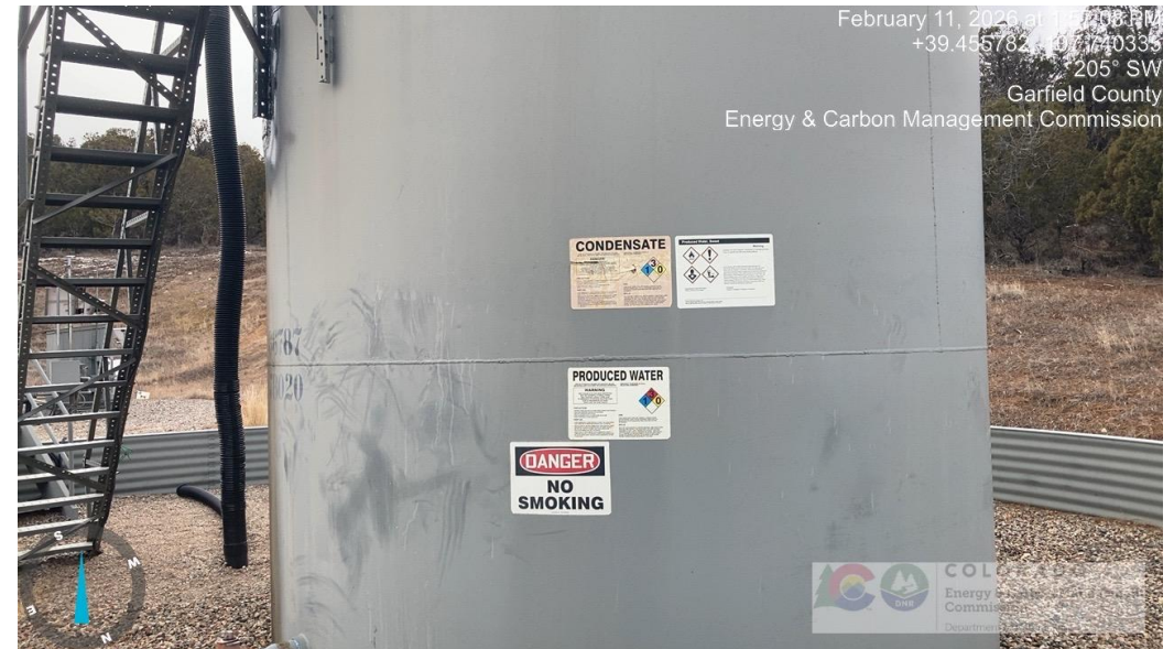
Condensate label in poor condition.