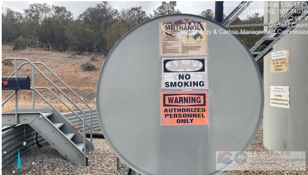
Label in poor condition.