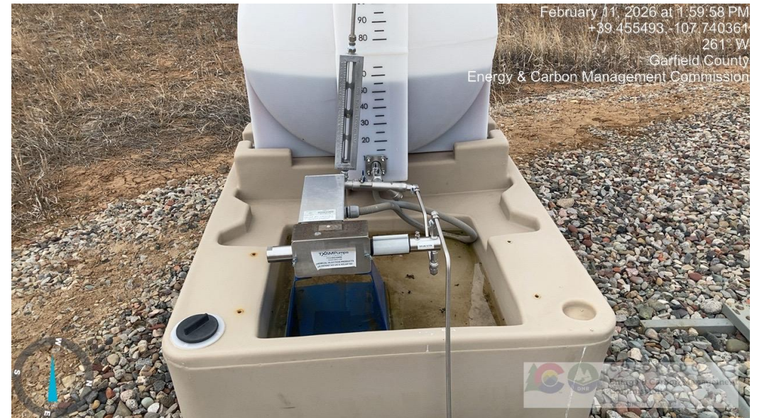
Secondary containment full of fluids