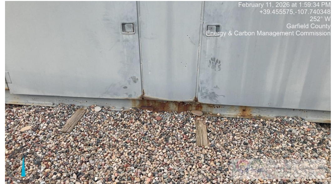
Rust around bottom of separator unit.