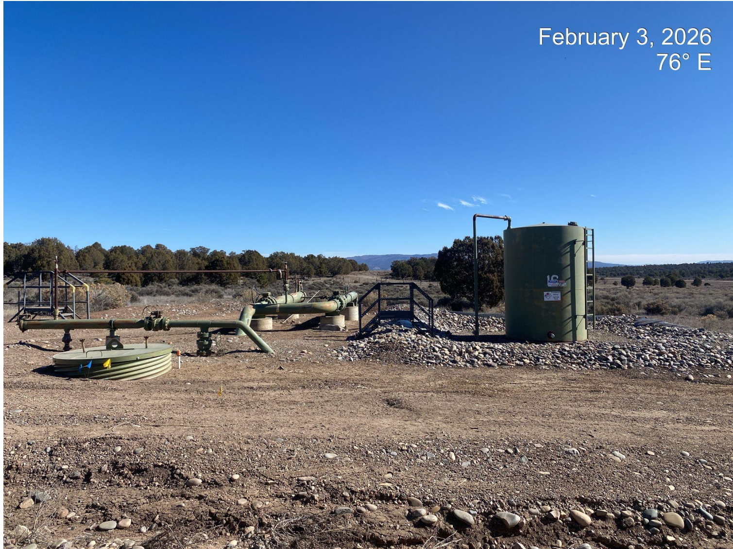
Photo 1. View of the project area taken from the southern edge facing center.