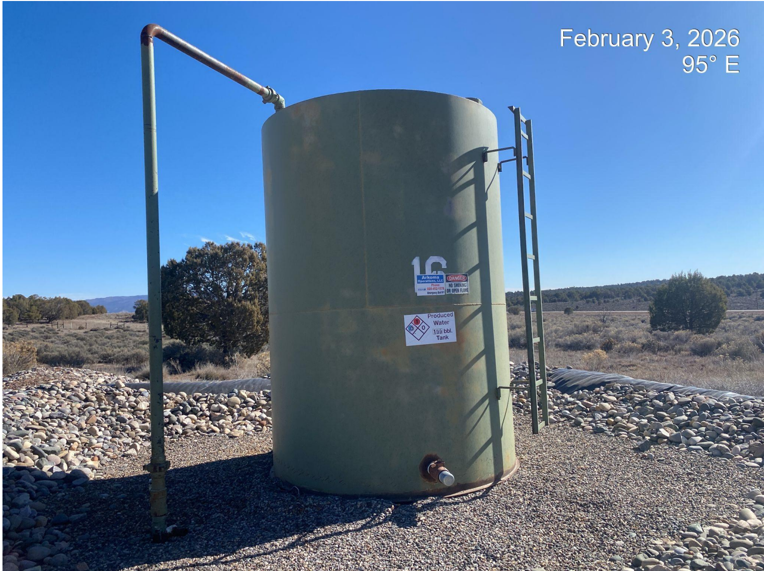
Photo 2. View of produced water tank label which is not displaying the current operator.