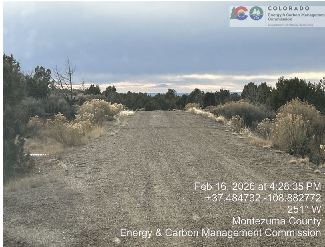
7. Access road. Note culvert on left side of road.