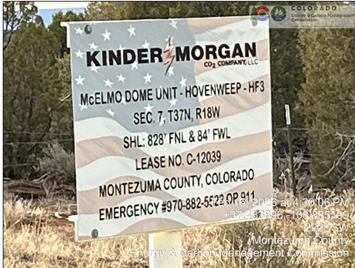
1. Well sign near pad entrance gate.

Inspector Name: James Blair. Inspection Date: 02/16/2026 Inspection Doc #: 721100152