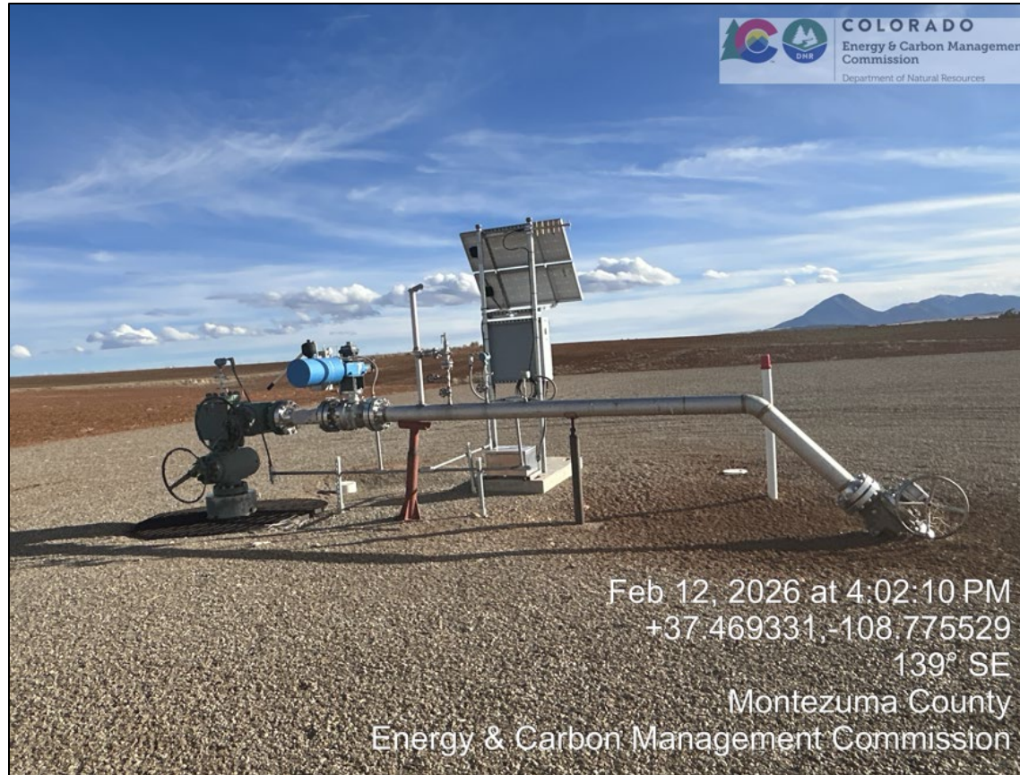
3. Wellhead, flow line, valves, and telemetry equipment.