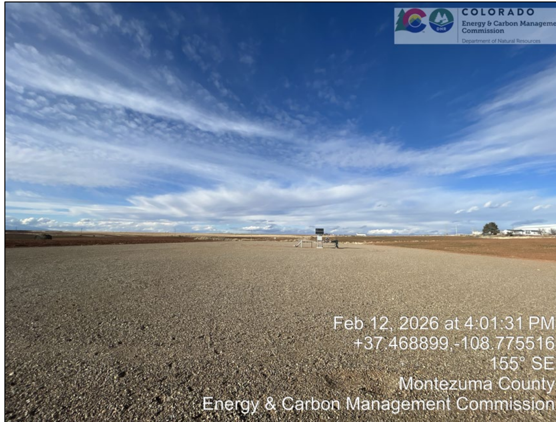
4. Well pad. Note that pad is surrounded by plowed fields.

Inspector Name: James Blair. Inspection Date: 02/12/2026 Inspection Doc #: 721100137