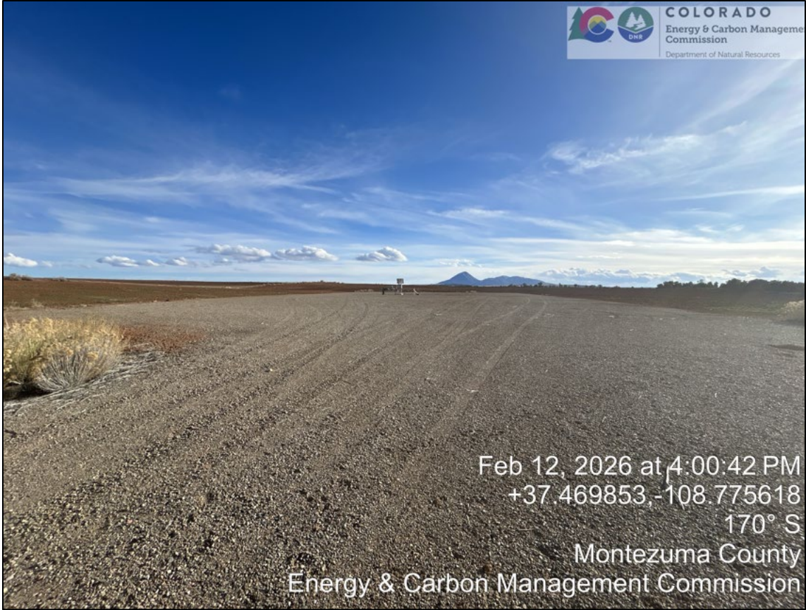
2. Well pad from entrance.