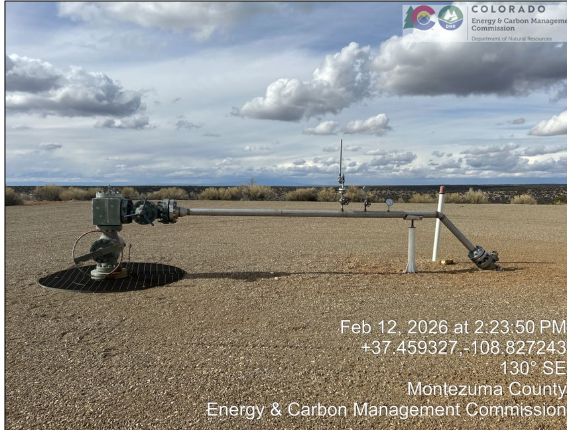
3. Wellhead, 4" stainless steel flow line and valve.

Inspection Photos Kinder Morgan McElmo Dome Unit 15-37-18 YD-2 API # 05-083-06384 Inspector Name: James Blair. Inspection Date: 02/02/2026 Inspection Doc #: 721100135