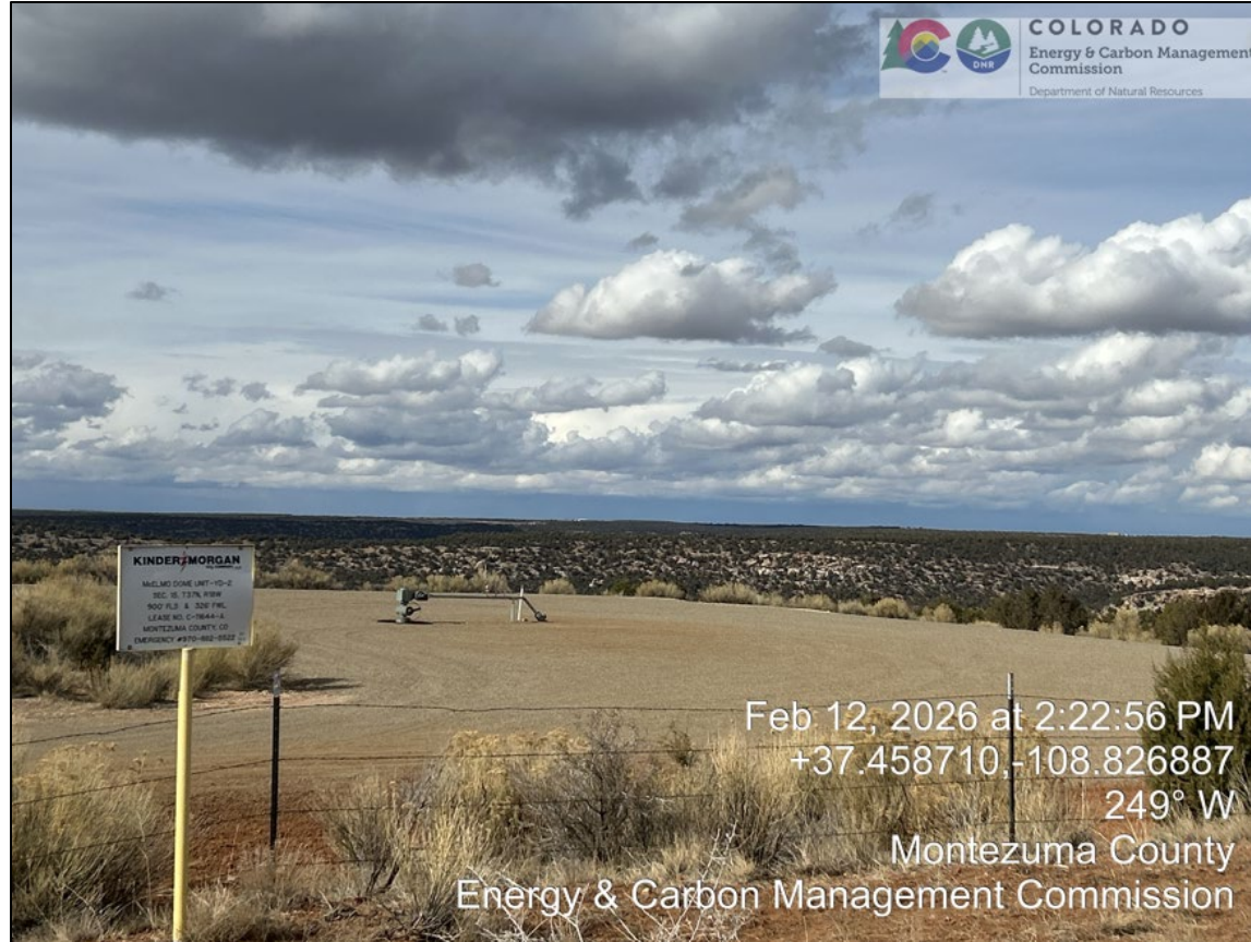
2. Well pad overview from BLM road.