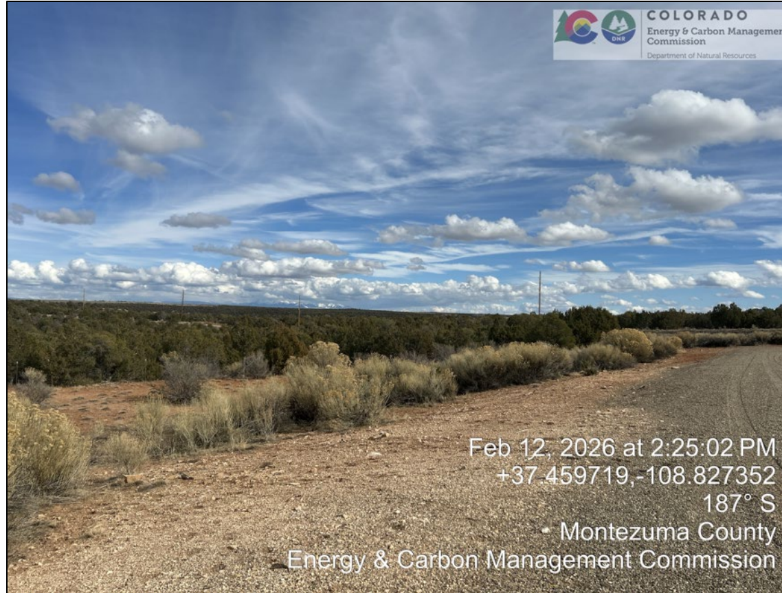
7. View of pad margin and reclamation vegetation.

Inspection Photos Kinder Morgan McElmo Dome Unit 15-37-18 YD-2 API # 05-083-06384 Inspector Name: James Blair. Inspection Date: 02/02/2026 Inspection Doc #: 721100135