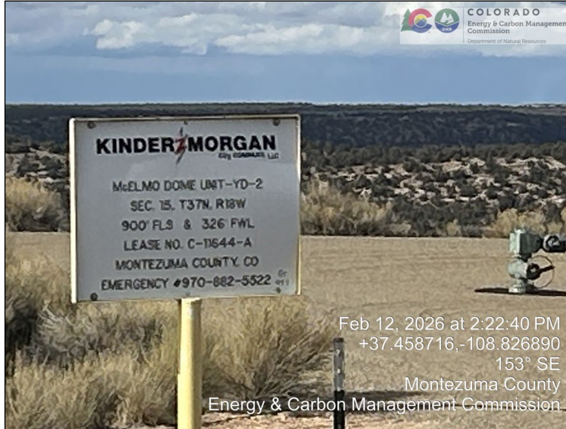
1. Well sign.