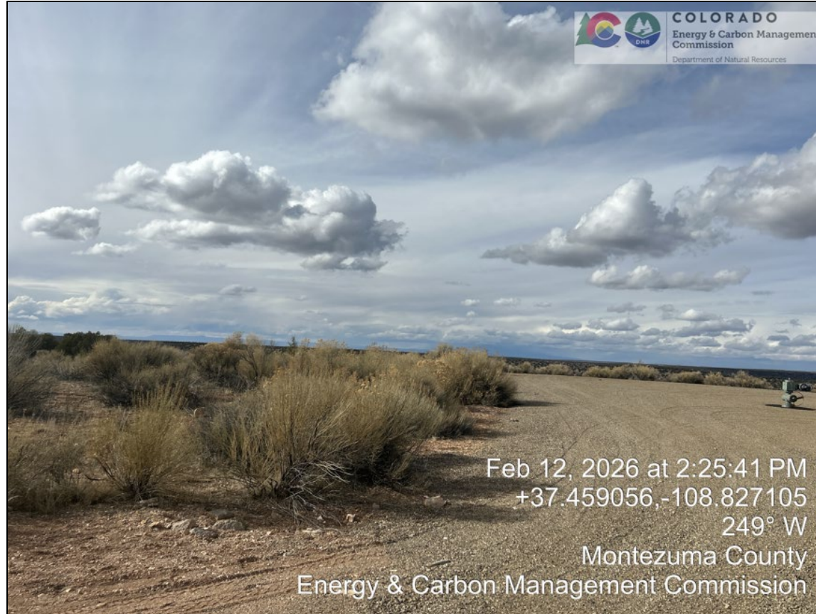
5. View of pad margin and reclamation vegetation.

Inspection Photos Kinder Morgan McElmo Dome Unit 15-37-18 YD-2 API # 05-083-06384 Inspector Name: James Blair. Inspection Date: 02/02/2026 Inspection Doc #: 721100135