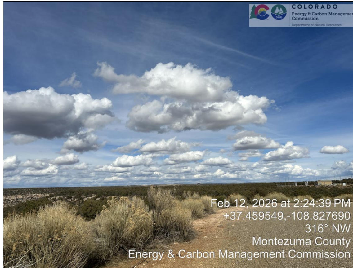
6. View of pad margin and reclamation vegetation.

Inspection Photos Kinder Morgan McElmo Dome Unit 15-37-18 YD-2 API # 05-083-06384 Inspector Name: James Blair. Inspection Date: 02/02/2026 Inspection Doc #: 721100135