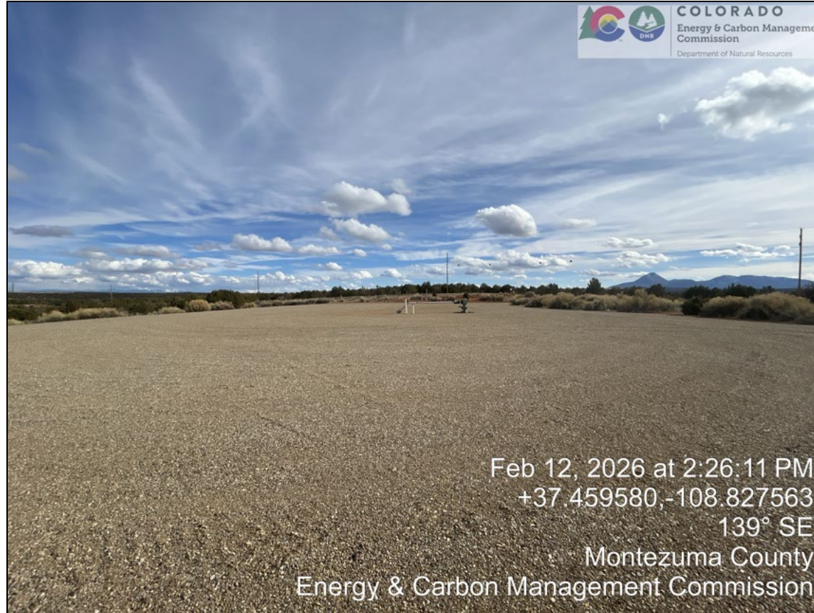
4. View of pad looking southeast.

Inspection Photos Kinder Morgan McElmo Dome Unit 15-37-18 YD-2 API # 05-083-06384 Inspector Name: James Blair. Inspection Date: 02/02/2026 Inspection Doc #: 721100135