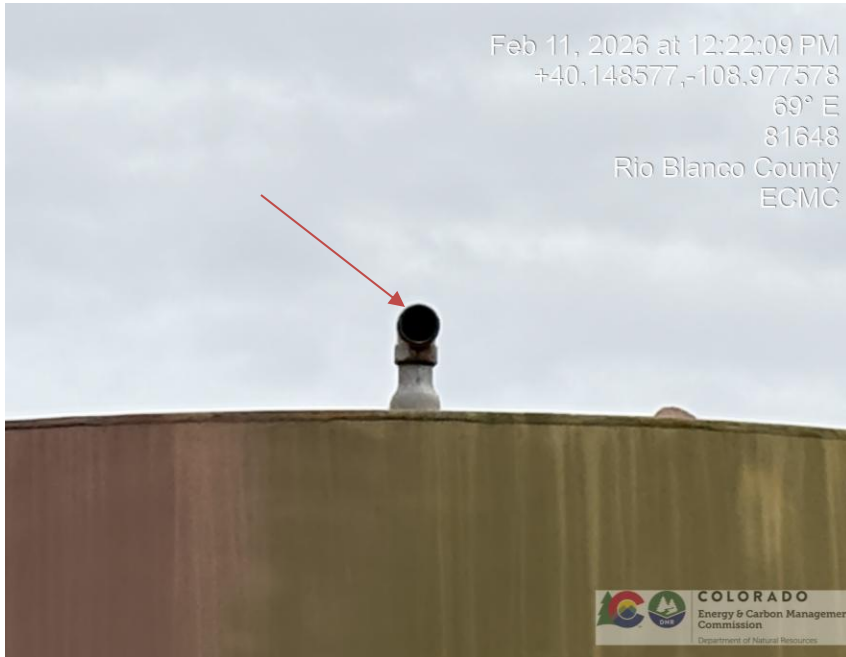
Photo # 2063 Open ended piping/wildlife hazard/available for entry by wildlife on production tank