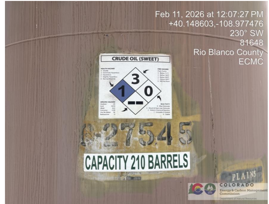
Photo # 2035 Production tank label lacks operator name & contact number