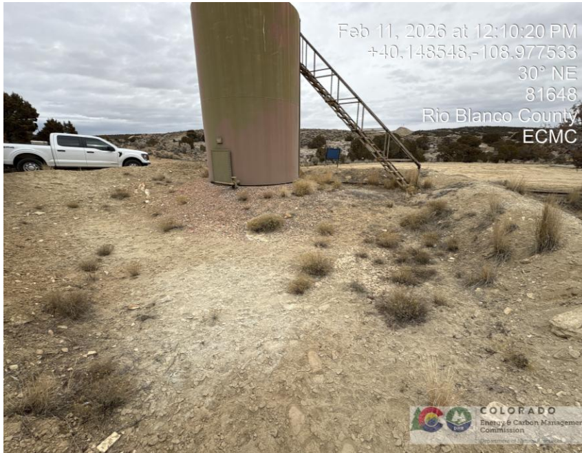
Photo # 2038 Weeds/undesirable plant species in secondary containment/surrounding production equipment presents a potential fire hazard