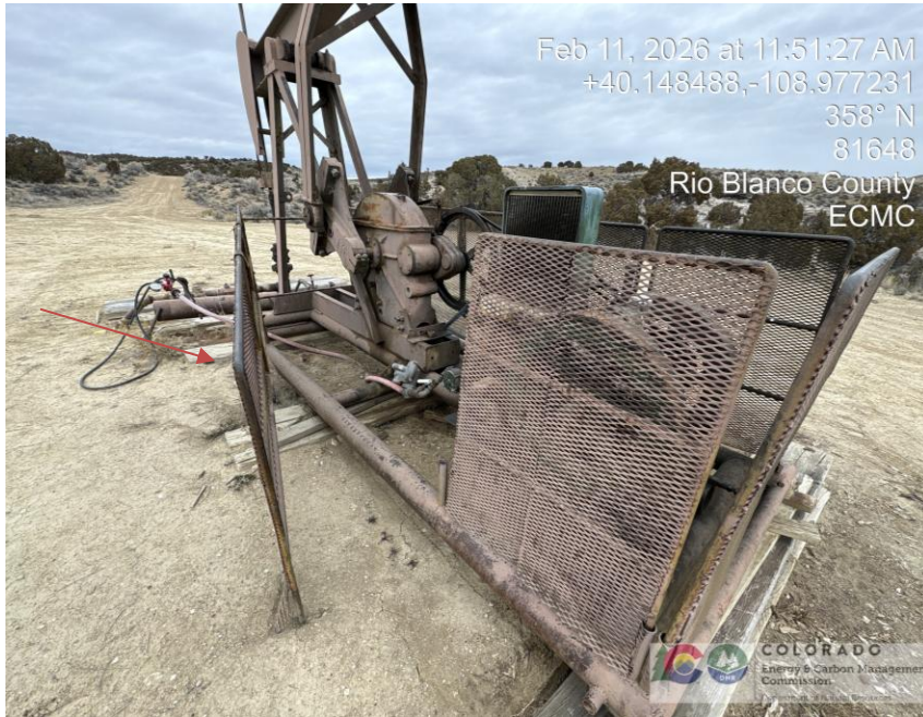
Photo # 2017 Pump Jack fencing is in disrepair/safety hazard/wildlife hazard available for entry by wildlife