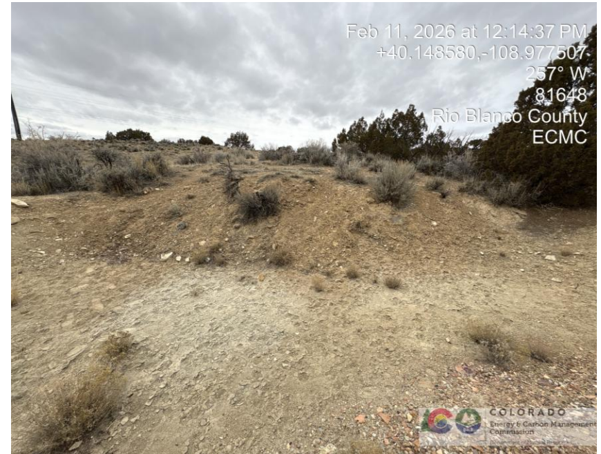
Photo # 2049 Lack of stabilization on cut slope and sediment is migrating into secondary containment/insufficient BMP's