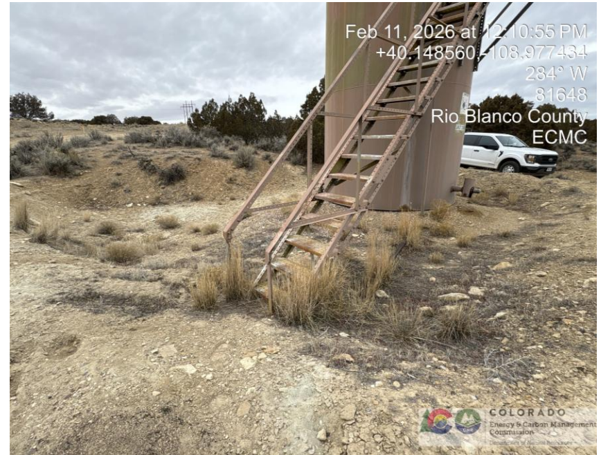
Photo # 2039 Weeds/undesirable plant species in secondary containment/surrounding production equipment presents a potential fire hazard