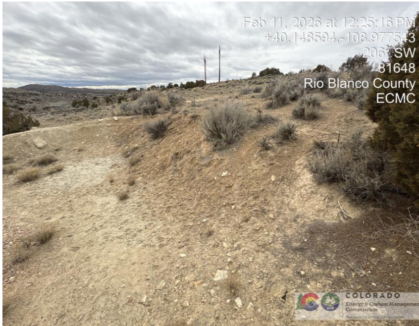
Photo # 2067 Lack of stabilization on cut slope and sediment is migrating into secondary containment/insufficient BMP's