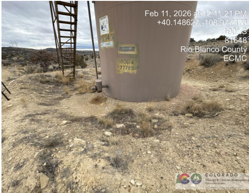
Photo # 2040 Weeds/undesirable plant species in secondary containment/surrounding production equipment presents a potential fire hazard