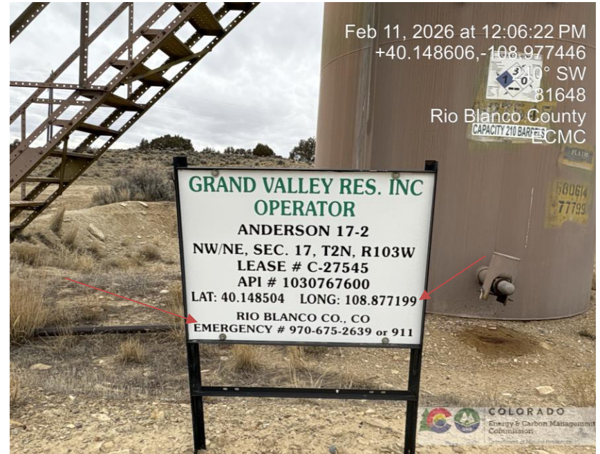
Photo # 2033 Operator Emergency Contact Number is not in service/Inaccurate location LONG: information