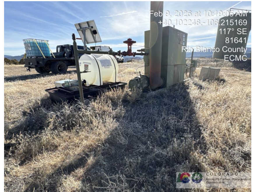
Photo # 1884 Weeds/undesirable plant species on location surrounding production equipment presents a potential fire hazard