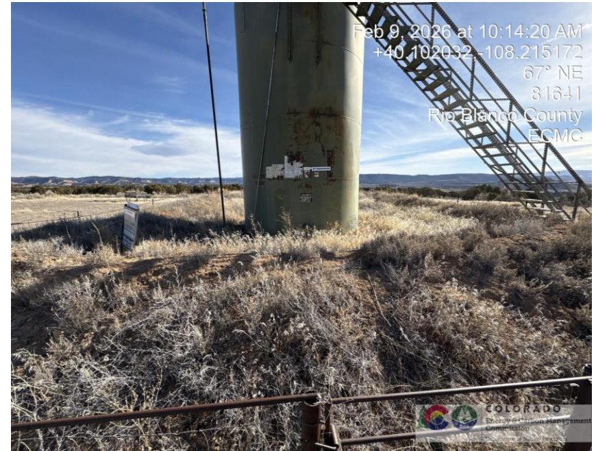
Photo # 1879 Weeds/undesirable plant species on location surrounding production equipment presents a potential fire hazard