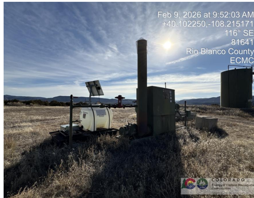
Photo # 1855 Weeds/undesirable plant species on location surrounding production equipment presents a potential fire hazard