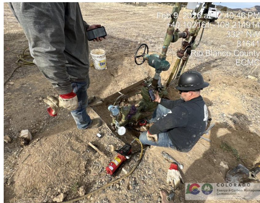
Photo # 1925 Wellhead seal test using Additel 681AEx pressure gauge