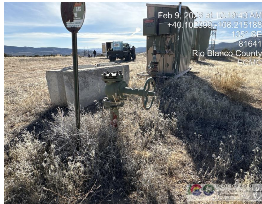
Photo # 1887 Weeds/undesirable plant species on location surrounding production equipment presents a potential fire hazard