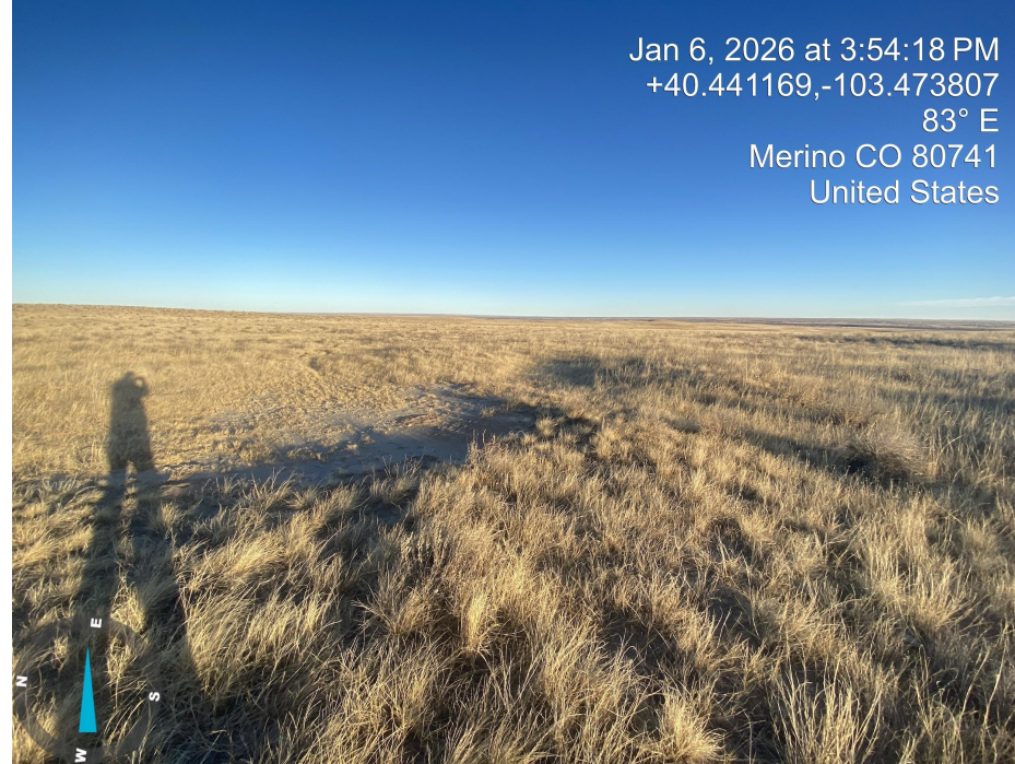
Photo 2. Photo taken on location, facing east. Showing bare area and stunted vegetation.

Jan 6, 2026 at 3:54:18 PM +40.441169,-103.473807 83° E Merino CO 80741 United States