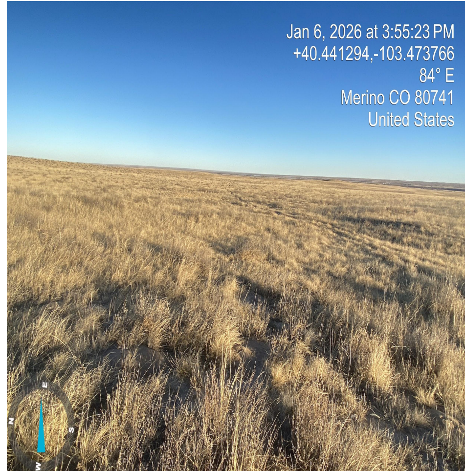
Photo 6. Photo taken from the location facing east.