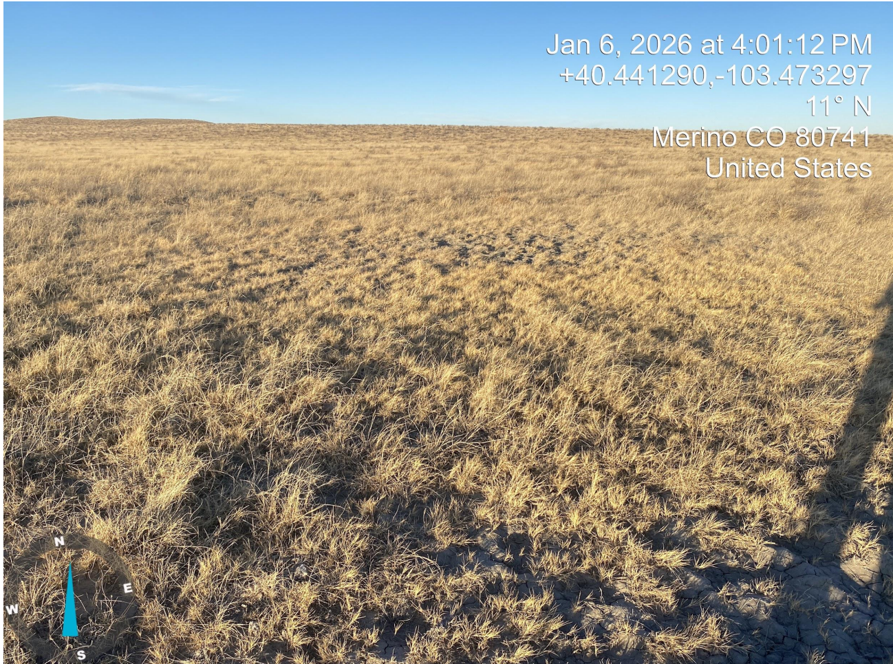
Photo 5. Photo taken from the location, facing north showing area with stunted vegetation growth.