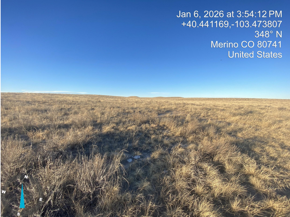
Photo 1. Photo taken from the location facing north.

Jan 6, 2026 at 3:54:12 PM +40.441169,-103.473807 348° N Merino CO 80741 United States