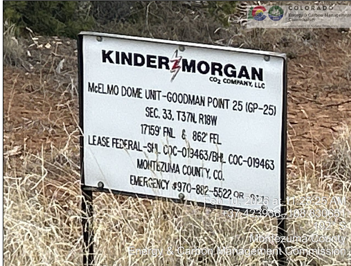
01. Well Sign