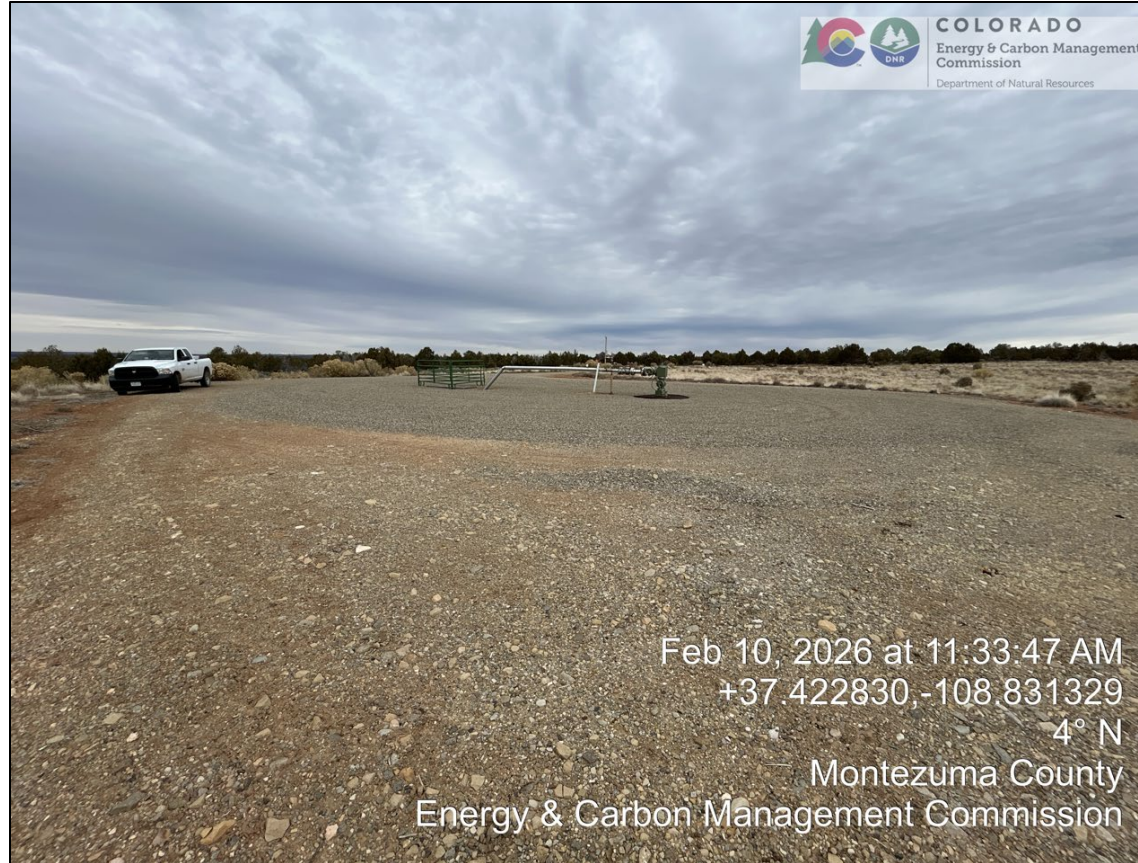
09. View of well pad from south end looking north.

Inspection Photos Kinder Morgan – Goodman Point (GP) #25 API # 05-83-06685 Inspector Name: James Blair. Inspection Date: 02/10/2026 Inspection Doc #: 721100118