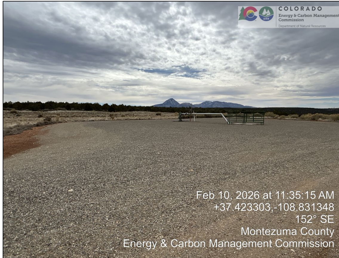
09. Overview of pad looking southeast.

Inspection Photos Kinder Morgan – Goodman Point (GP) #25 API # 05-83-06685 Inspector Name: James Blair. Inspection Date: 02/10/2026 Inspection Doc #: 721100118