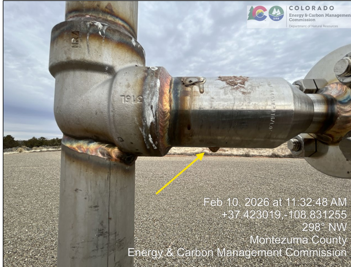
07. Close-up of produced water drip.