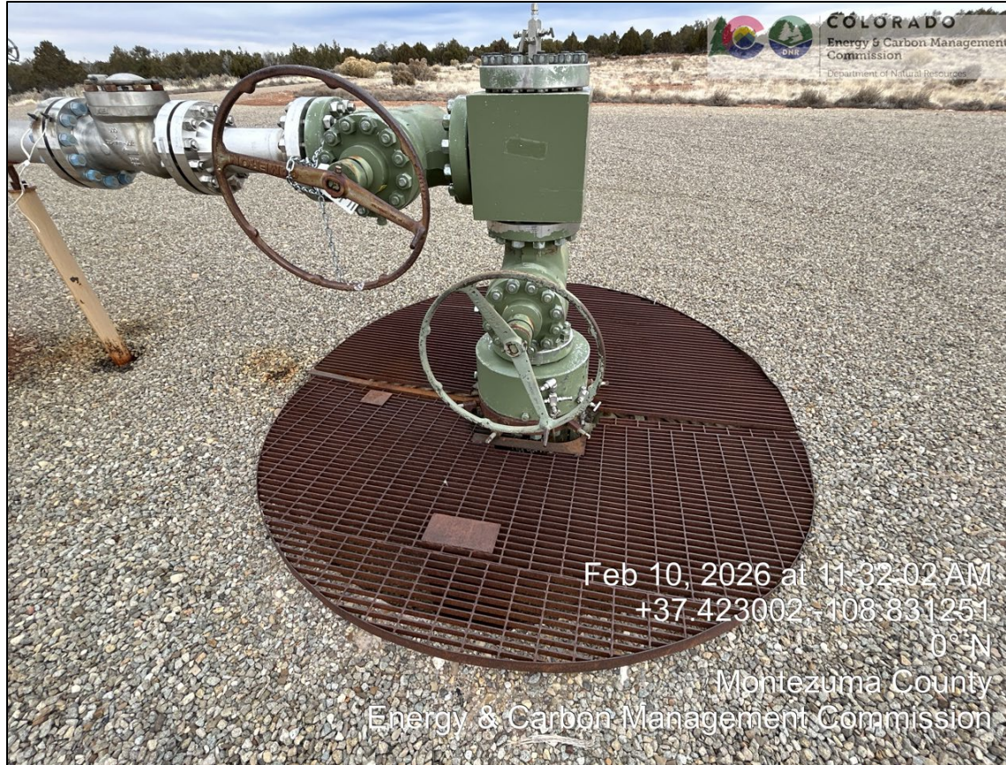
04. Wellhead and cellar.