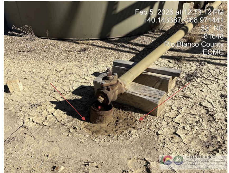
Photo # 1694 Staining on location near production tank unload line