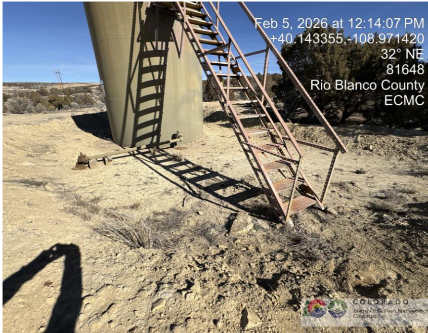
Photo # 1697 Small amount of Weeds/undesirable plant species in secondary containment presents a potential fire hazard