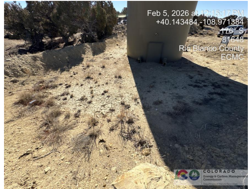
Photo # 1700 Small amount of Weeds/undesirable plant species in secondary containment presents a potential fire hazard