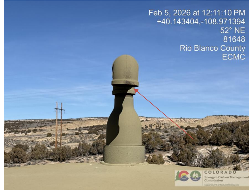
Photo # 1692 Open ended piping/wildlife hazard/available for entry by wildlife