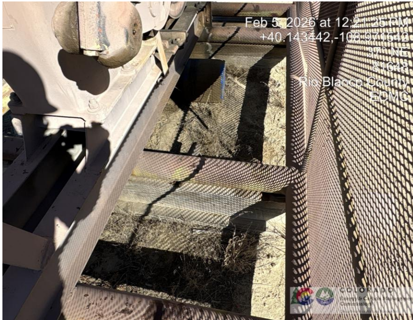
Photo # 1704 Small amount of Weeds/undesirable plant species near pump jack presents a potential fire hazard