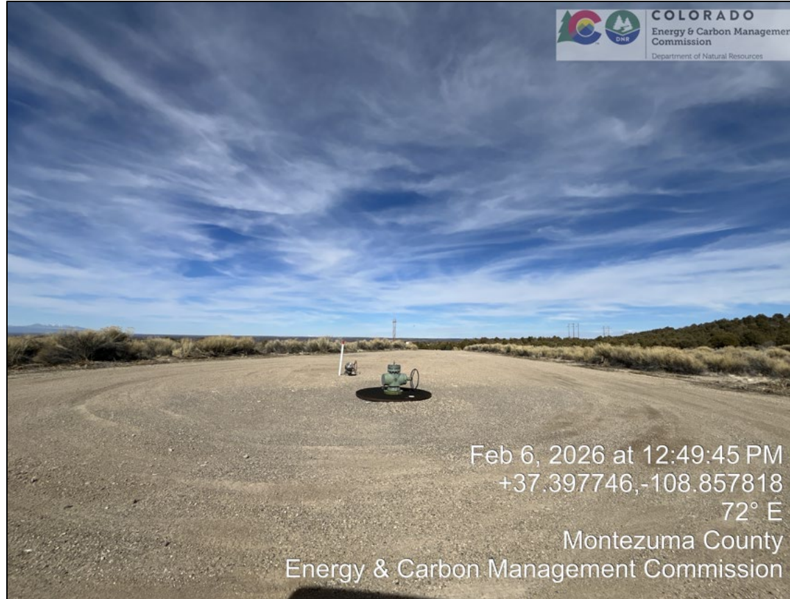
05. Well pad overview photo. Site is clear of undesirable vegetation. OOSLAT marker on flow line.

Inspection Photos Kinder Morgan Sand Canyon #11 API # 05-083-06684 Inspector Name: James Blair. Inspection Date: 02/06/2026 Inspection Doc #: 721100110