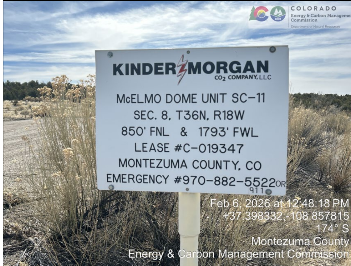
01. Well Sign.