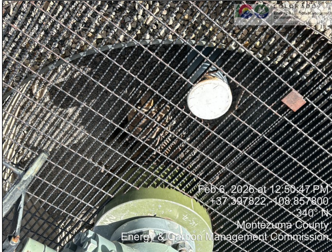
04. Bradenhead access beneath metal grating atop well cellar.