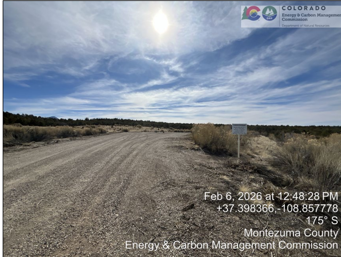
02: Well pad entrance looking south.

Inspection Photos Kinder Morgan Sand Canyon #11 API # 05-083-06684 Inspector Name: James Blair. Inspection Date: 02/06/2026 Inspection Doc #: 721100110