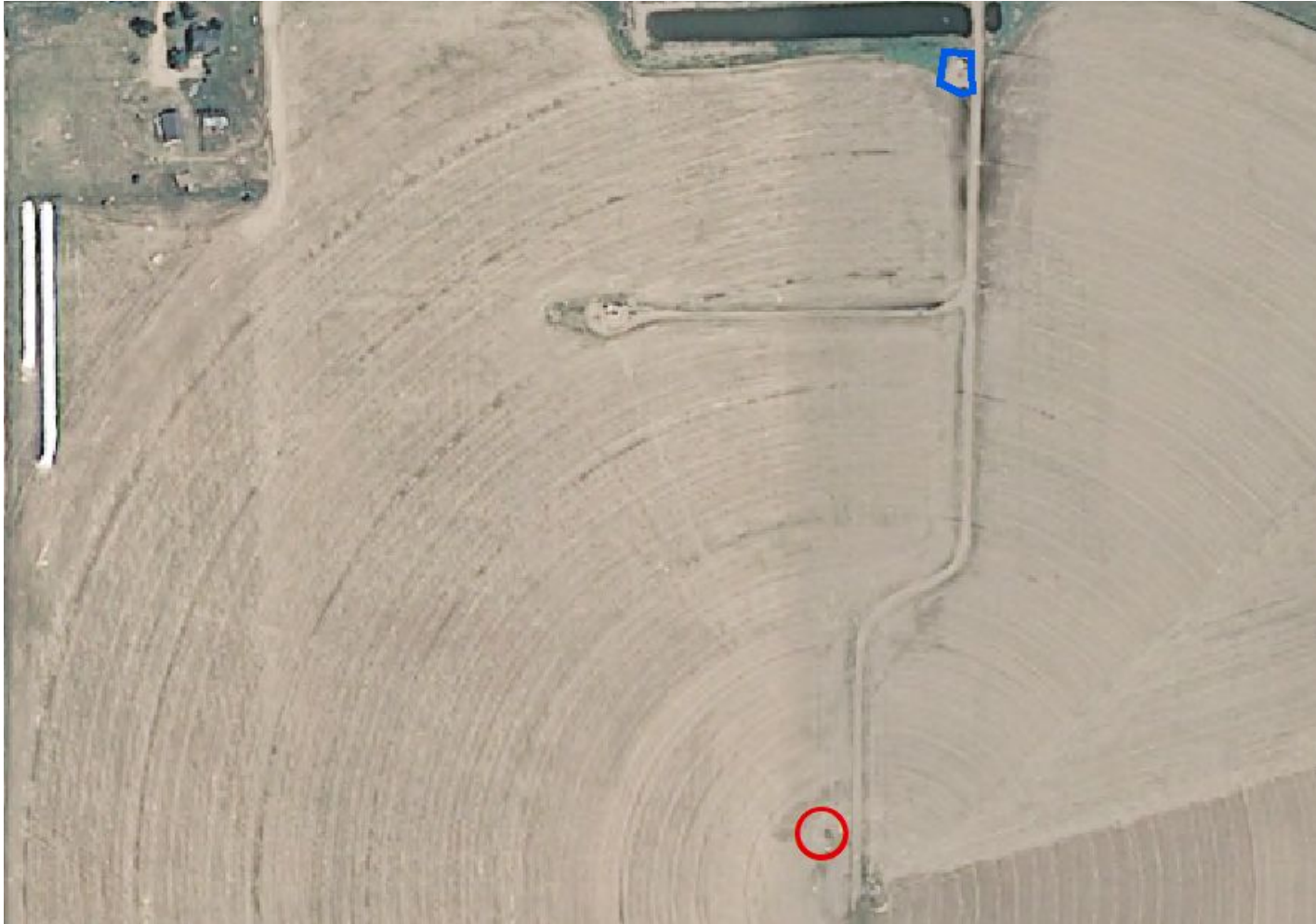
Photo 1. NAIP aerial imagery (2009) illustrating the well location (red circle) associated tank battery location (blue polygon). Note no obvious access road in historic imagery.

Inspection Photos Location Name: Gurley #5 Location ID: 306568