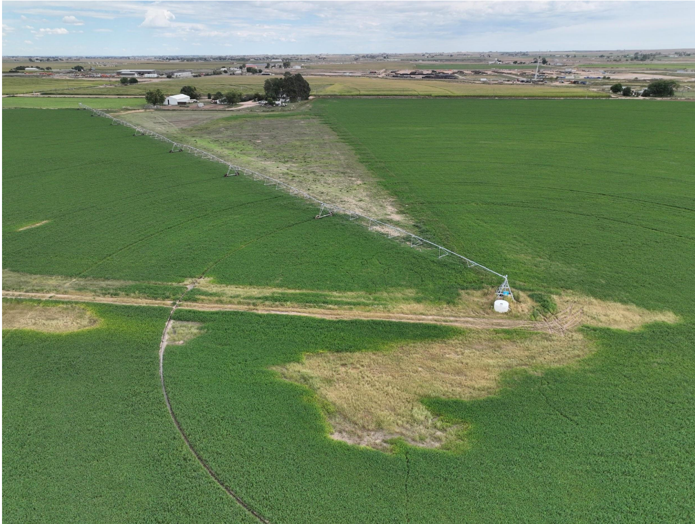
Photo 4. Drone aerial imagery taken west of well location, facing east (displaying the well).

Inspection Photos Location Name: Gurley #5 Location ID: 306568