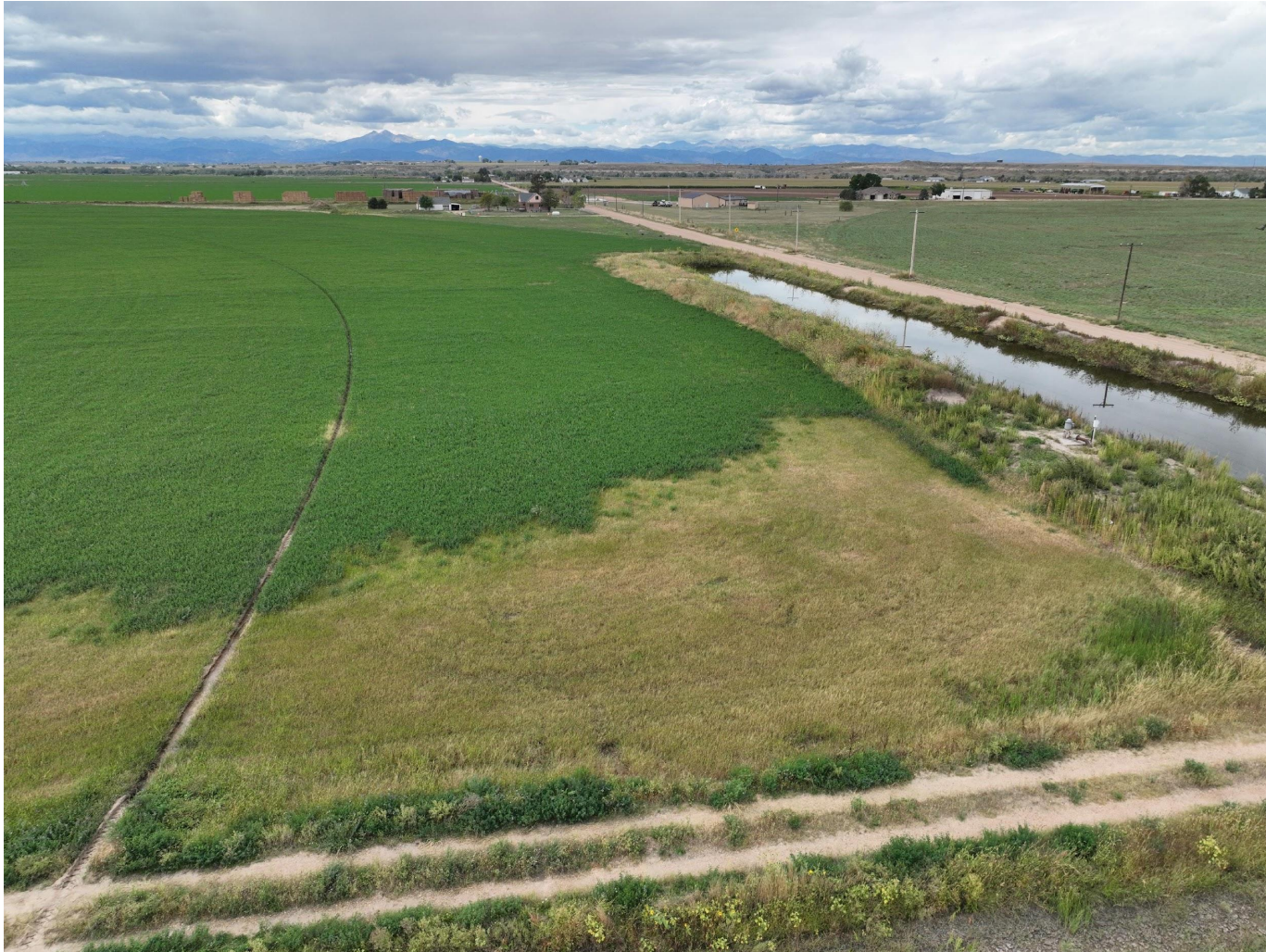
Photo 12. Drone aerial imagery taken east of the tank battery location, facing west (displaying a closer view of the TB).