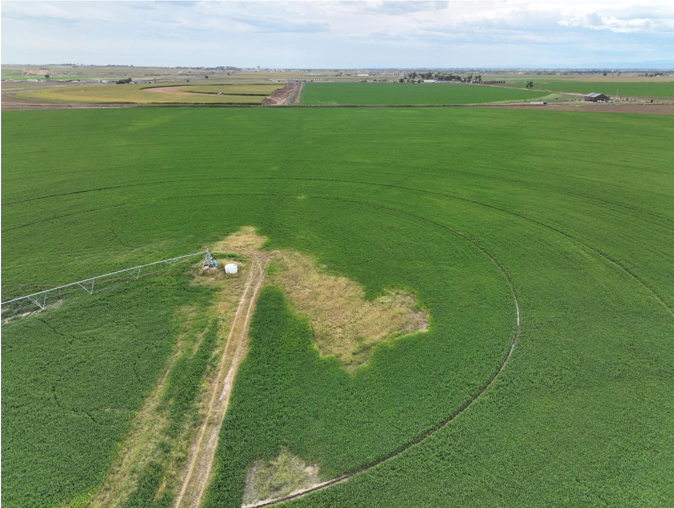
Photo 5. Drone aerial imagery taken north of well location, facing south (displaying the well).