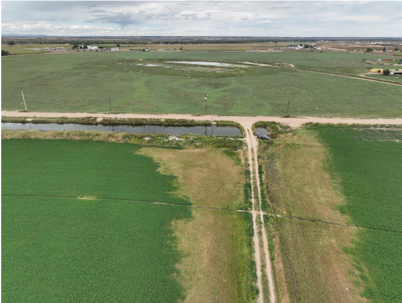
Photo 8. Drone aerial imagery taken south of the tank battery location, facing north (displaying the TB).