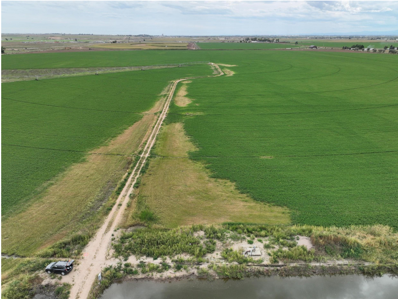
Photo 10. Drone aerial imagery taken north of the tank battery location, facing south (displaying the TB).

Inspection Photos Location Name: Gurley #5 Location ID: 306568