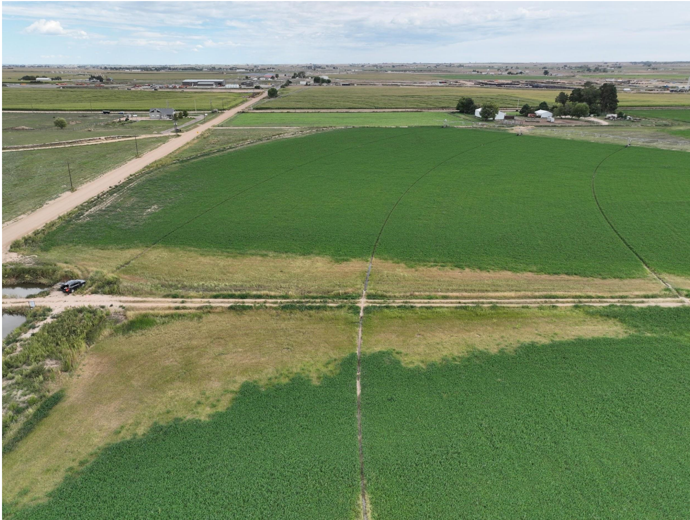
Photo 9. Drone aerial imagery taken west of the tank battery location, facing east (displaying the TB).