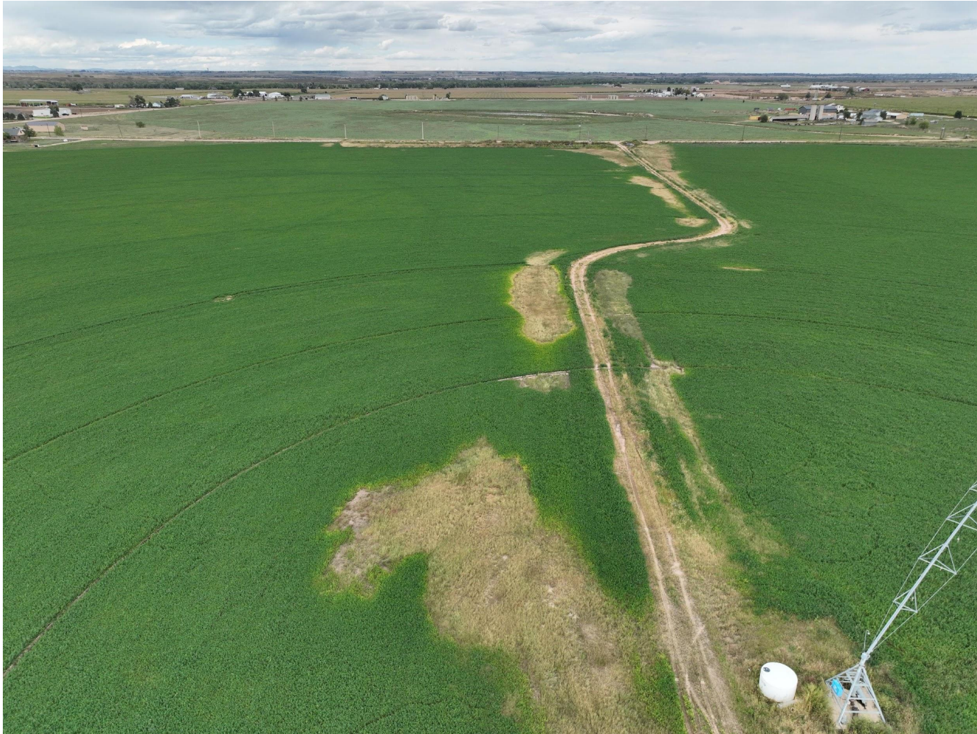
Photo 3. Drone aerial imagery taken south of well location, facing north (displaying the well and part of the presumed flowline).

Inspection Photos Location Name: Gurley #5 Location ID: 306568