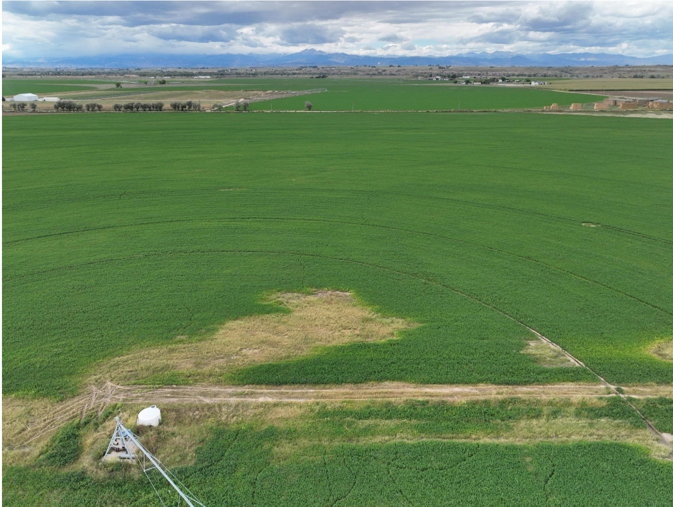
Photo 6. Drone aerial imagery taken east of well location, facing west (displaying the well).