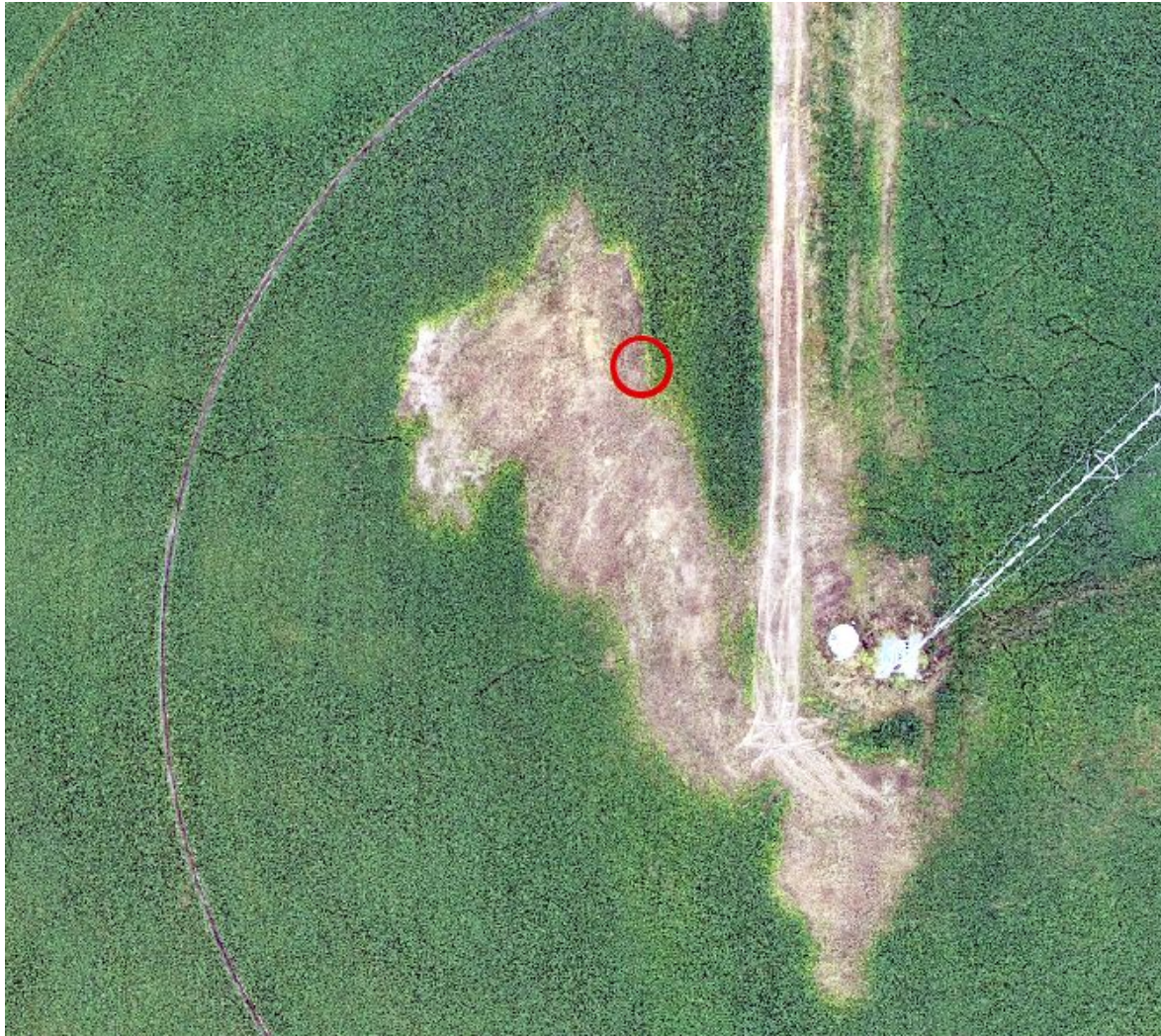
Photo 7. Close-up orthomosaic imagery of the well location (red circle)

Inspection Photos Location Name: Gurley #5 Location ID: 306568