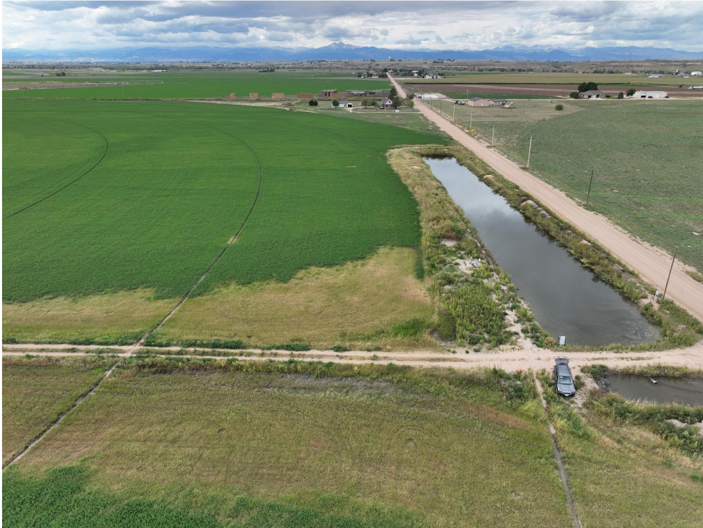
Photo 11. Drone aerial imagery taken east of the tank battery location, facing west (displaying the TB).