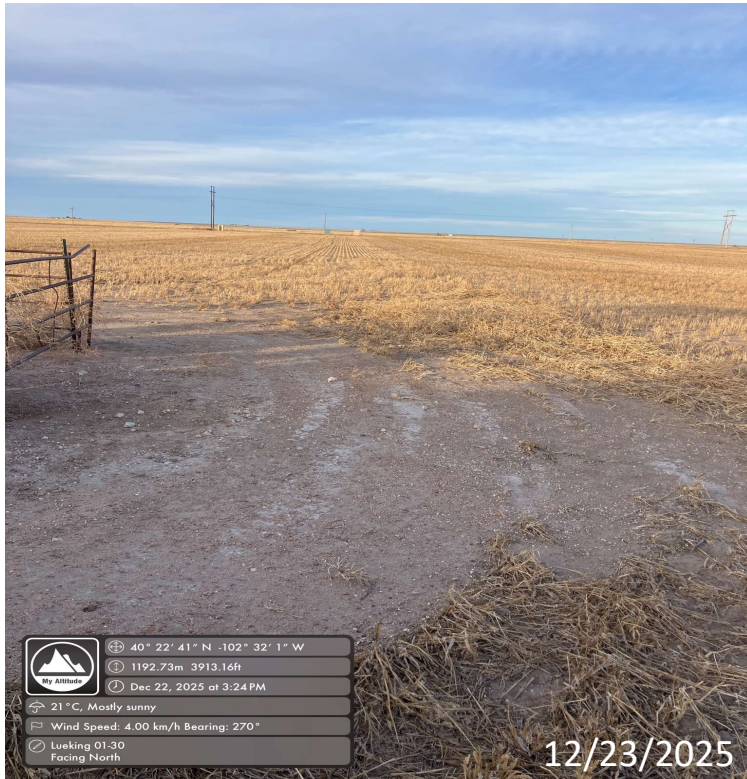
View of Spill Location, Facing North