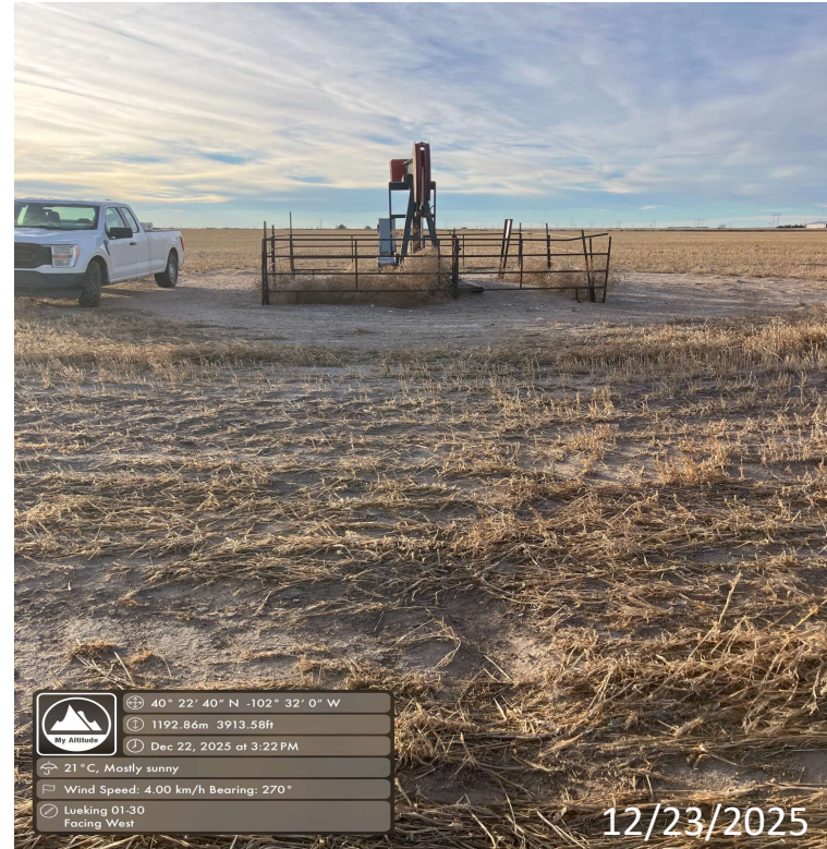
View of Spill Location, Facing West