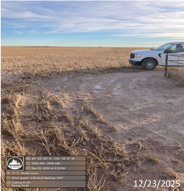
View of Spill Location, Facing North