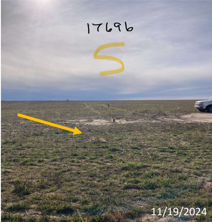
View of Spill Location, Facing West