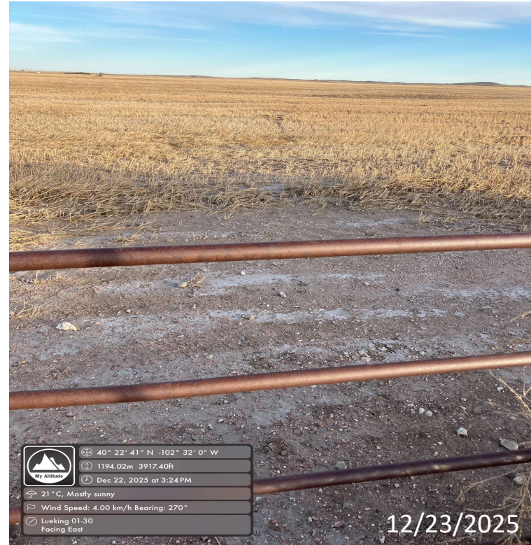
View of Spill Location, Facing West