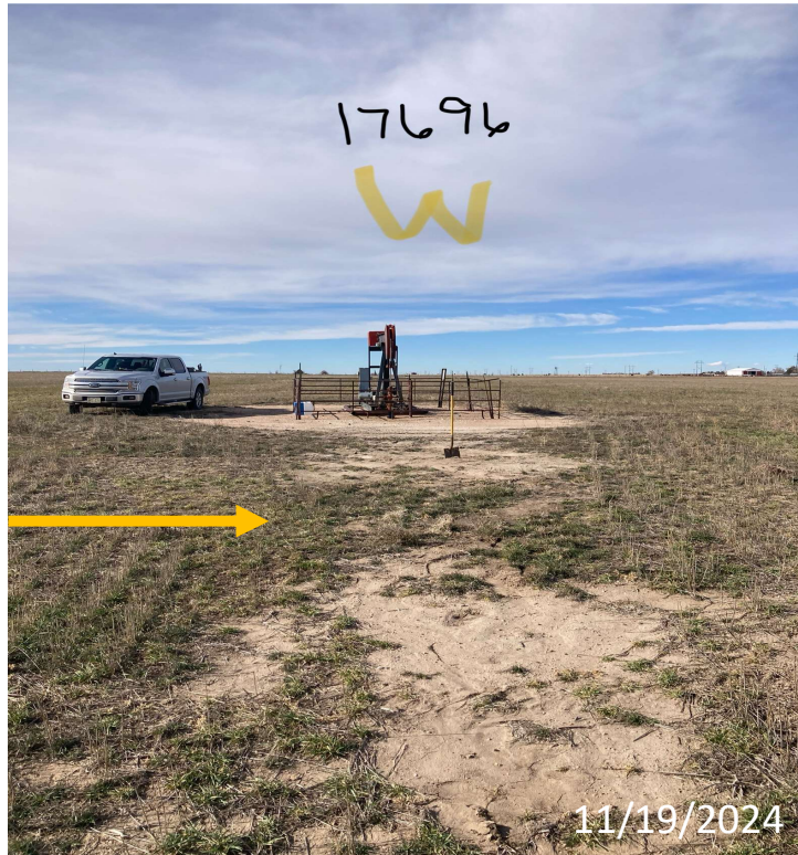
View of Spill Location, Facing West