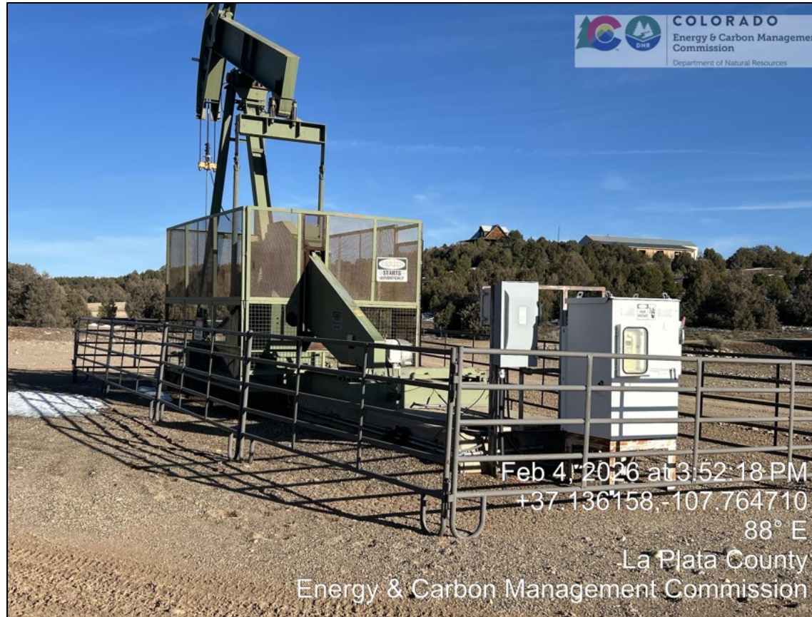
5. Pumpjack and electric prime mover behind cattle panel fence.