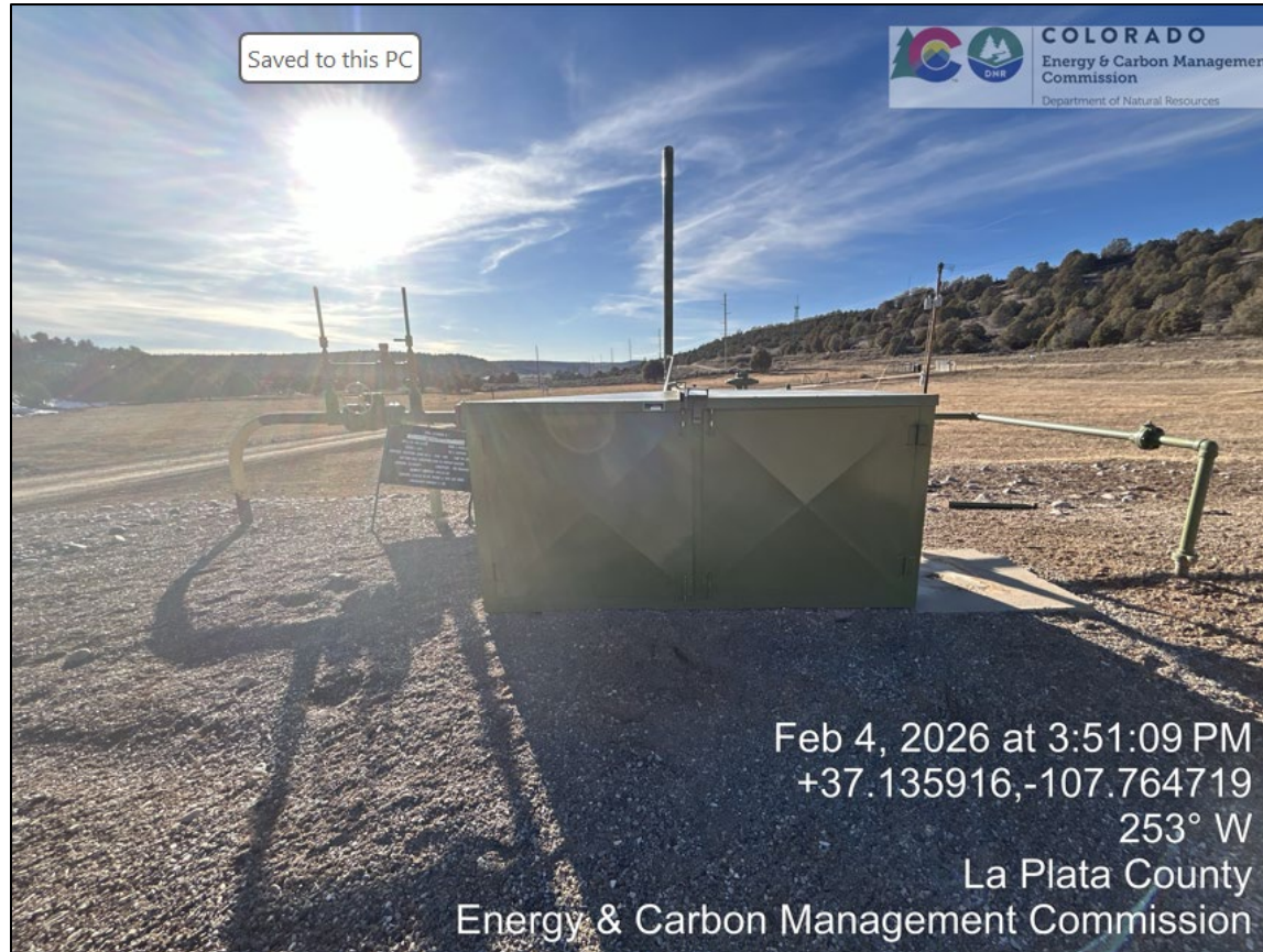
2. Direct pump controller.