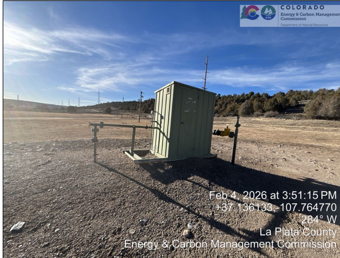
3. Meter run structure.