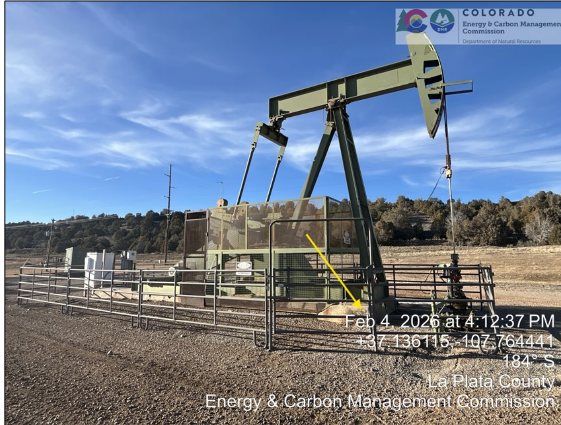
8. Pumpjack and wellhead. Dead vegetative debris near wellhead.