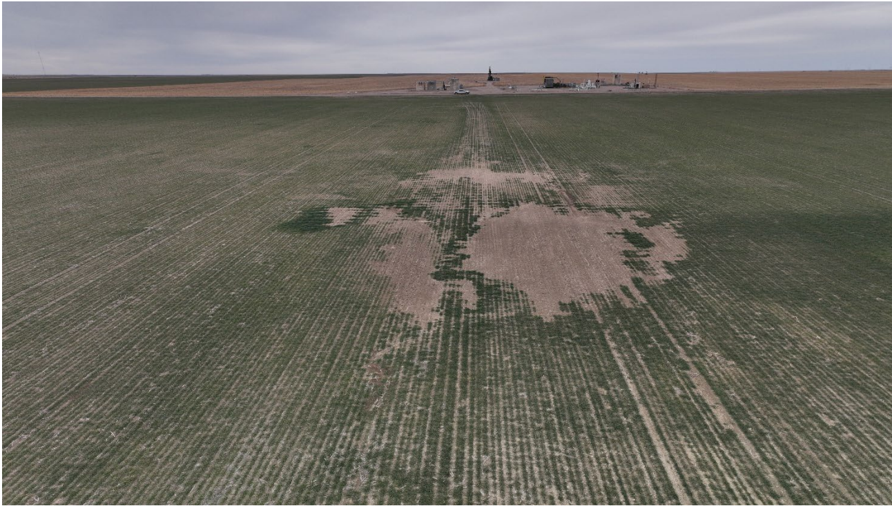
Photo 3. Drone aerial photo facing west toward the abandoned wellsite. The crop is not uniformly growing at the former wellsite.