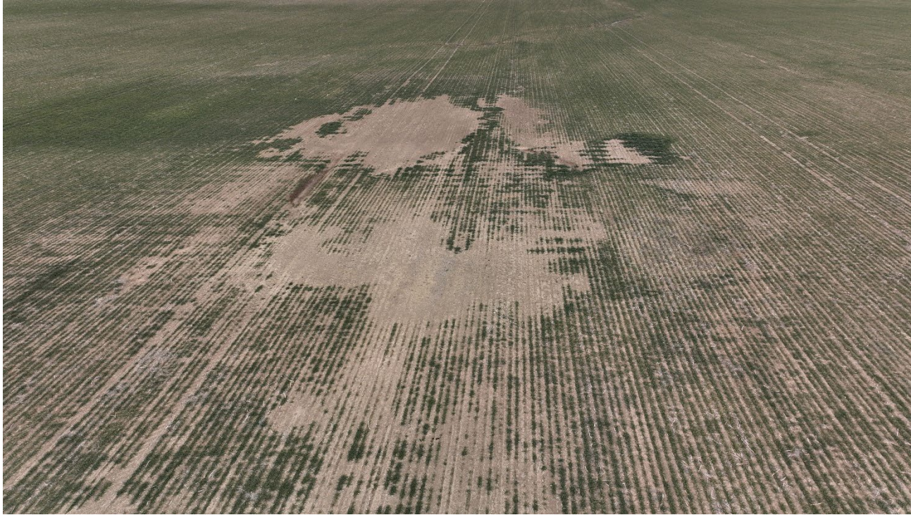
Photo 2. Drone aerial photo facing east toward the abandoned wellsite. The crop is not uniformly growing at the former wellsite.