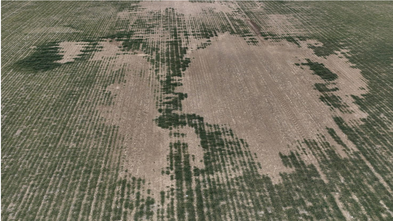
Photo 4. Drone aerial photo facing down at the location shows crop is not uniformly growing at the former wellsite.