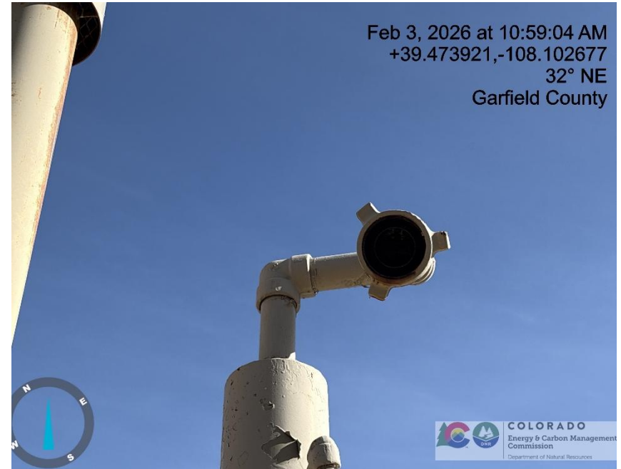
Photo # 8031 Open ended piping on dehy still column /wildlife hazard/available for entry by wildlife