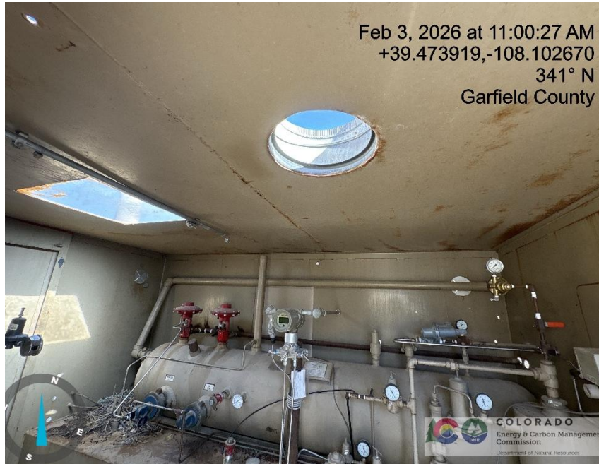
Photo # 8033 Hole in separator roof/wildlife hazard /available for entry by wildlife