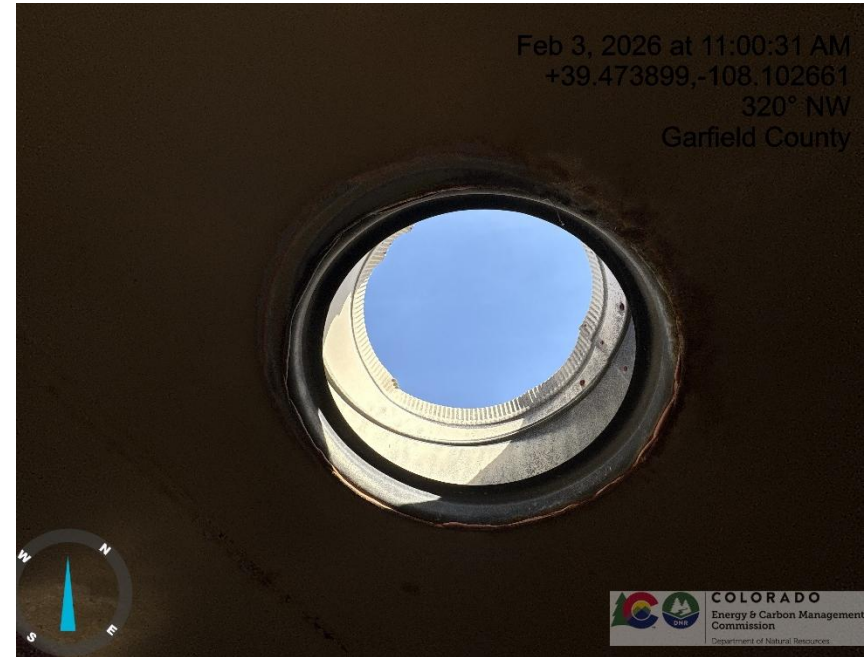
Photo # 8034 Hole in separator roof/wildlife hazard /available for entry by wildlife