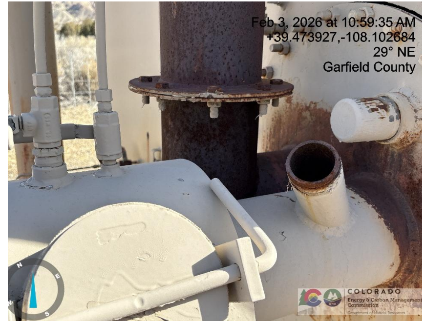
Photo # 8030 Open ended piping on fire tube/wildlife hazard/available for entry by wildlife