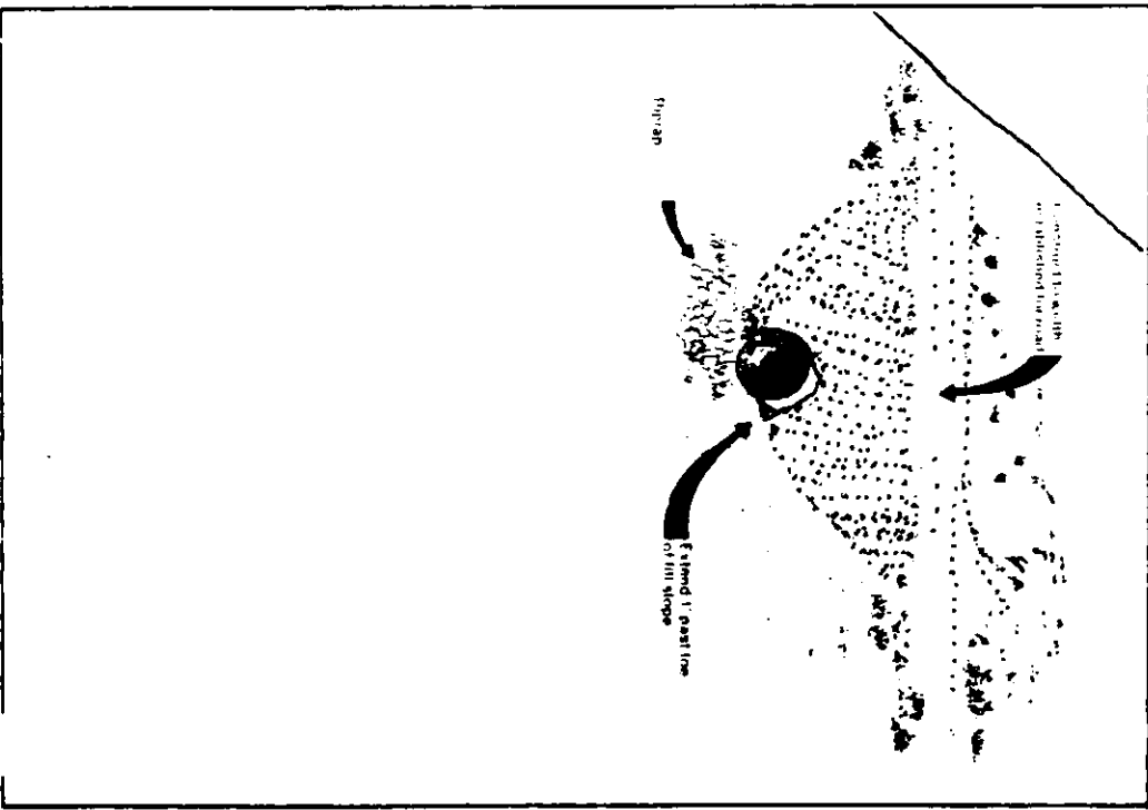
Figure 10 Typical Culvert Installation