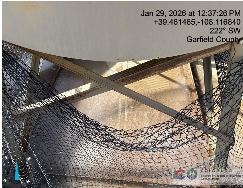
Photo # 7281 Netting for methanol tank containment needs maintenance/wildlife hazard