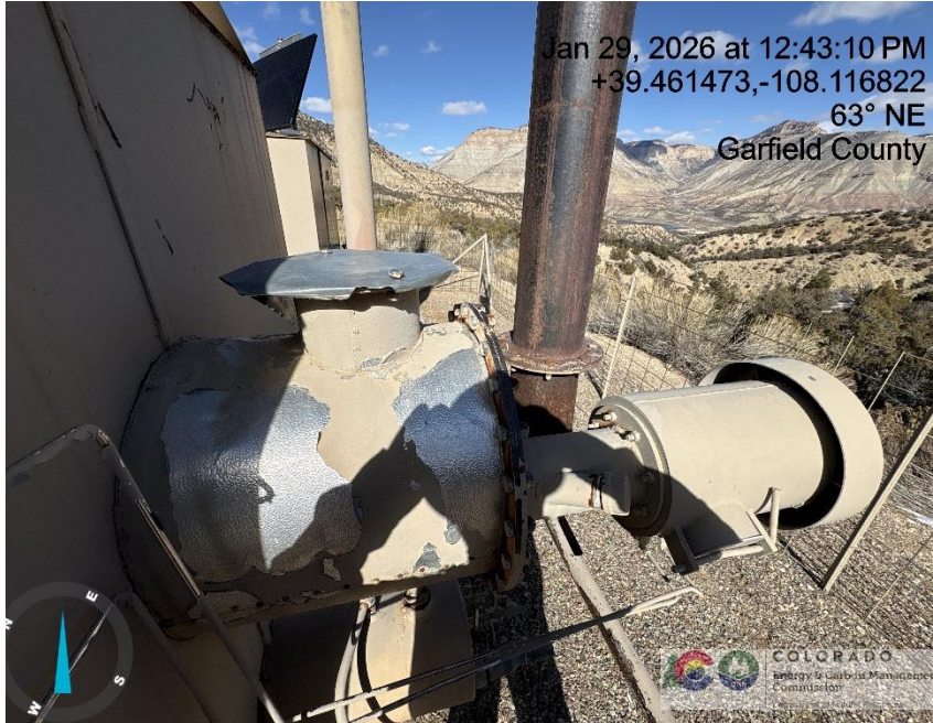
Photo # 7279 Still column has been removed from dehy /dehy inoperable & not in use/unused equipment