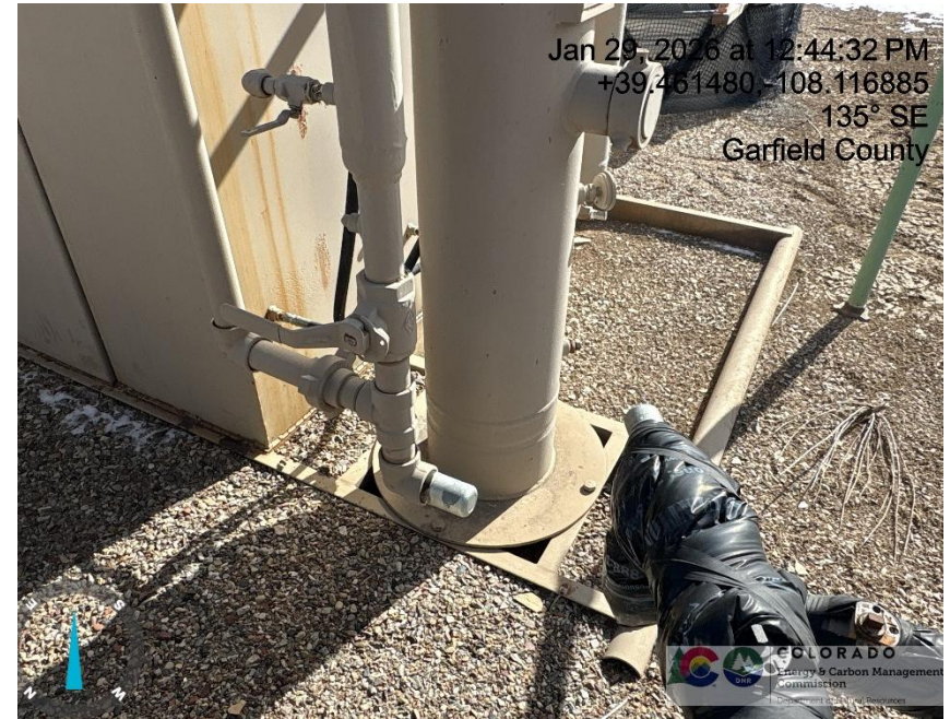
Photo # 7278 Piping on dehy disconnected/dehy not in use/unused equipment