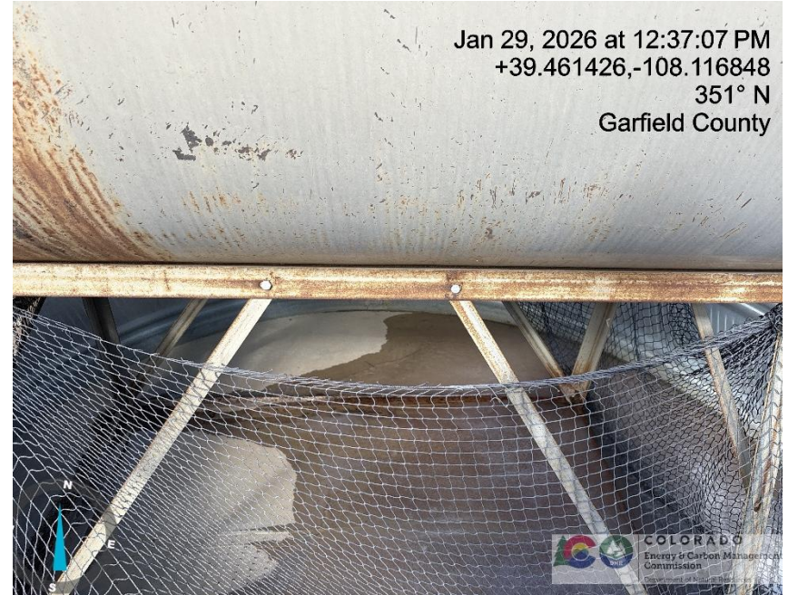
Photo # 7280 Netting for methanol tank containment needs maintenance/wildlife hazard