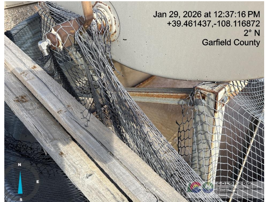
Photo # 7282 Netting for methanol tank containment needs maintenance/wildlife hazard