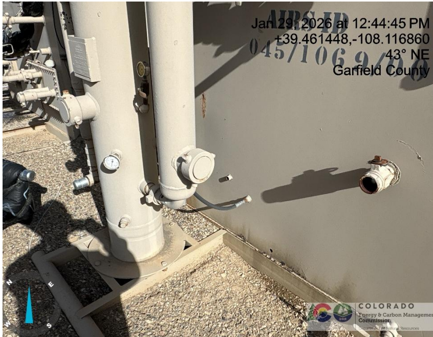
Photo # 7277 Piping on dehy disconnected/dehy not in use/unused equipment