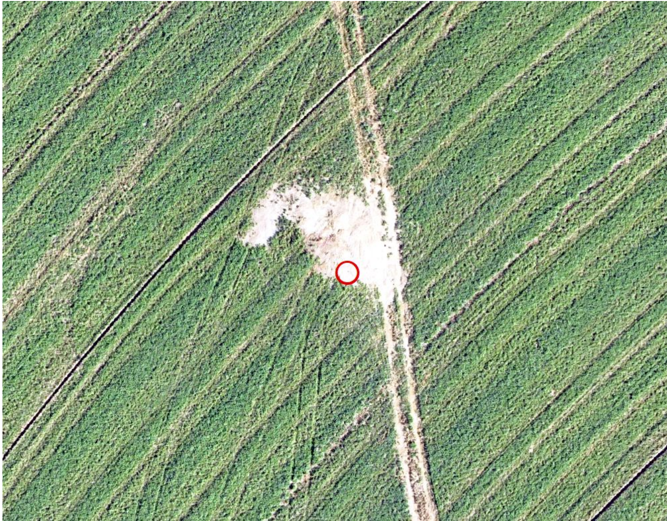
Photo 7. Close-up orthomosaic imagery showing the well location (red circle) and bare patch in field.

Inspection Photos Location Name: Booth 13-26 Location ID: 329857