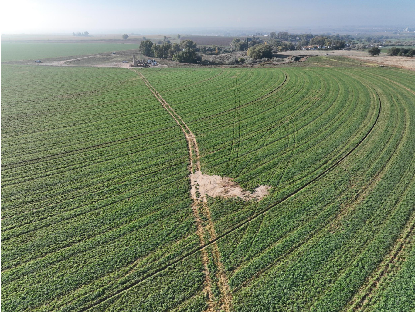
Photo 5. Drone aerial imagery taken north of well location, facing south (displaying the well, presumed flowline, and access road).