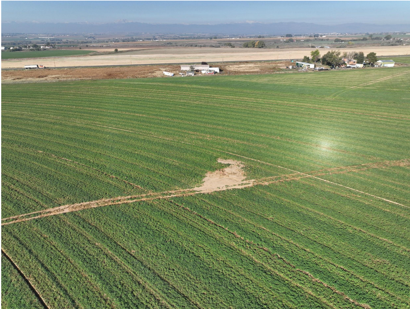
Photo 6. Drone aerial imagery taken east of well location, facing west (displaying the well).