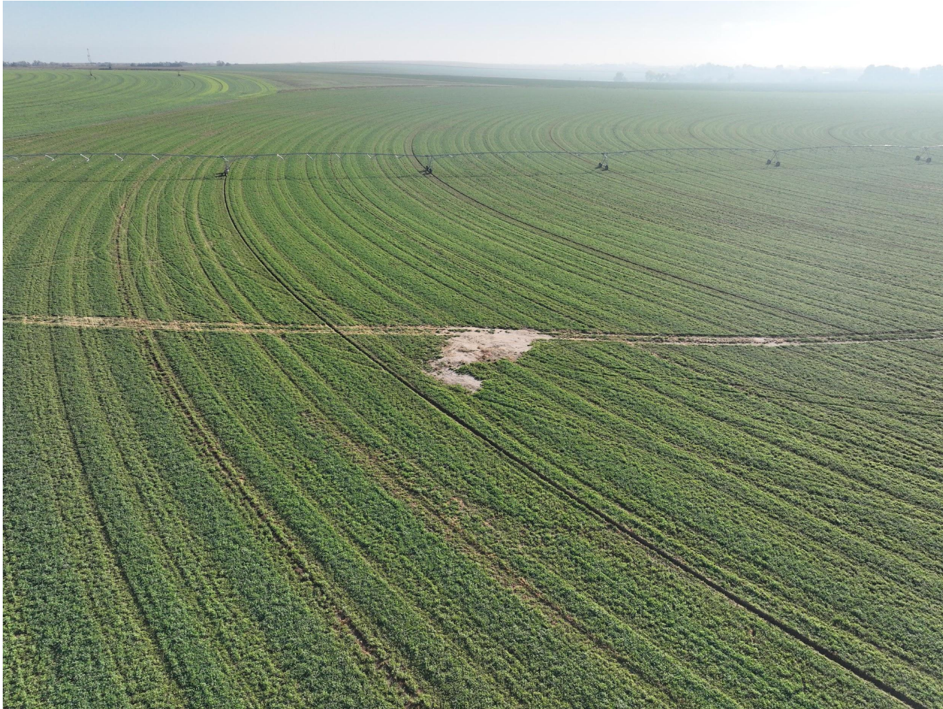
Photo 4. Drone aerial imagery taken west of well location, facing east (displaying the well).