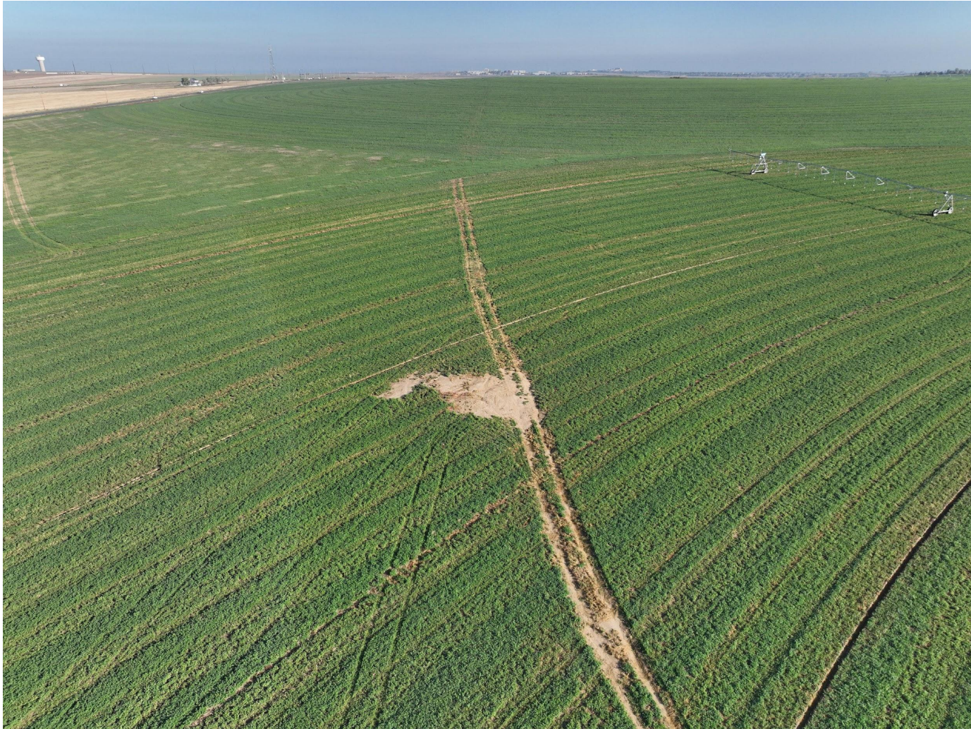
Photo 3. Drone aerial imagery taken south of well location, facing north (displaying the well).