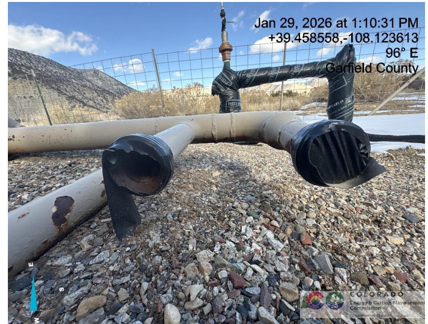
Photo # 7403 Piping on dehy disconnected/dehy not in use/unused equipment – Additionally open ended piping on dehy/wildlife hazard/available for entry by wildlife