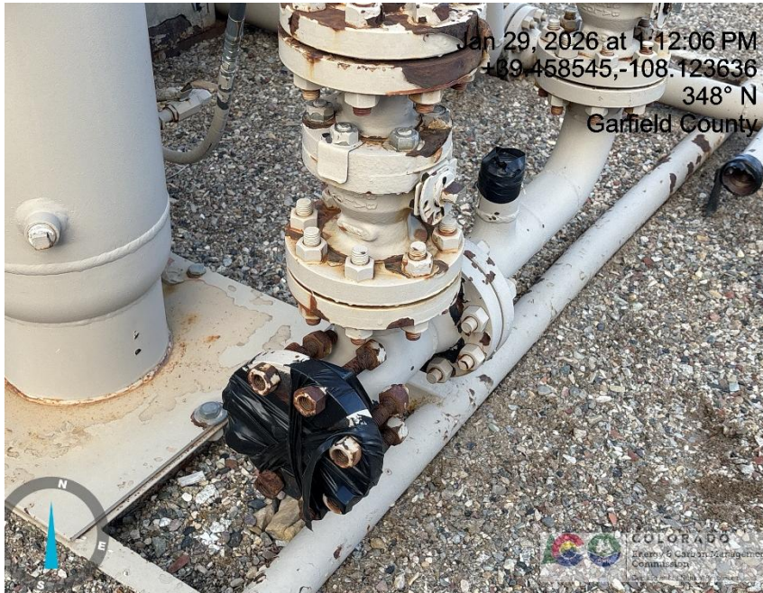
Photo # 7401 Piping on dehy disconnected/dehy not in use/unused equipment