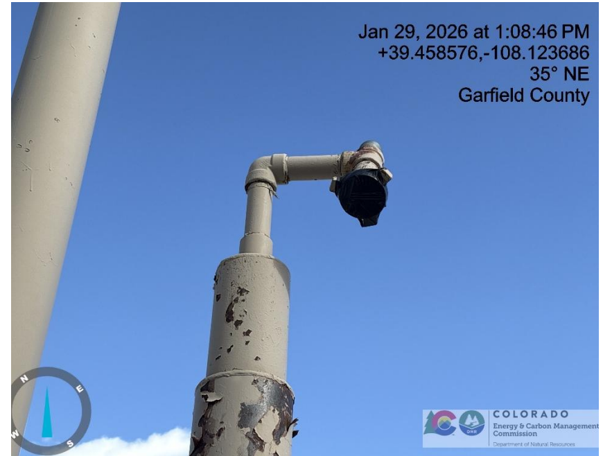
Photo # 7402 Still column piping on dehy disconnected/dehy not in use/unused equipment