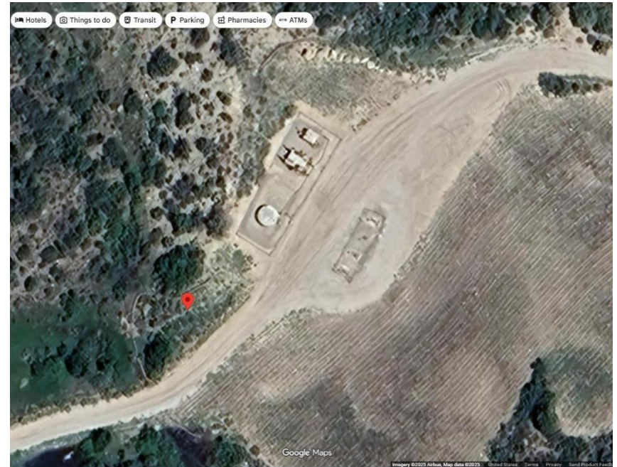
Photo # 7408 Scout Card record coordinates for the FEDERAL GM 541-8 well - Coordinates appear to be off by approximately 123 ft (coordinates incorrect/not in compliance with CECMC Rules 216 & 414 – records require updating)

Photo # 7407 Scout Card record coordinates for the FEDERAL GM 541-8 well - Coordinates appear to be off by approximately 123 ft (coordinates incorrect/not in compliance with CECMC Rules 216 & 414 – records require updating)