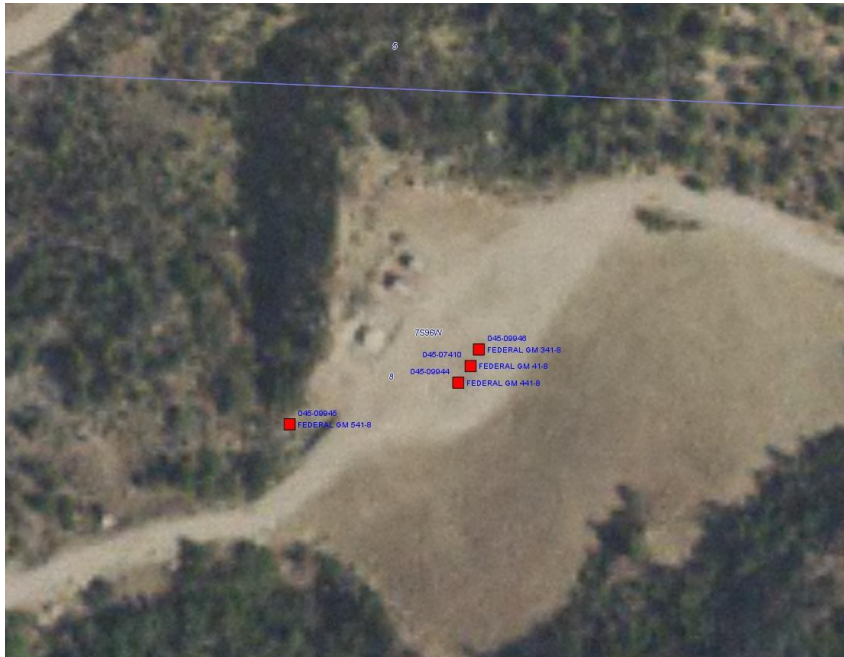
Photo # 7407 Scout Card record coordinates for the FEDERAL GM 541-8 well - Coordinates appear to be off by approximately 123 ft (coordinates incorrect/not in compliance with CECMC Rules 216 & 414 – records require updating)