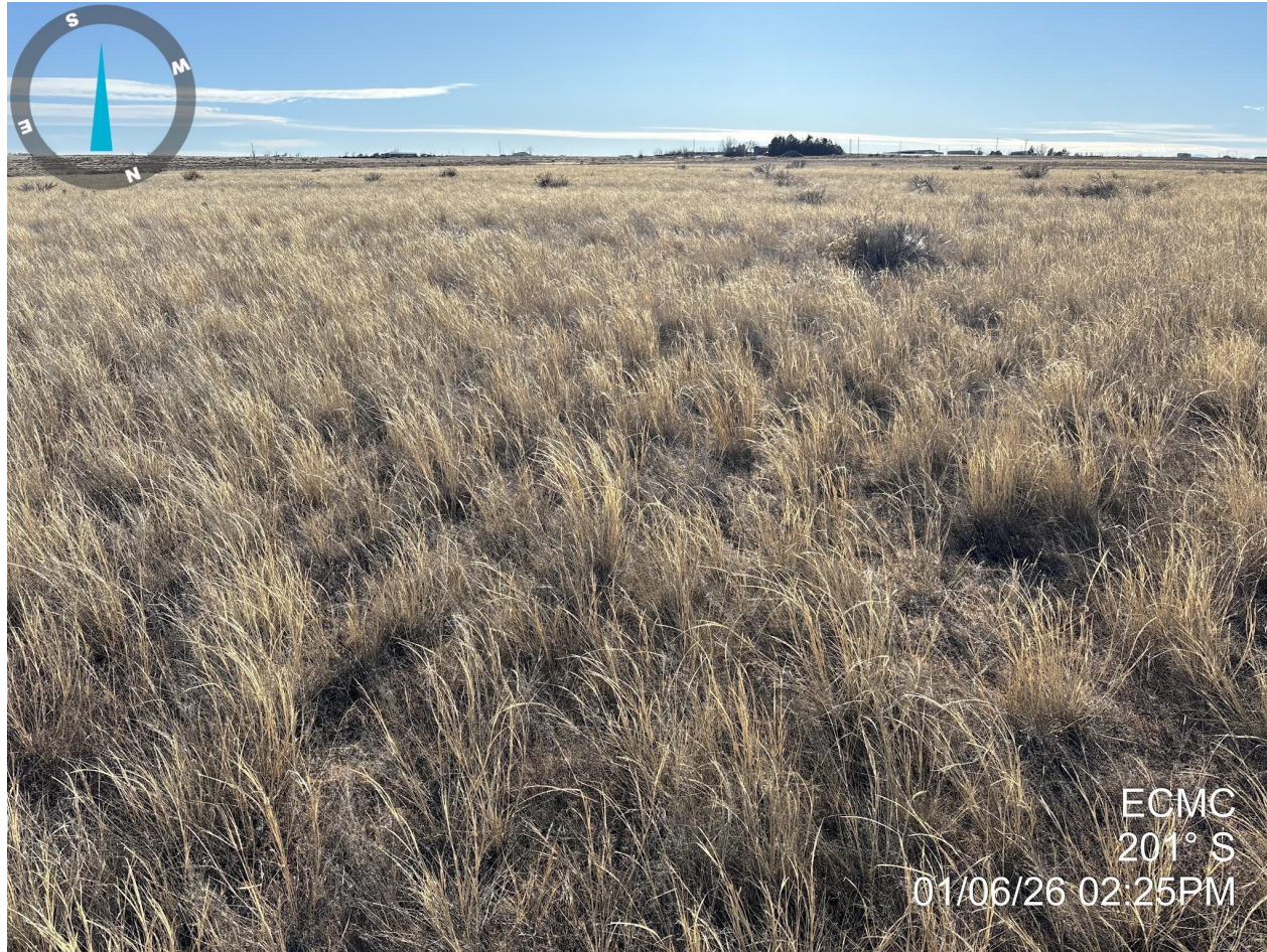
Photo 7. Photo taken of the reference area to the location, southwest of the location, facing south. Photo illustrates perennial grass vegetation.