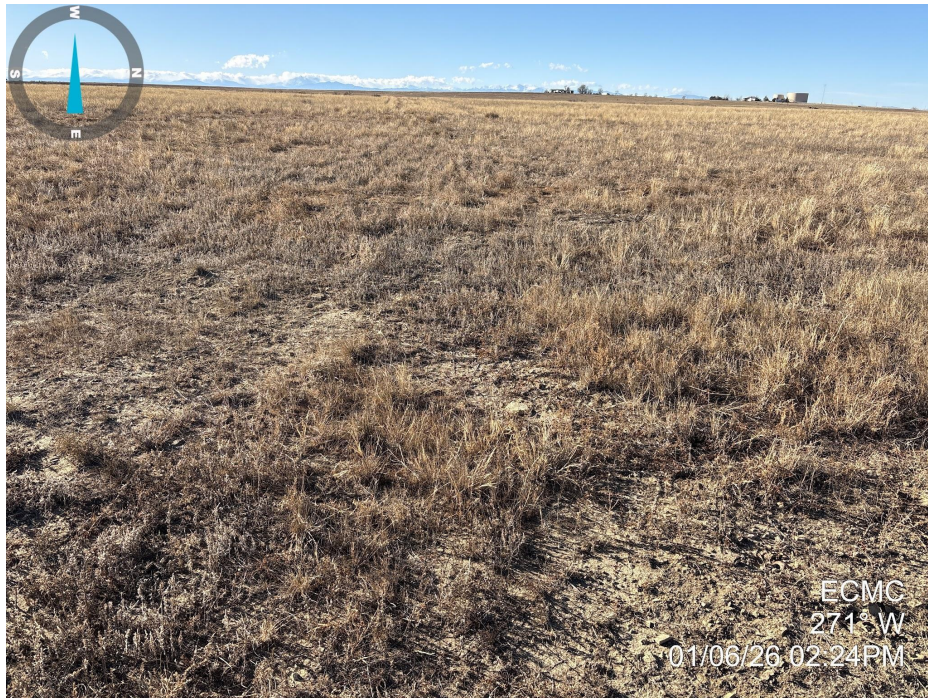
Photo 4. Photo taken of the well location, facing west. See comments under Photo 1.