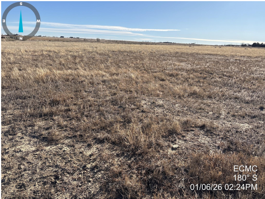
Photo 3. Photo taken of the well location, facing south. See comments under Photo 1.