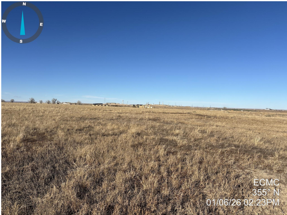
Photo 1. Photo taken of the well location, facing north. Photo illustrates that final reclamation activities appear to have taken place, but vegetation establishment does not meet Rule 1004 standards and weedy annual vegetation including kochia ( Bassia scoparia ) was observed across the location.