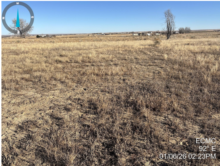
Photo 2. Photo taken of the well location, facing east. See comments under Photo 1.