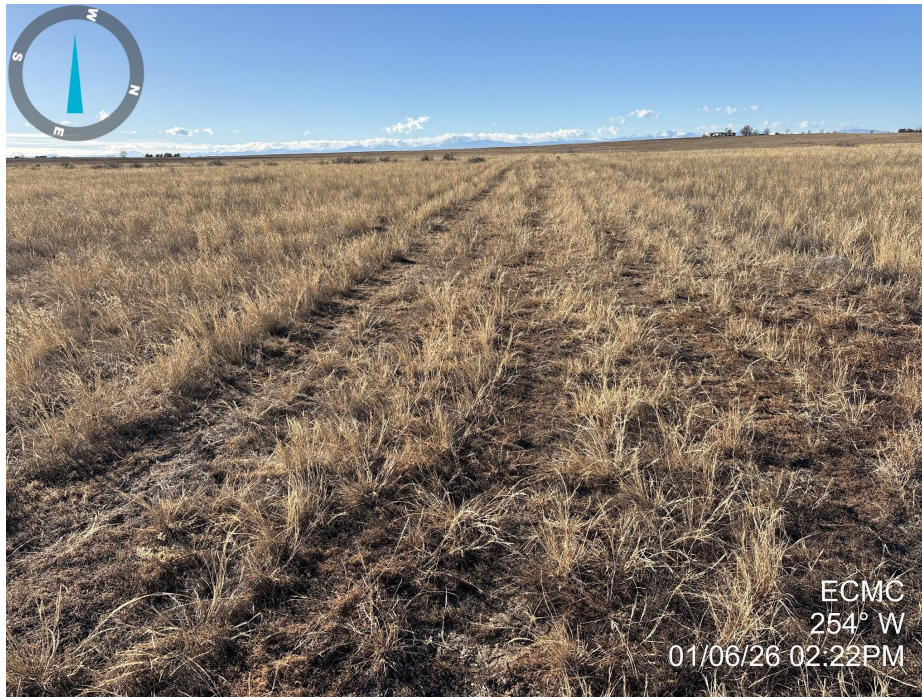
Photo 6. Photo taken of the access road to the location, facing west. Photo illustrates that final reclamation activities appear to have taken place along the road, but vegetation has not established to Rule 1004 standards.