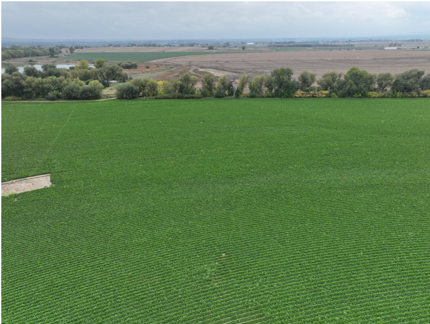
Photo 5. Drone aerial imagery taken north of well location, facing south (displaying the well).