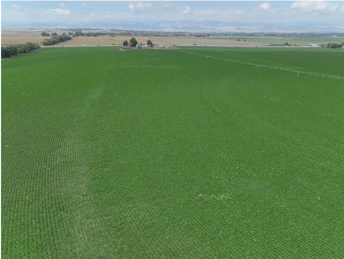
Photo 6. Drone aerial imagery taken east of well location, facing west (displaying the well).