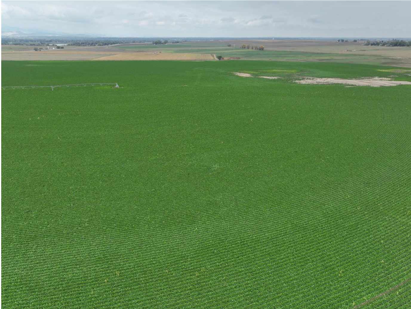
Photo 3. Drone aerial imagery taken south of well location, facing north (displaying the well, access road, and presumed flowline).