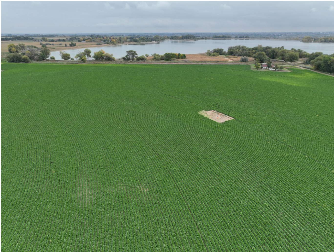
Photo 4. Drone aerial imagery taken west of well location, facing east (displaying the well).