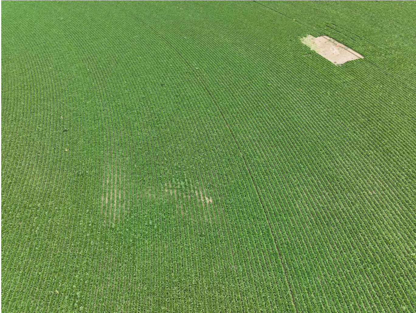
Photo 7. Drone aerial imagery looking downward at the well (displaying the well).

Inspection Photos Location Name: Vanthuyn 42-34 Location ID: 321434