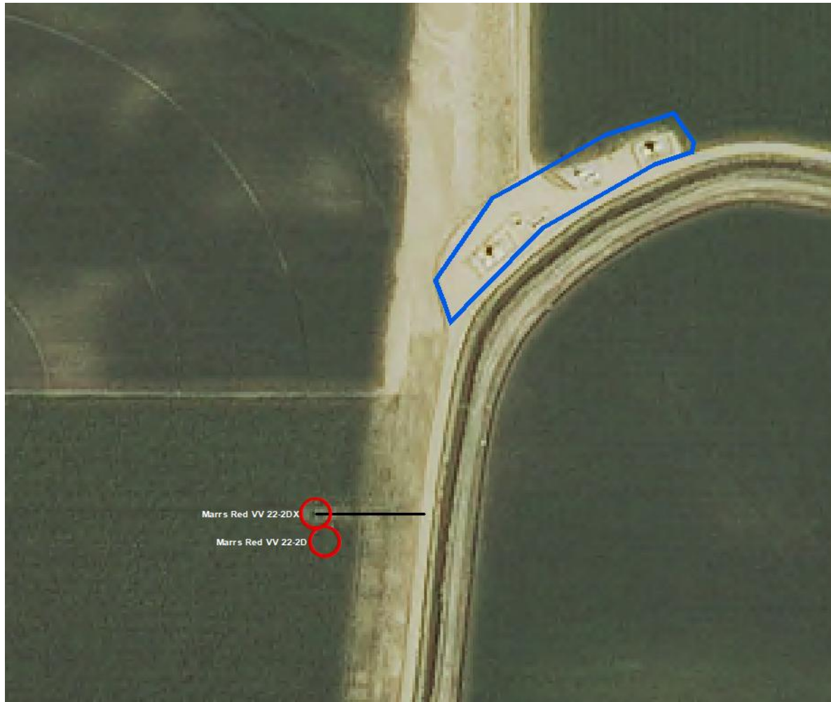
Photo 1. NAIP aerial imagery (2013) illustrating the well locations (red circles), associated tank battery location (blue polygon) and access road (black line). The tank battery is associated with location ID #319193.