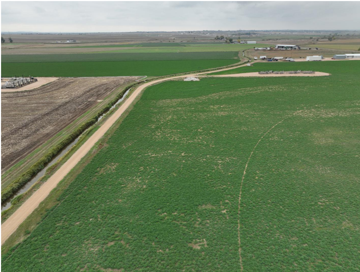
Photo 5. Drone aerial imagery taken north of well locations, facing south (displaying the wells).