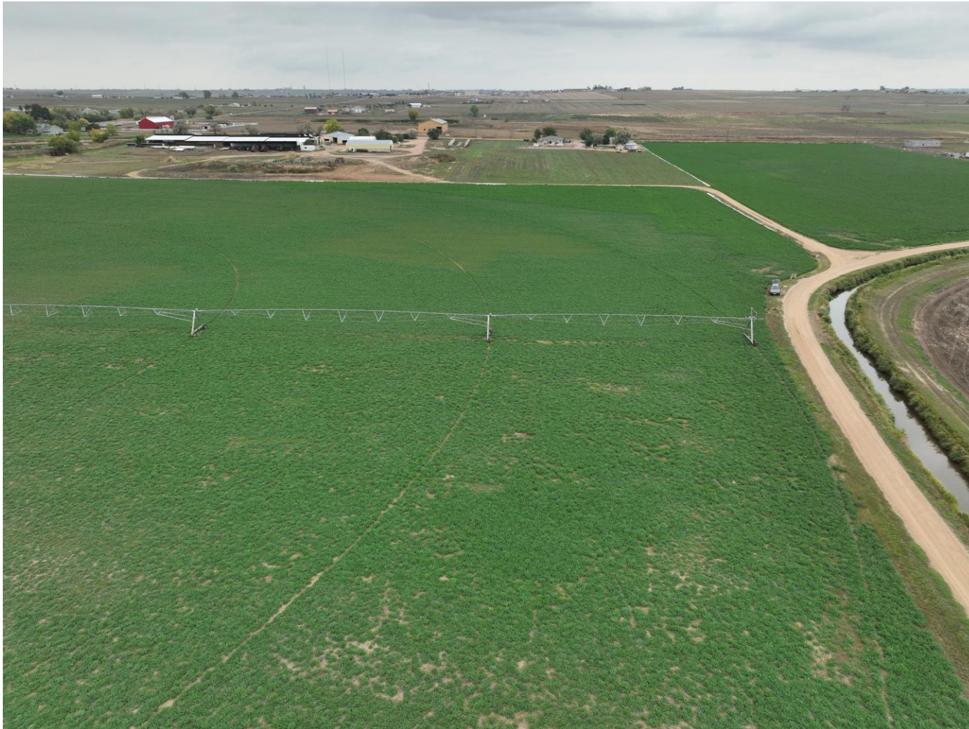
Photo 3. Drone aerial imagery taken south of well locations, facing north (displaying the wells and flowline).