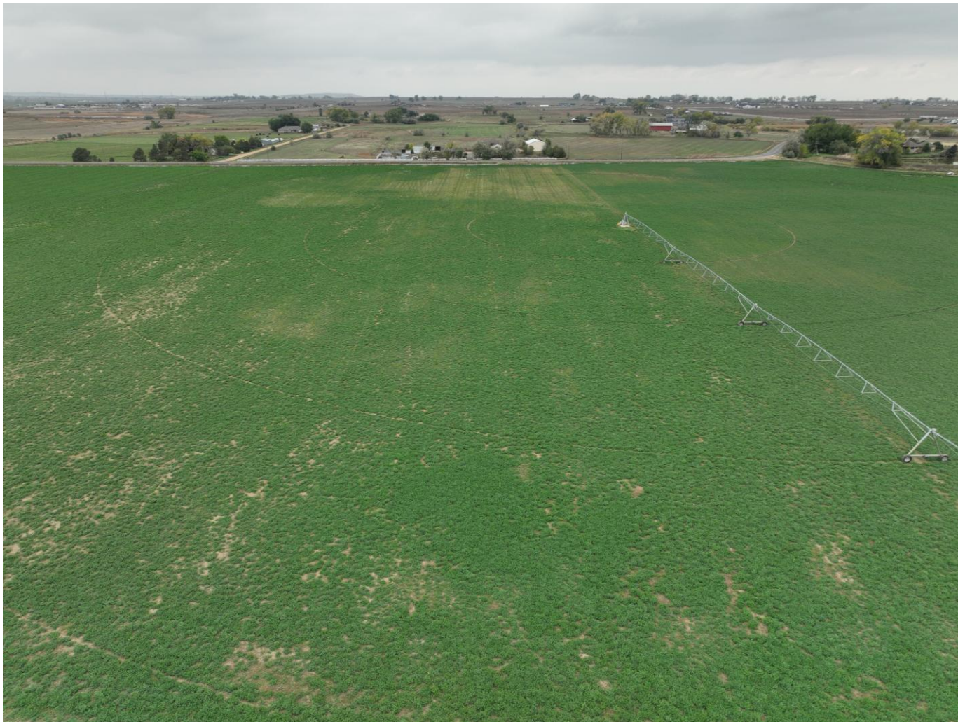
Photo 6. Drone aerial imagery taken east of well locations, facing west (displaying the wells).