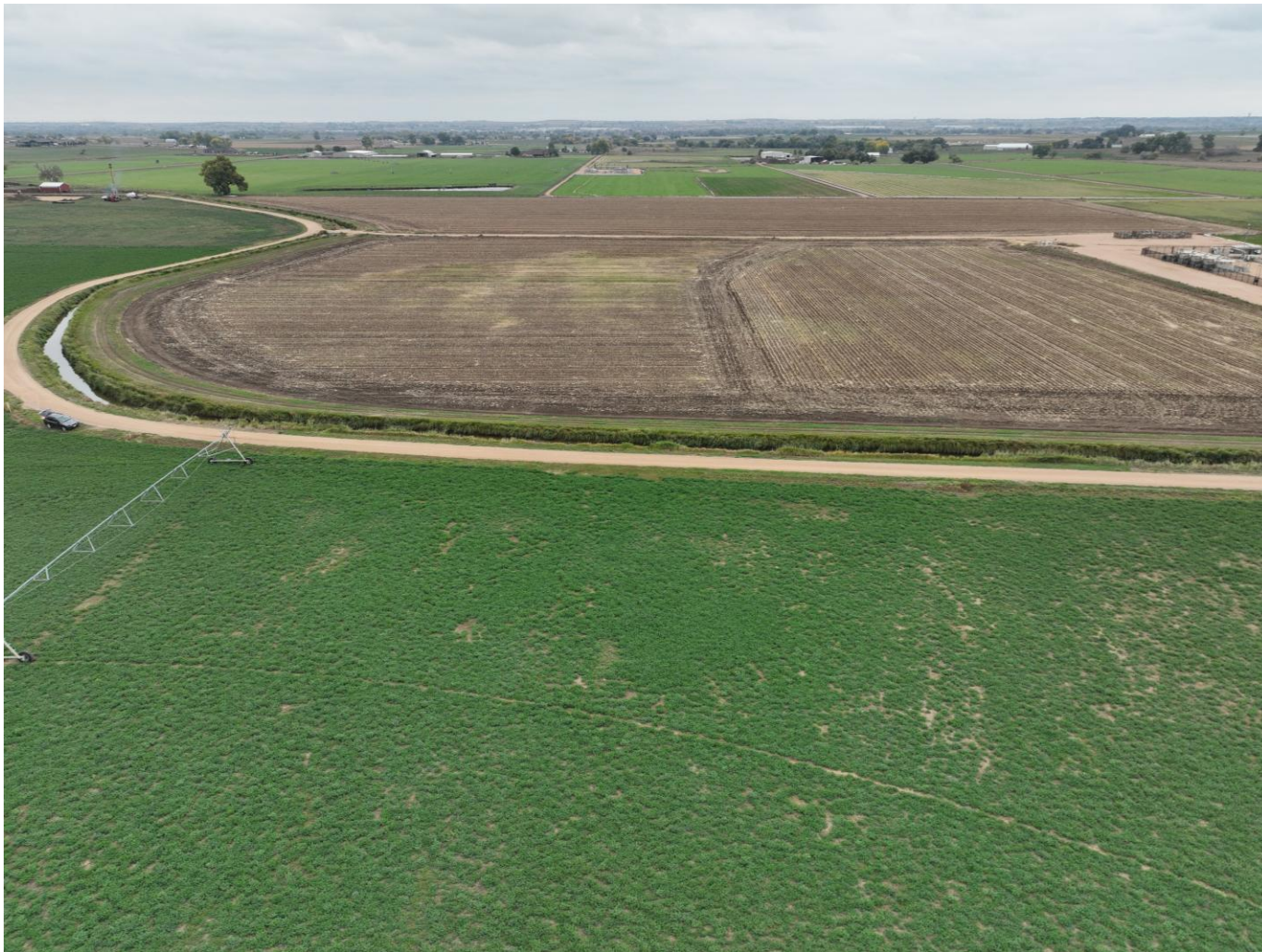
Photo 4. Drone aerial imagery taken west of well locations, facing east (displaying the wells and access road).