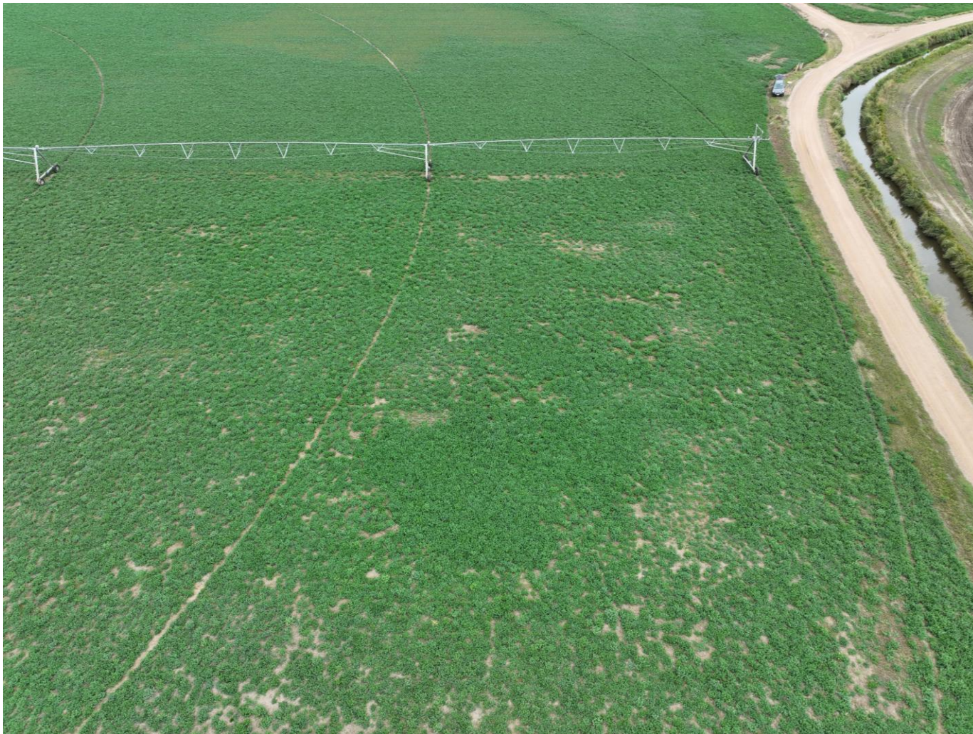
Photo 7. Drone aerial imagery looking downward at the wells (displaying the wells).