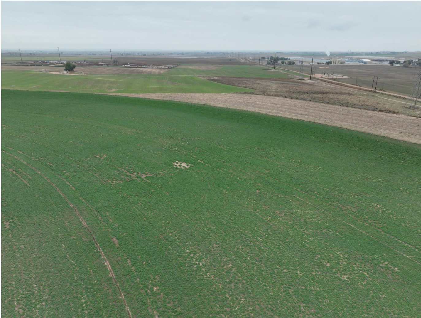
Photo 3. Drone aerial imagery taken south of well location, facing north (displaying the well).