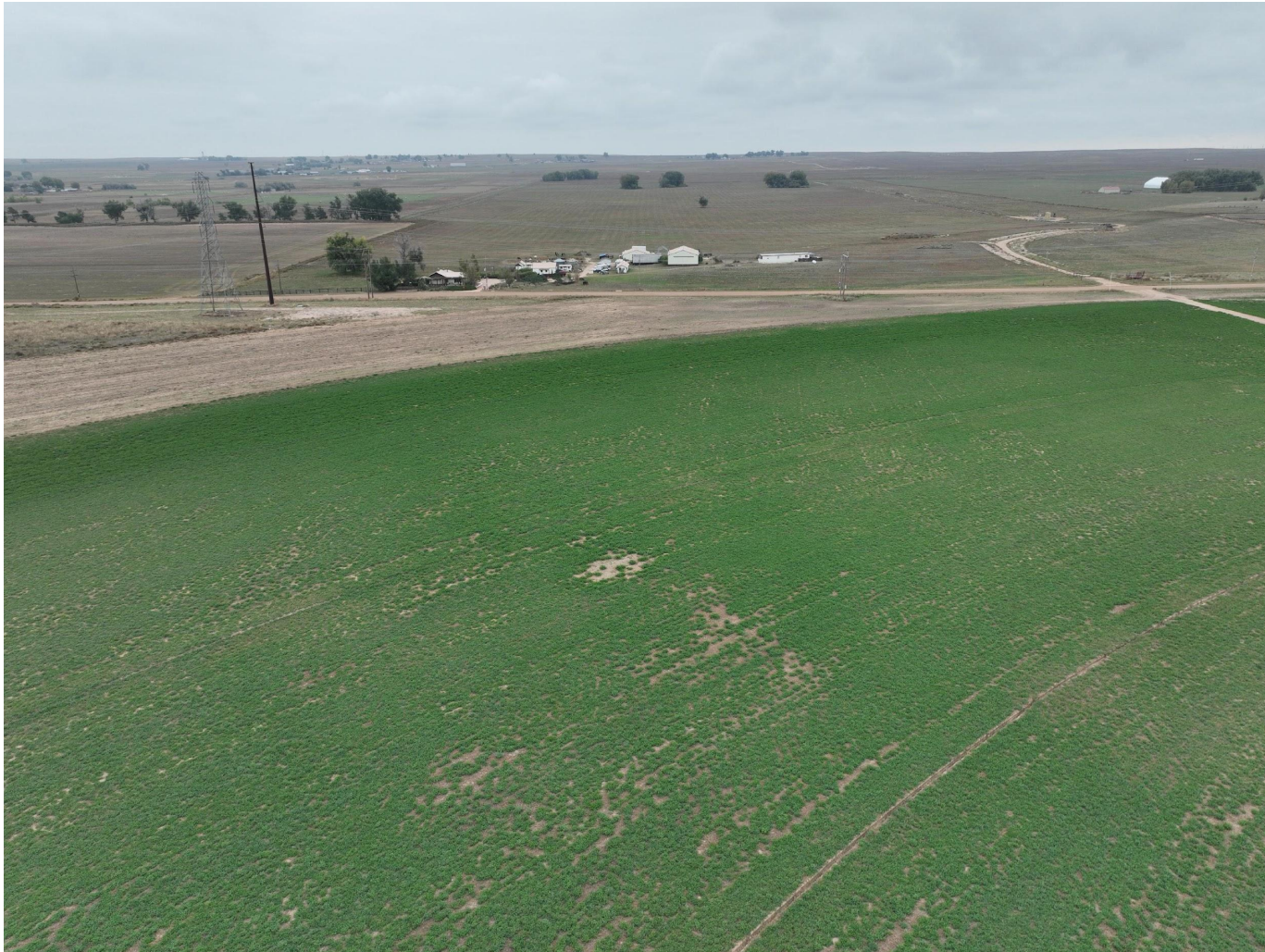
Photo 4. Drone aerial imagery taken west of well location, facing east (displaying the well and access road).