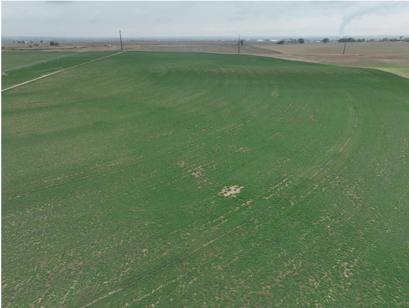
Photo 6. Drone aerial imagery taken east of well location, facing west (displaying the well).