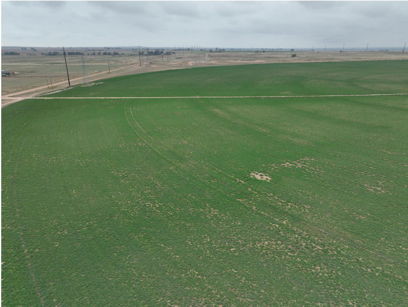
Photo 5. Drone aerial imagery taken north of well location, facing south (displaying the well and presumed flowline).