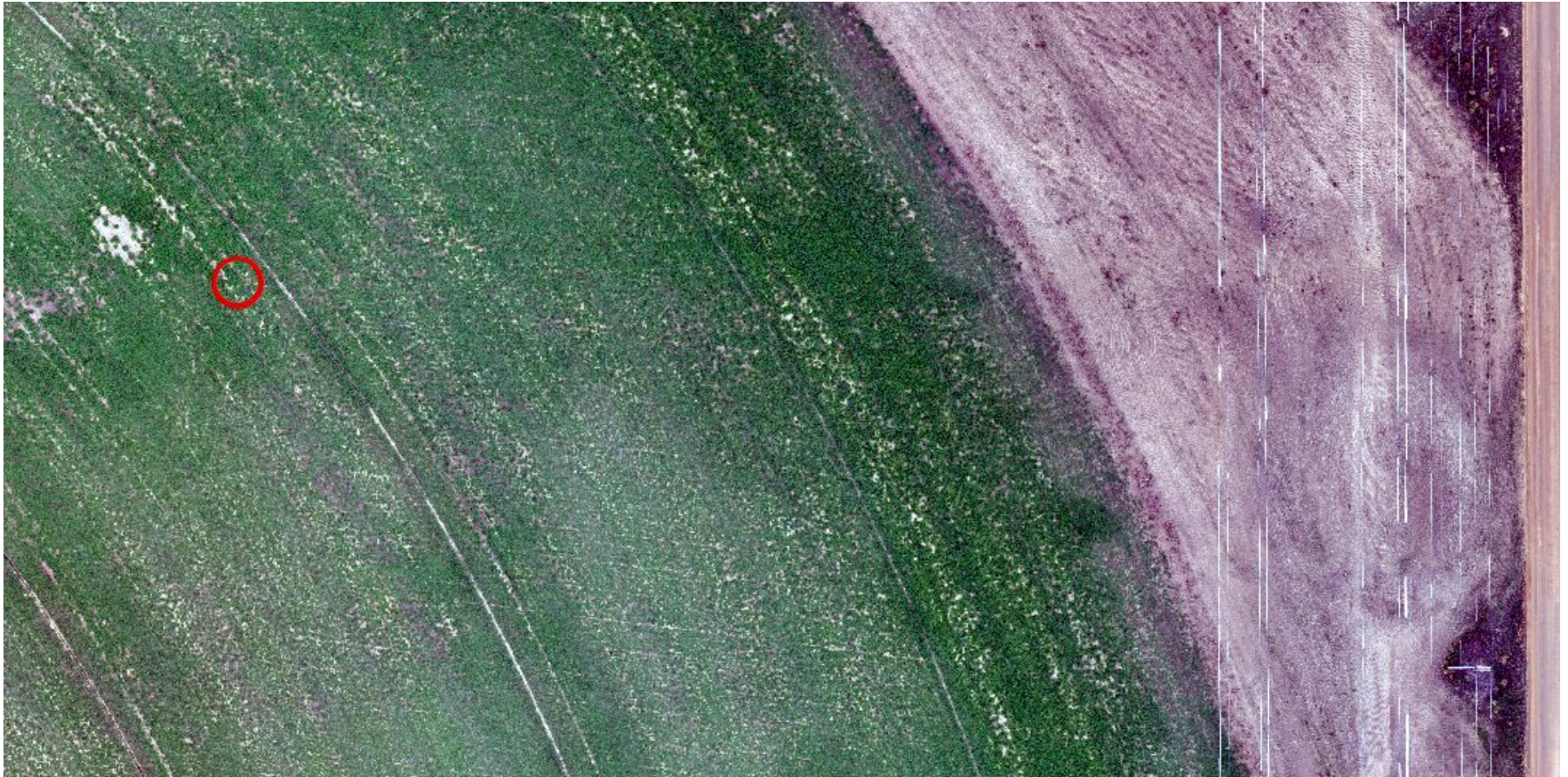
Photo 7. Close-up orthomosaic imagery of the well location (red circle) and access road. Note large patch in field not associated with well.