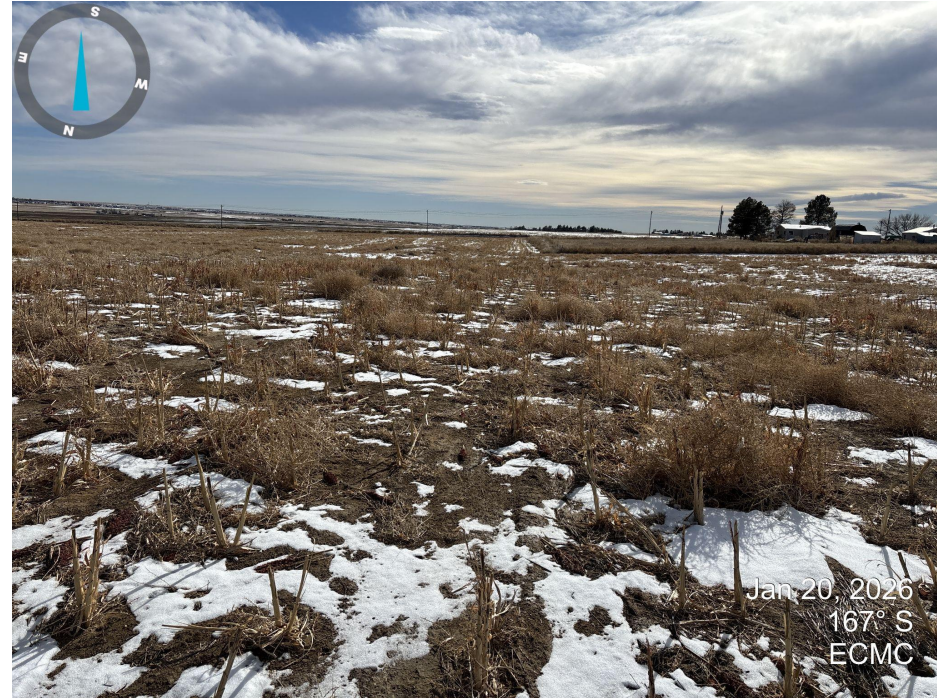
Photo 6. Looking south from the wellbore. See photo 3 comments.