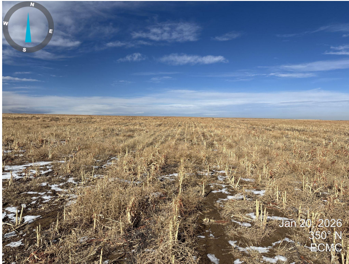
Photo 7. Reference area to the north of the well location.