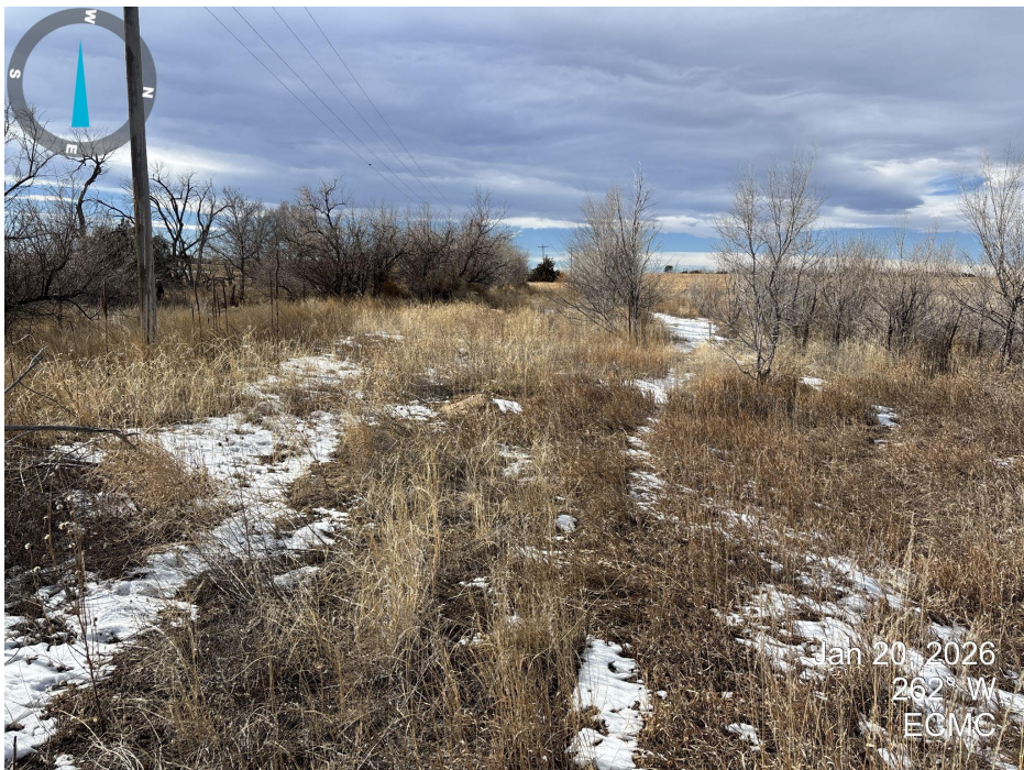
Photo 1. Picture taken looking down the access road from well API 001-07539 towards the well location. Desirable vegetation appears to have established on the access road. The powerline that served this well remains in place along the access road.