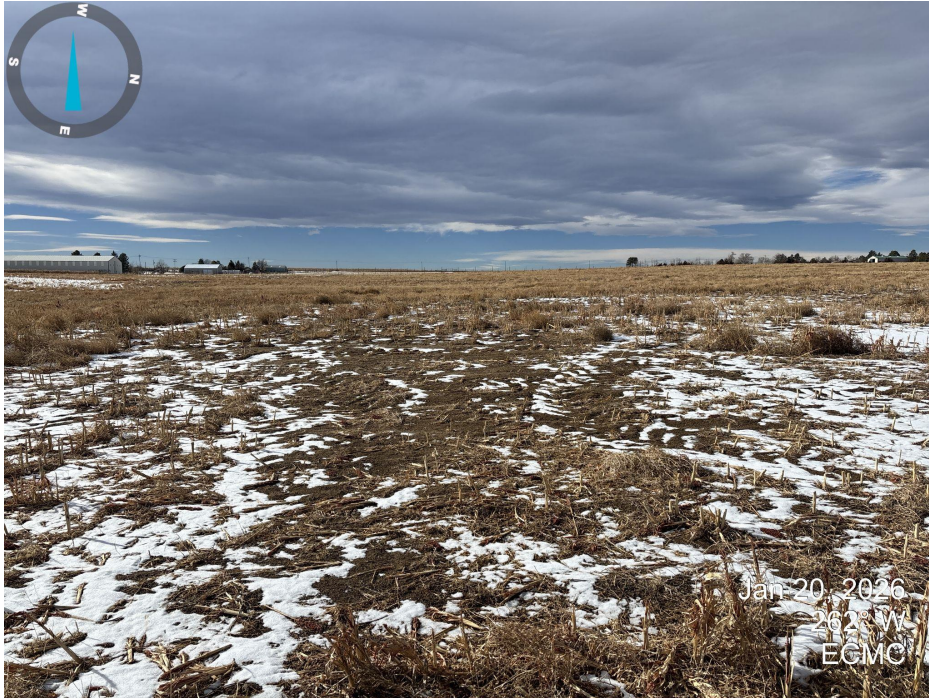
Photo 5. Looking west from the wellbore. See photo 3 comments.