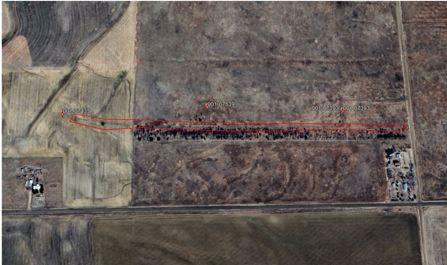
Photo 8. This section of power line appears to have been installed for oil and gas and does not extend past well 001-07435.