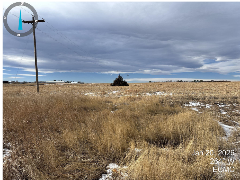
Photo 2. Looking west down the access road towards the well location. The land transitions from non-cropland to cropland. The field is out of growing season at the time of inspection.