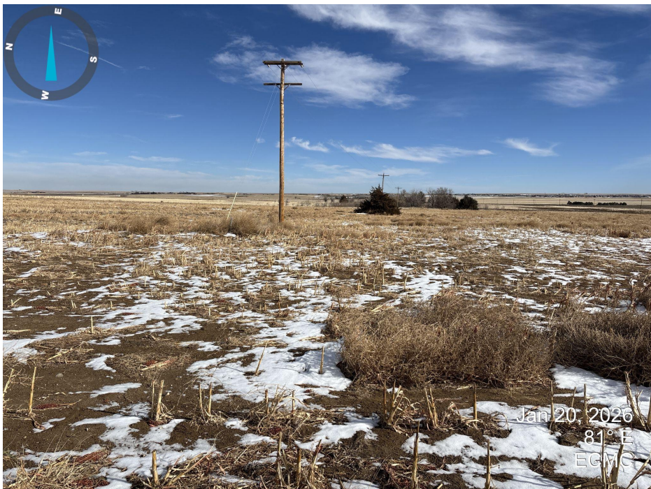
Photo 3. Looking east from the well area across the location. The electrical service terminates at this location and appears to be unused. The location is in cropland, fallow at the time of inspection.