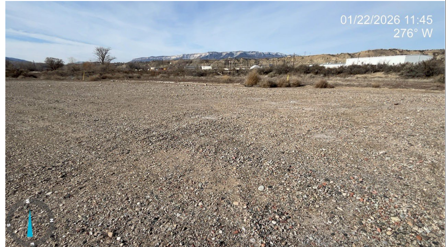
Photo 2: Photos showing an overview of the location looking east and west, respectively.