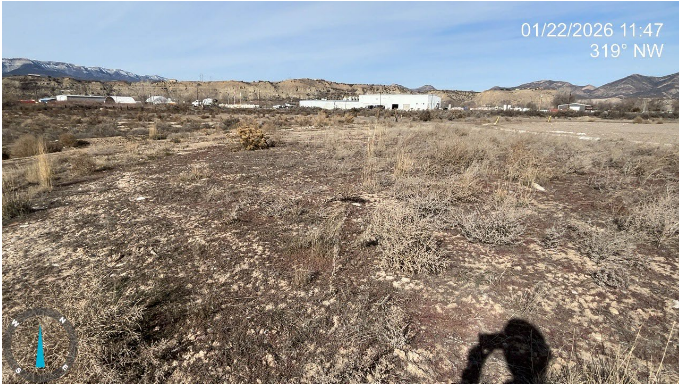
Photo 5: Photo showing damaged perimeter fencing has been removed from the location. The Corrective Action from inspection #719200568 has been resolved.