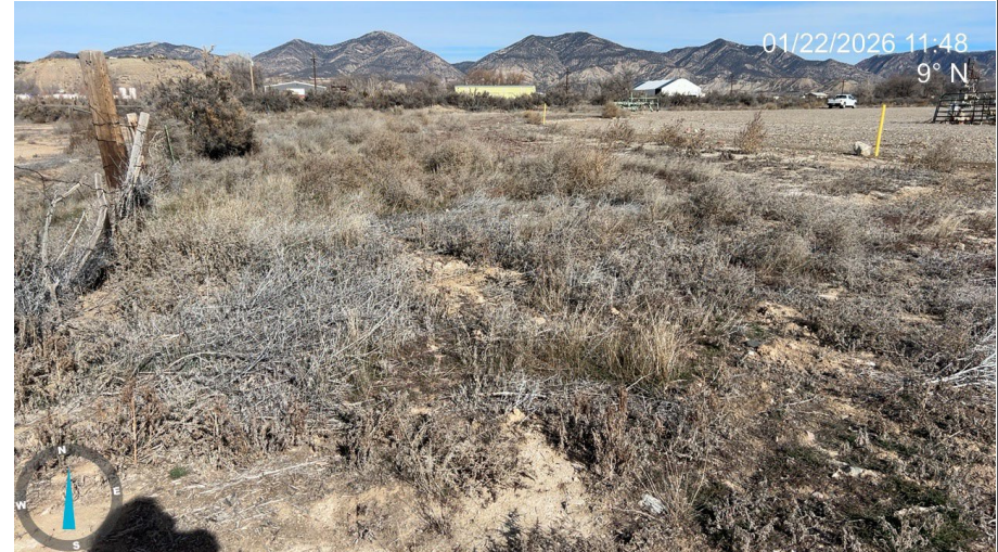
Photo 3: Photos showing an overview of the southern and western interim areas, respectively. See inspection #719200568 for additional reclamation details.