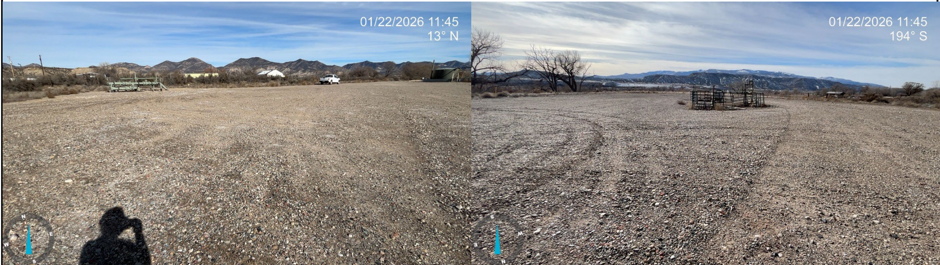
Photo 1: Photos showing an overview of the location looking north and south, respectively.