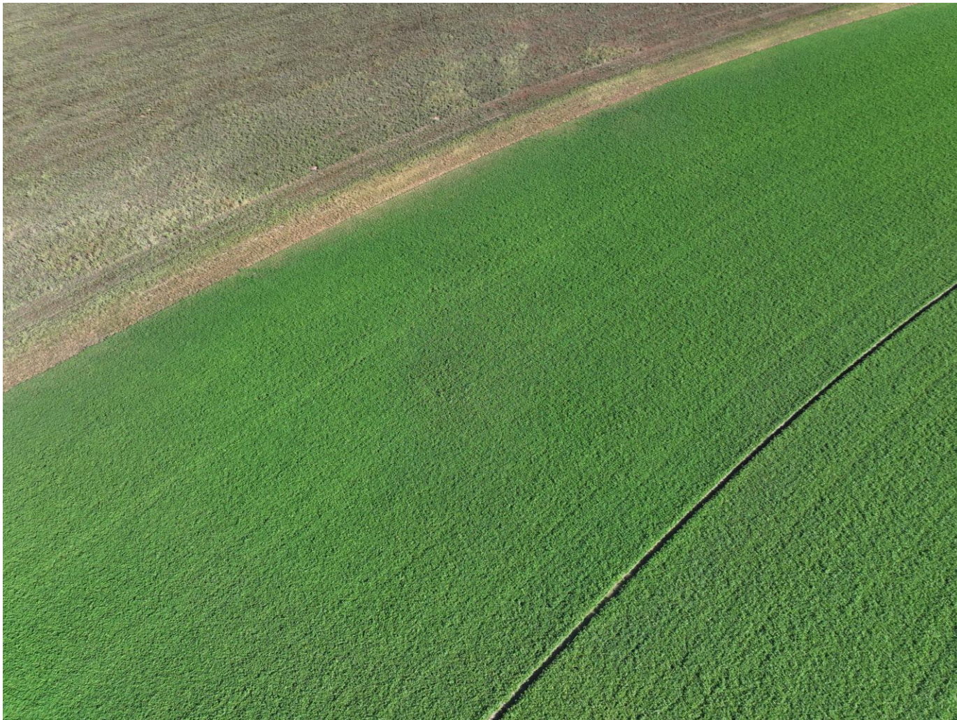
Photo 7. Drone aerial imagery looking downward at the well (displaying the well).