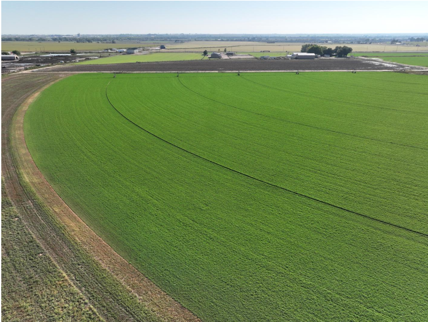
Photo 4. Drone aerial imagery taken west of well location, facing east (displaying the well and access road).