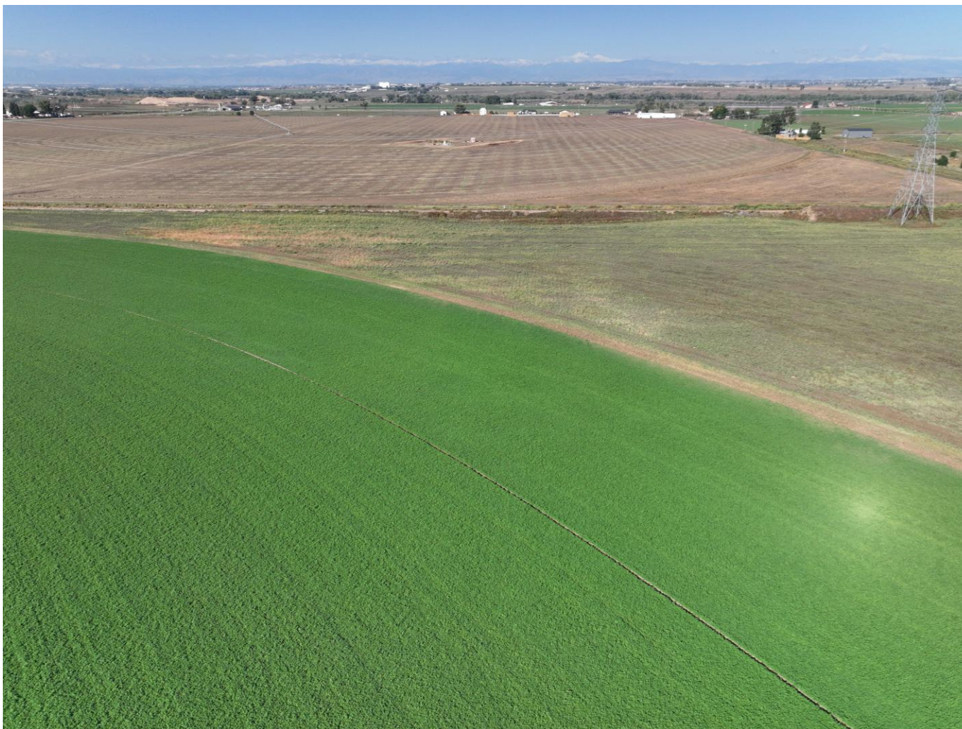
Photo 6. Drone aerial imagery taken east of well location, facing west (displaying the well).