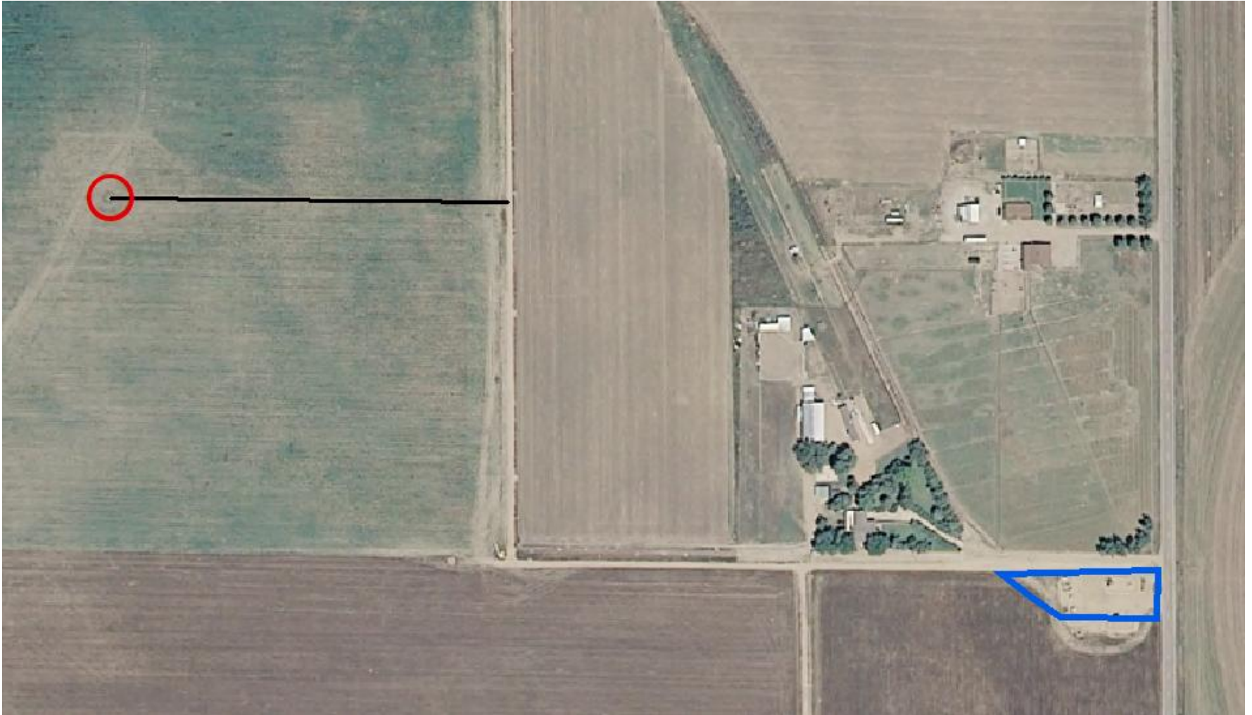
Photo 1. NAIP aerial imagery (2009) illustrating the well location (red circle) associated tank battery location (blue polygon) and access road (black line). The tank battery is associated with location ID #462548.