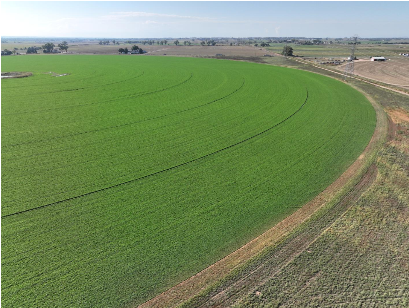
Photo 5. Drone aerial imagery taken north of well location, facing south (displaying the well).