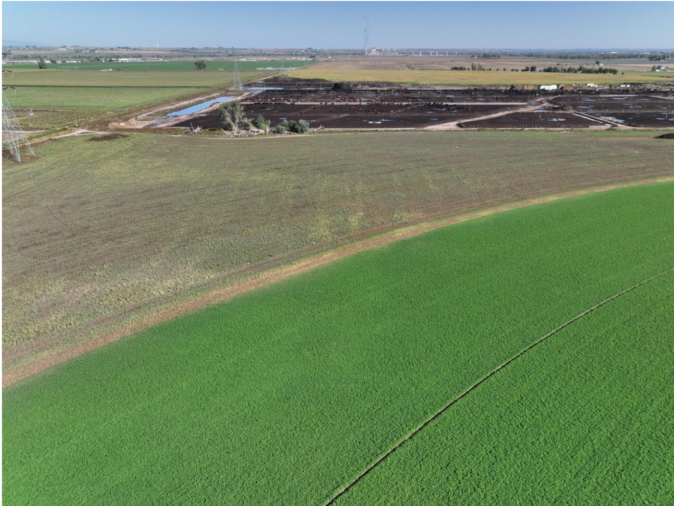
Photo 3. Drone aerial imagery taken south of well location, facing north (displaying the well).