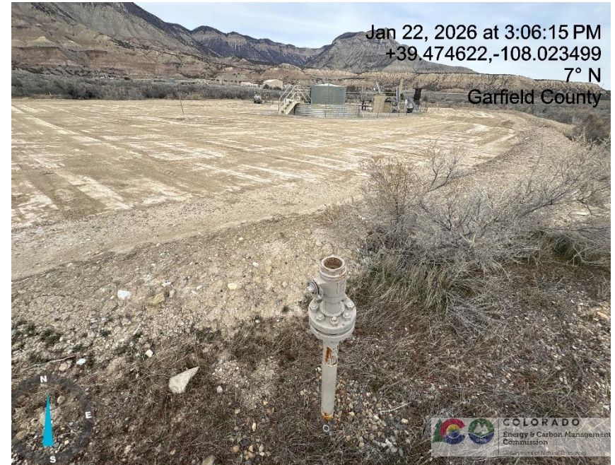
Photo # 4389 Observed valve on BH line going to ECD closed & tagged out