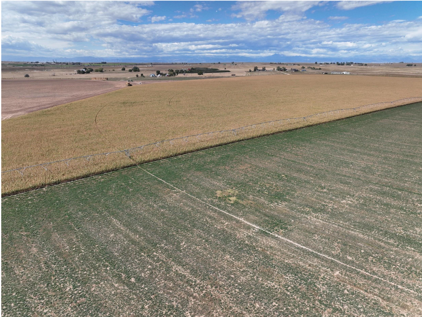
Photo 6. Drone aerial imagery taken east of well location, facing west (displaying the well).