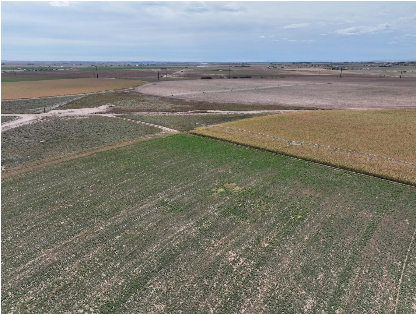
Photo 5. Drone aerial imagery taken north of well location, facing south (displaying the well).