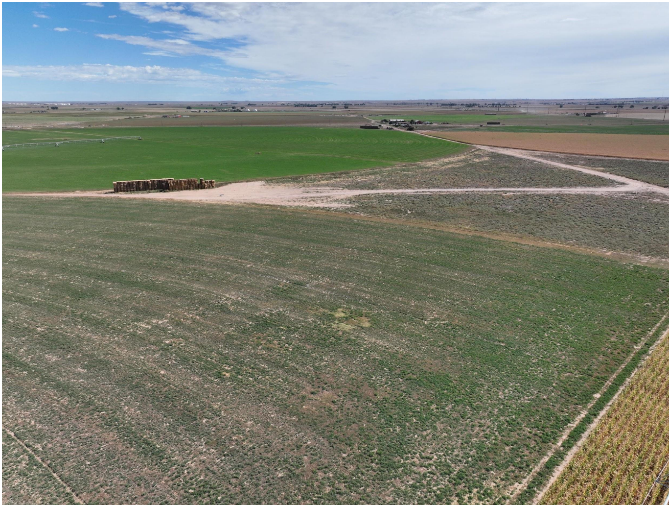
Photo 4. Drone aerial imagery taken west of well location, facing east (displaying the well and access road).