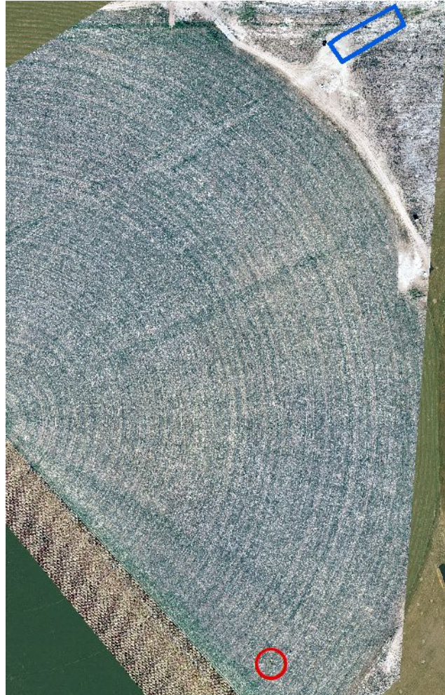
Photo 2. Orthomosaic (drone) imagery taken 9/22/2025 and NAIP aerial imagery (2023) illustrating the well location (red circle) and associated tank battery (blue polygon).