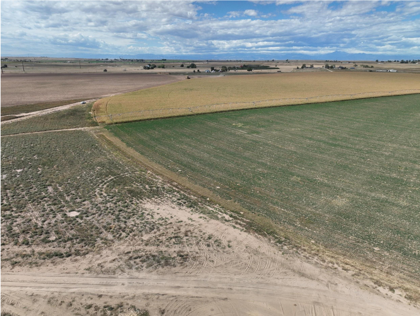
Photo 7. Drone aerial imagery taken northeast of well access road takeoff, facing southwest (displaying the well access road and well).