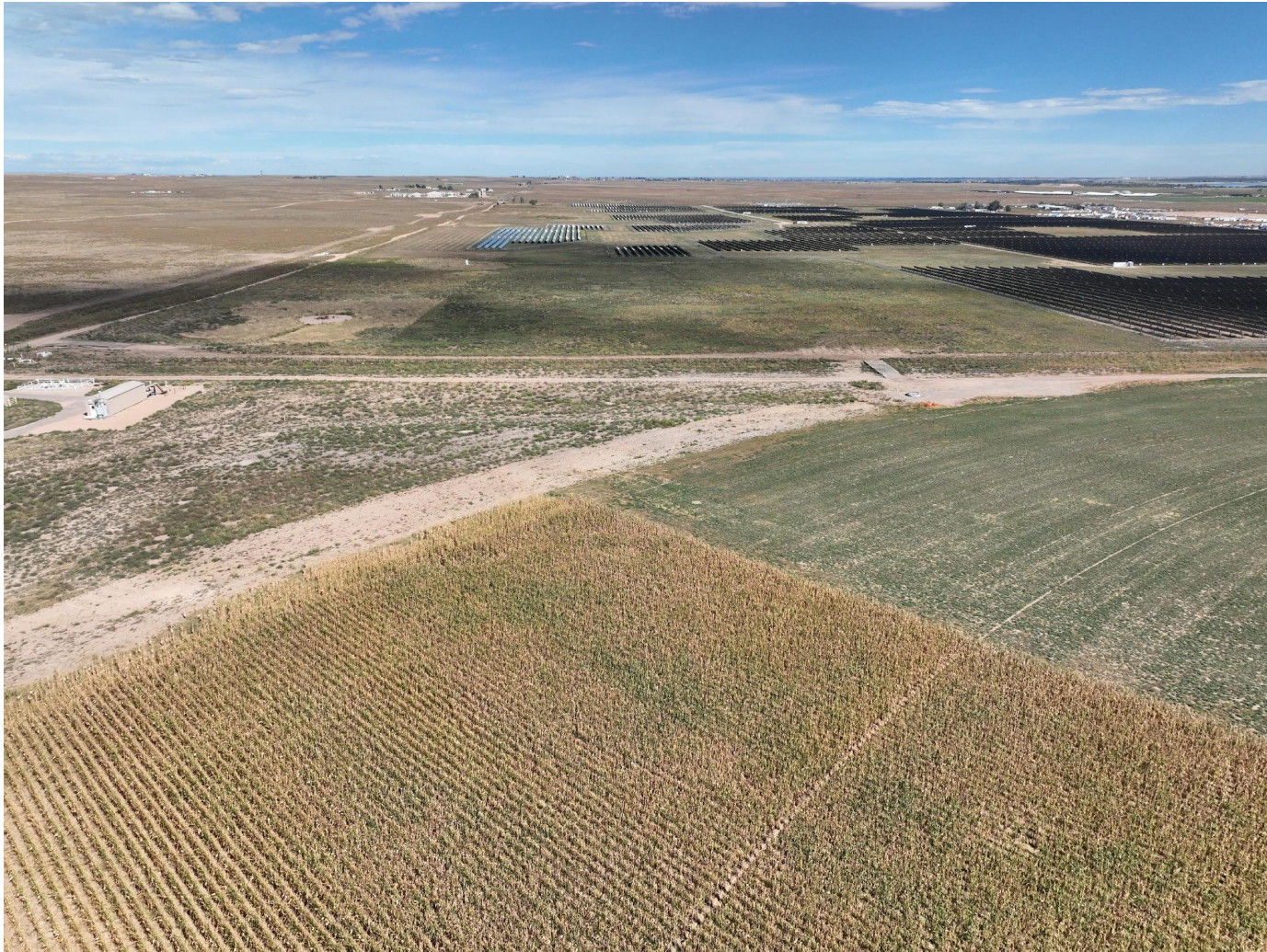
Photo 3. Drone aerial imagery taken south of well location, facing north (displaying the well).

Inspection Photos Location Name: B & M #11-5 Location ID: 305703