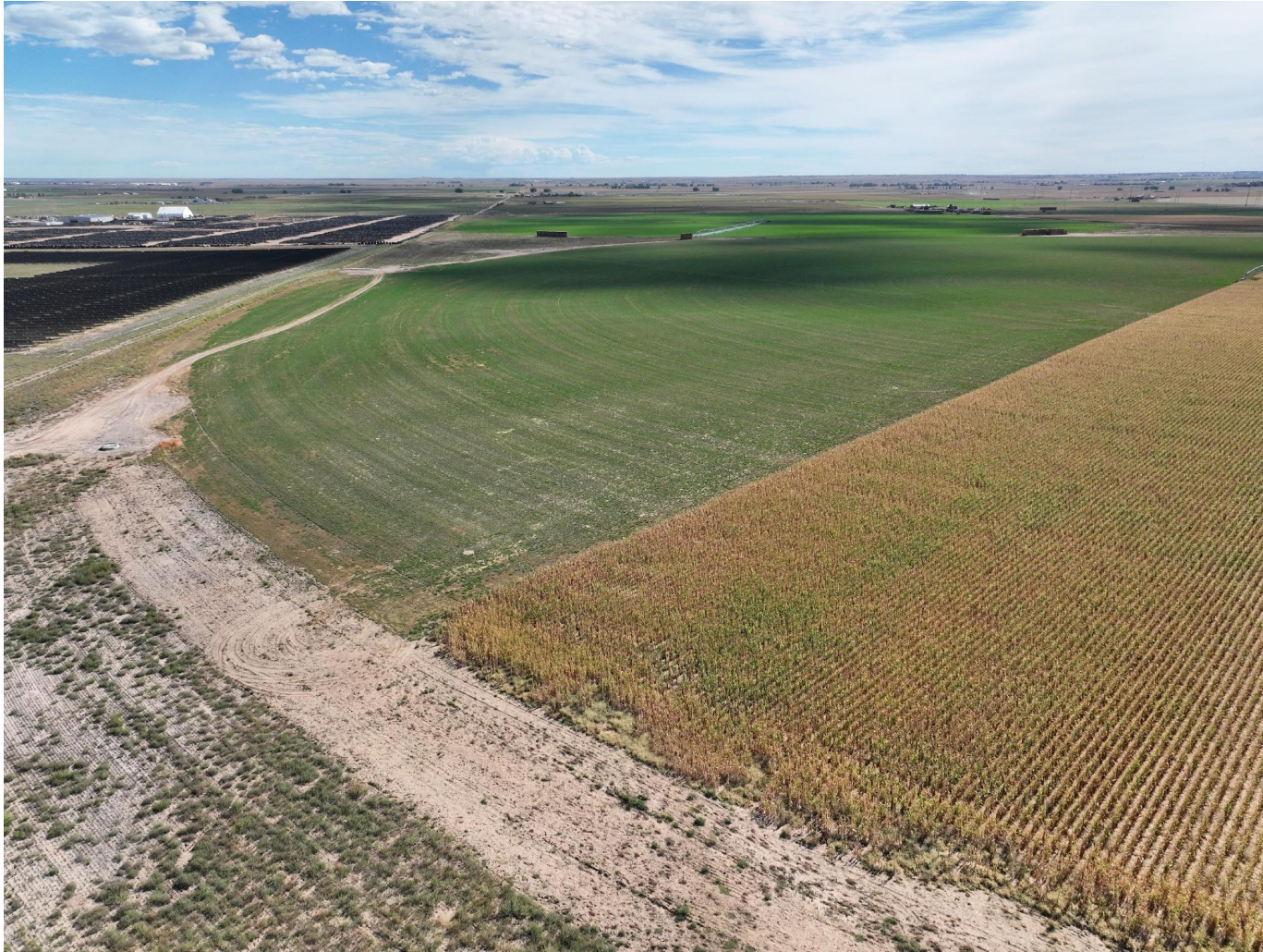
Photo 4. Drone aerial imagery taken west of well location, facing east (displaying the well).