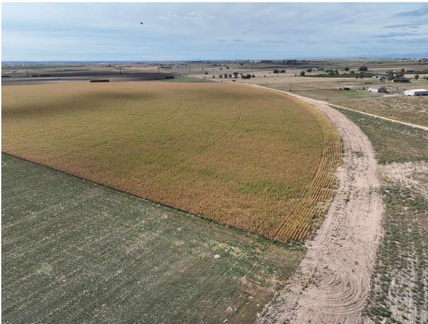
Photo 7. Drone aerial imagery taken northeast of well location, facing southwest (displaying the well and presumed flowline).