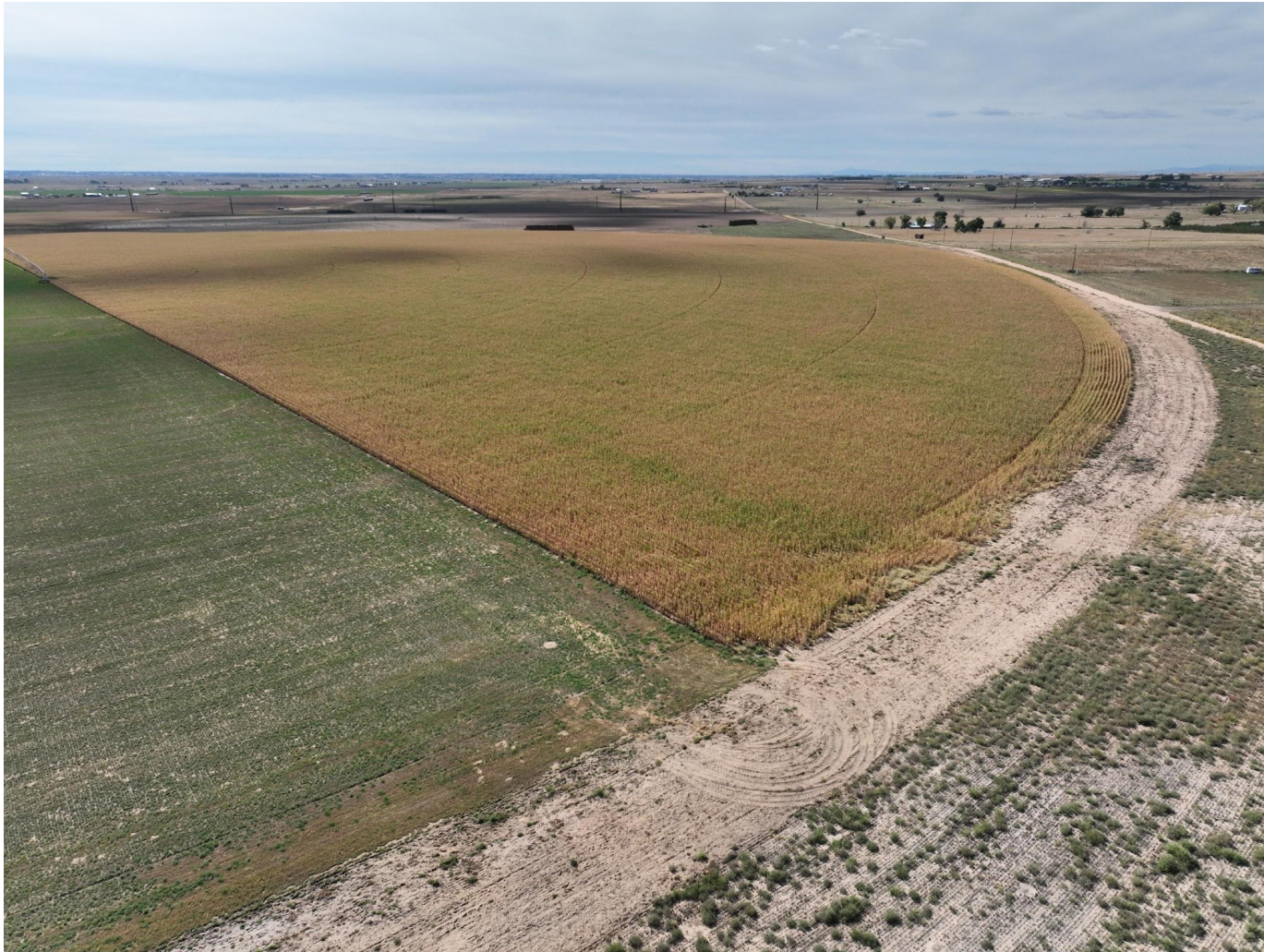
Photo 5. Drone aerial imagery taken north of well location, facing south (displaying the well).