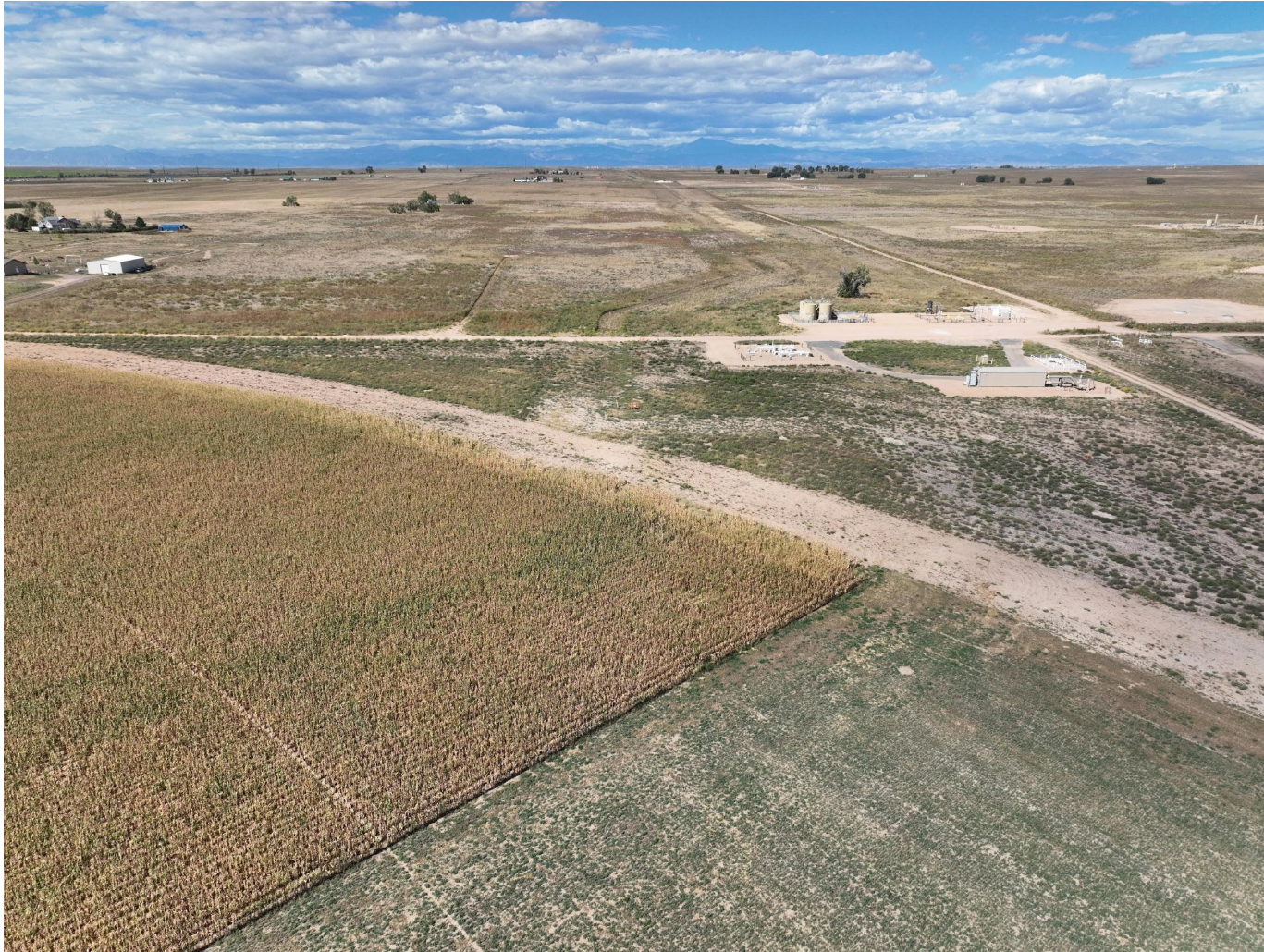
Photo 6. Drone aerial imagery taken east of well location, facing west (displaying the well and access road).