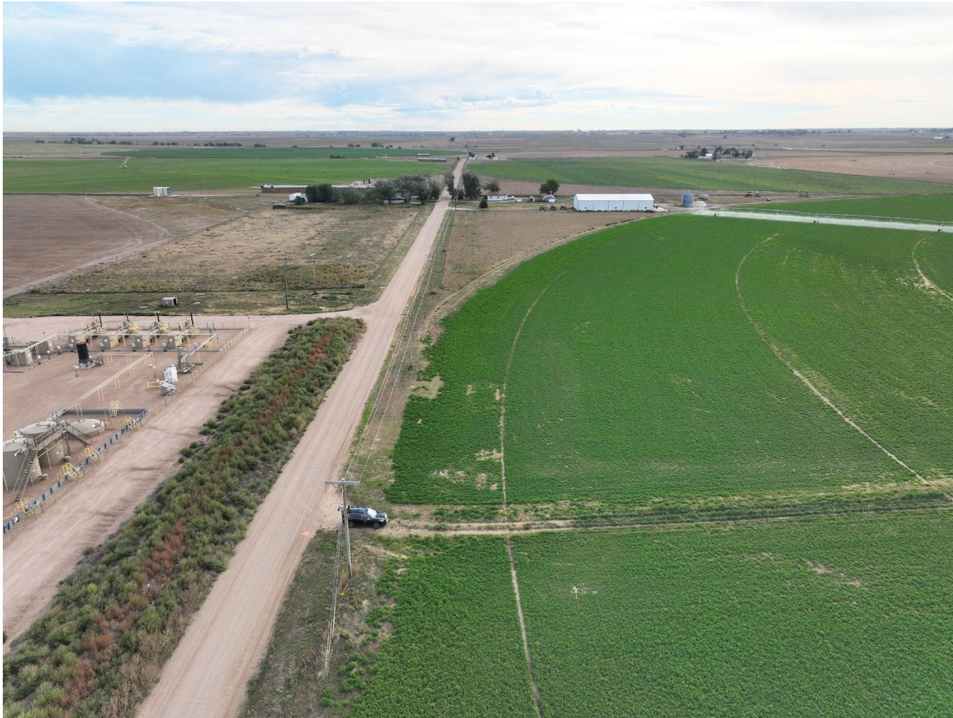
Photo 9. Drone aerial imagery taken west of the tank battery location, facing east (displaying the TB).