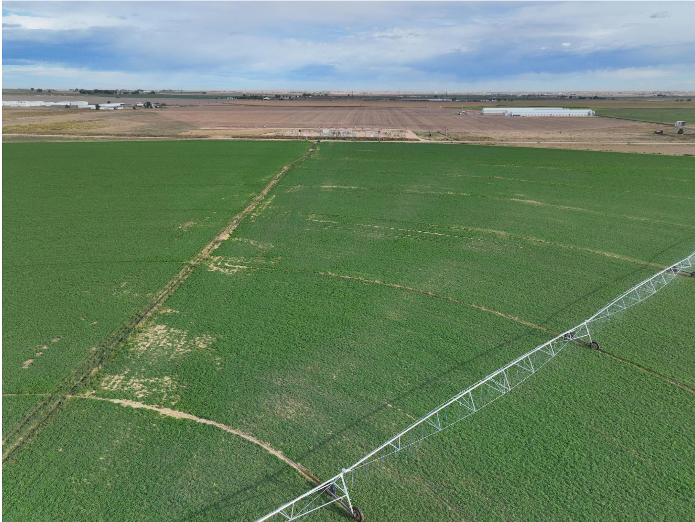
Photo 3. Drone aerial imagery taken south of well location, facing north (displaying the well and presumed flowline).