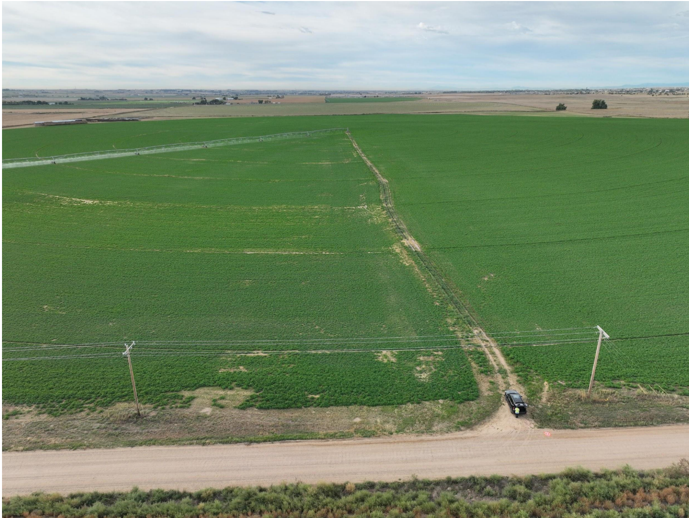
Photo 10. Drone aerial imagery taken north of the tank battery location, facing south (displaying the TB and presumed flowline).