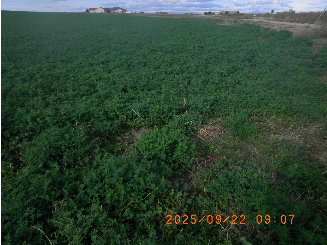
Photo 13. Ground photo taken on the west edge of the TB facing west showing reference vegetation growth.