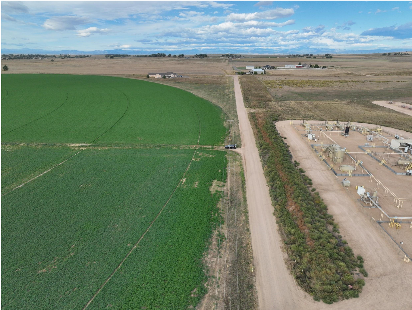
Photo 11. Drone aerial imagery taken east of the tank battery location, facing west (displaying the TB).