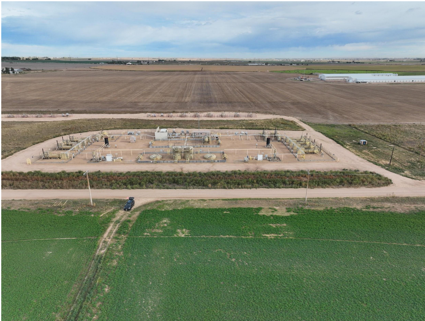
Photo 8. Drone aerial imagery taken south of the tank battery location, facing north (displaying the TB).