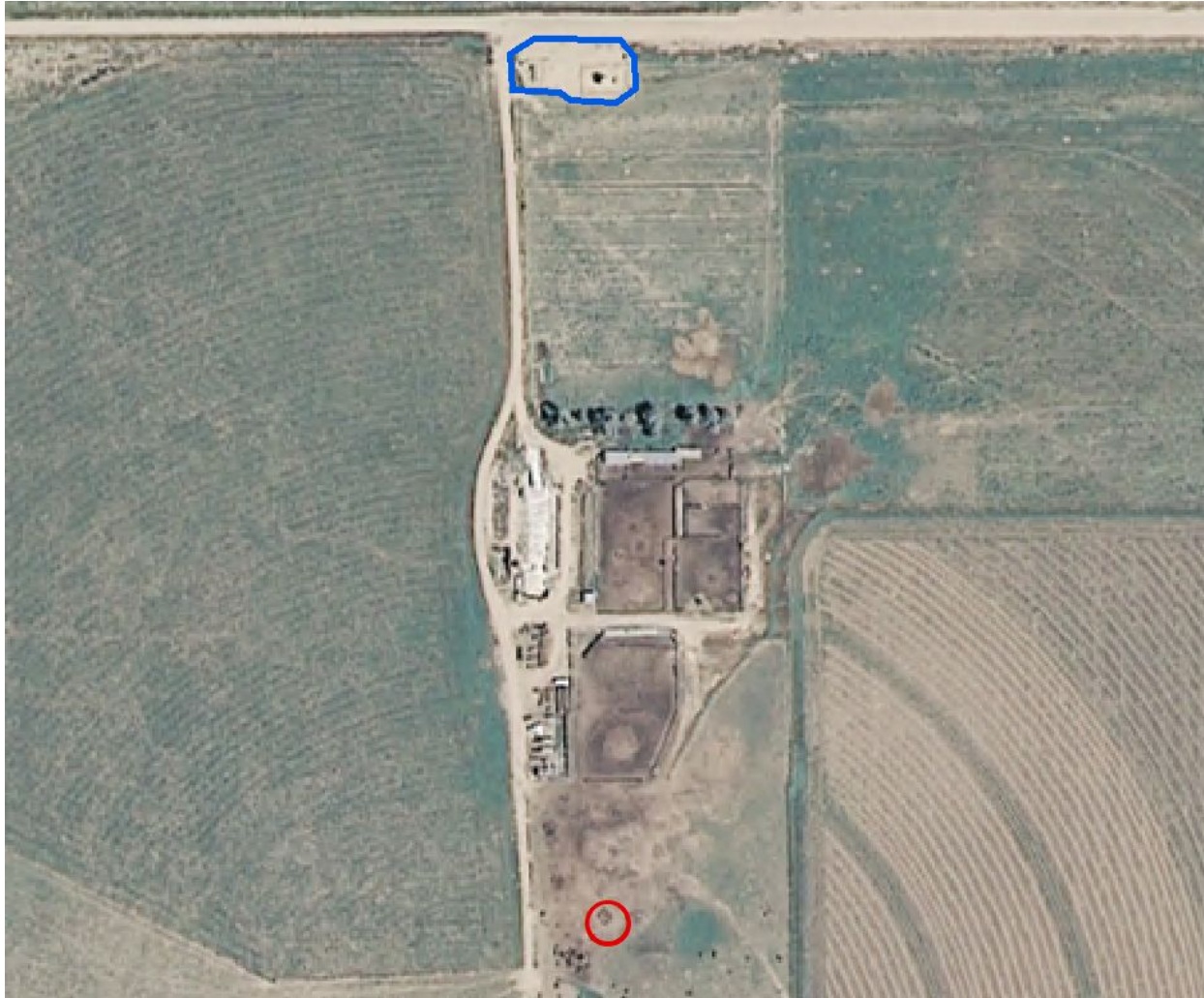
Photo 1. NAIP aerial imagery (2009) illustrating the well location (red circle) and associated tank battery location (blue polygon). Note: no obvious access road in historic imagery.