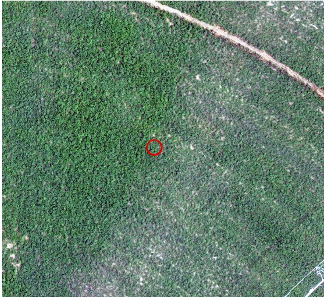
Photo 7. Close-up orthomosaic imagery of the well location (red circle)