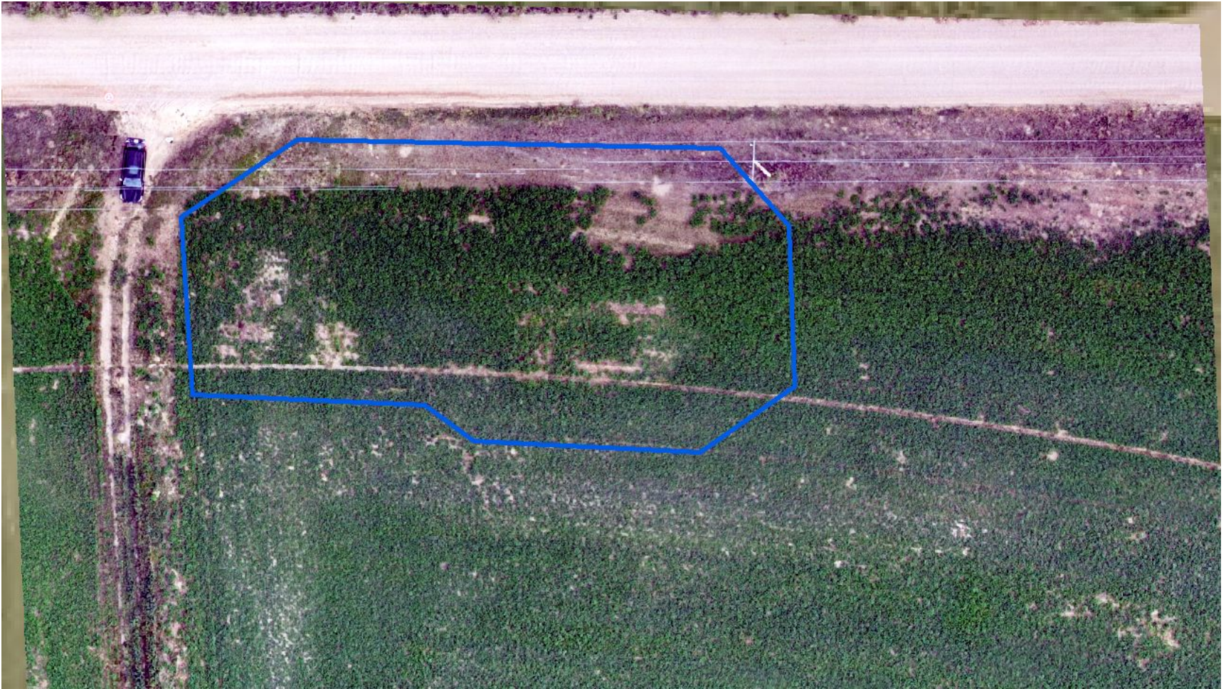
Photo 14. Close-up orthomosaic imagery of the TB (blue polygon) and surrounding field.