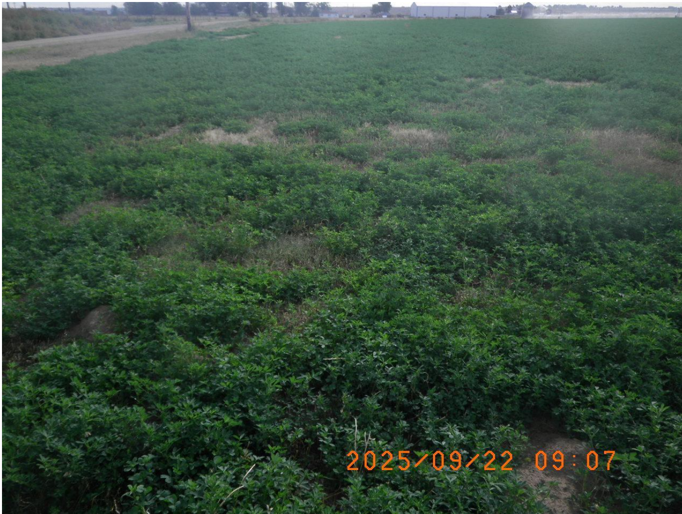
Photo 12. Ground photo taken on the west edge of the TB facing east showing vegetation growth.