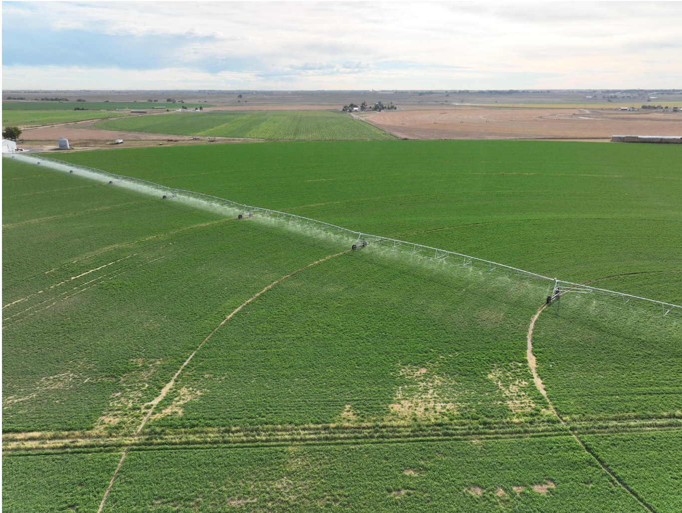
Photo 4. Drone aerial imagery taken west of well location, facing east (displaying the well).