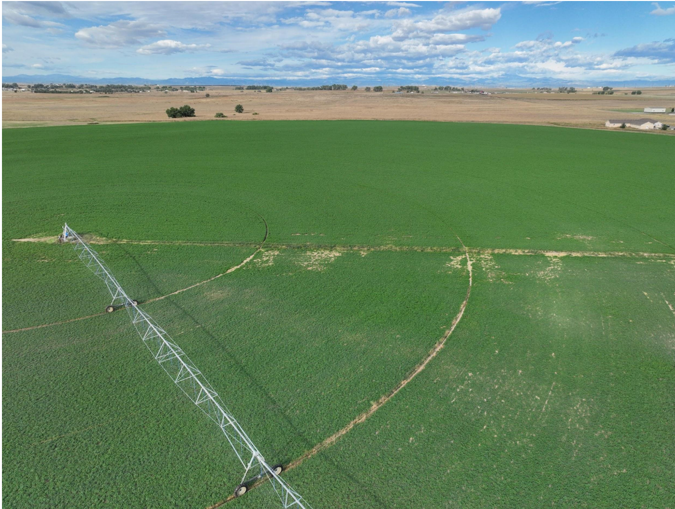
Photo 6. Drone aerial imagery taken east of well location, facing west (displaying the well).