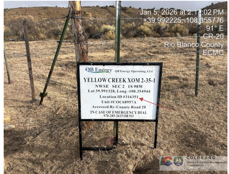
Photo # 0508 Sign at entrance to location contains incorrect location ID #