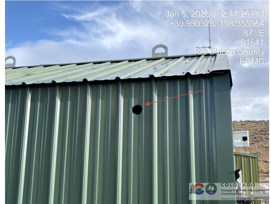
Photo # 0536 Pump house hole open to wildlife/available for entry by wildlife