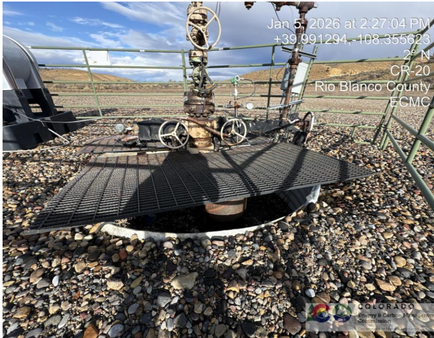
Photo # 0518 Improperly covered wellhead cellar lacks wildlife egress/available for entry by wildlife