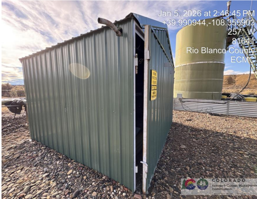
Photo # 0534 Pump house door partially open to wildlife/available for entry by wildlife