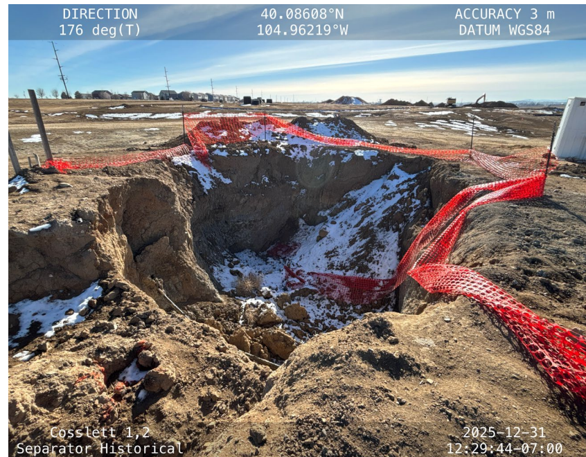
Excavation with inadequate fencing