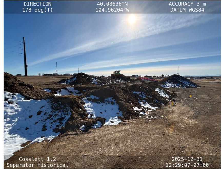
Excavation with inadequate fencing