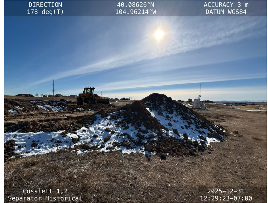
Stockpile with no BMPS