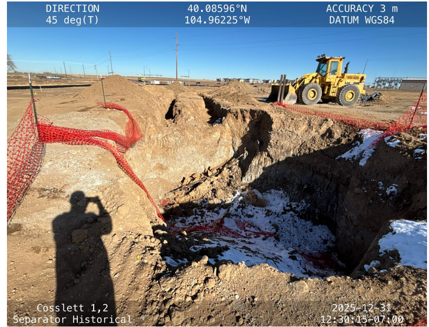
Excavation with inadequate fencing