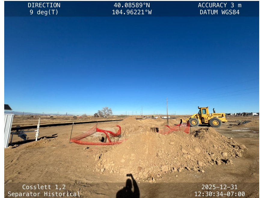
Stockpile with no BMPS