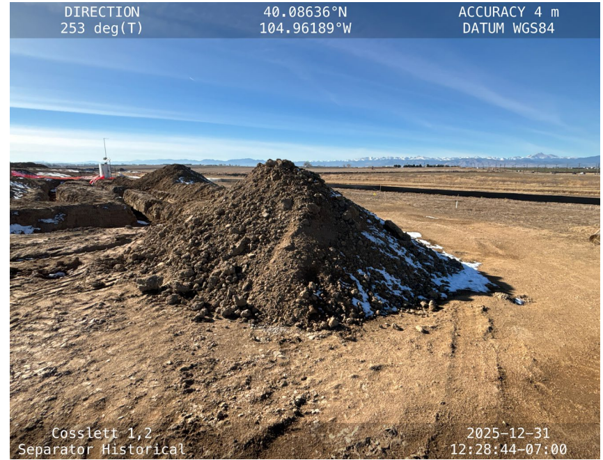
Stockpile with no BMPS