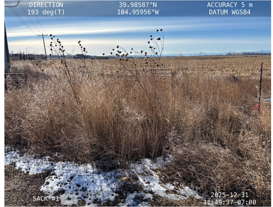
Weeds, torn fencing