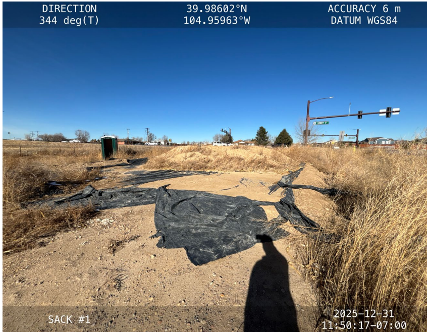
Stockpile with liner