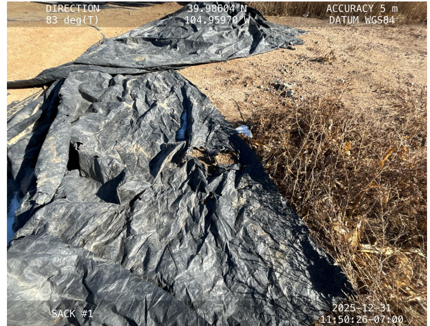
Torn stockpile liner