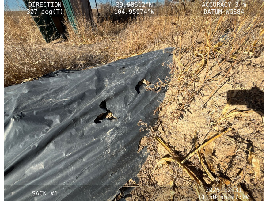
Ripped stockpile liner