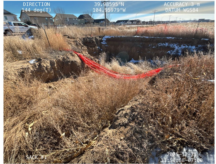
Excavation with fallen fencing, weeds