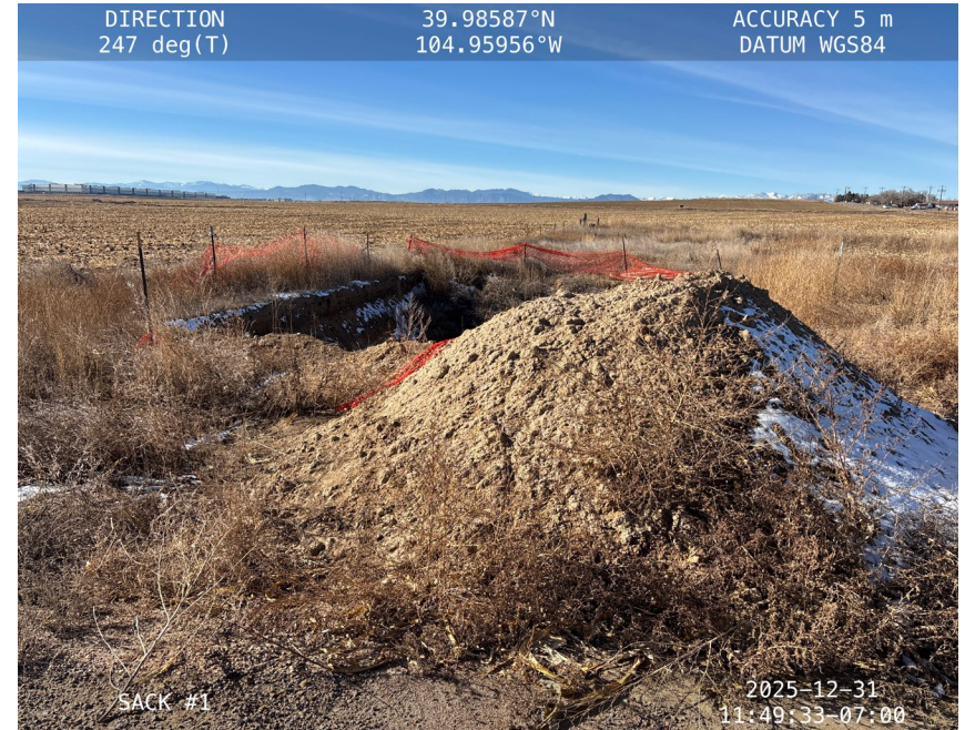
Stockpile onsite for years