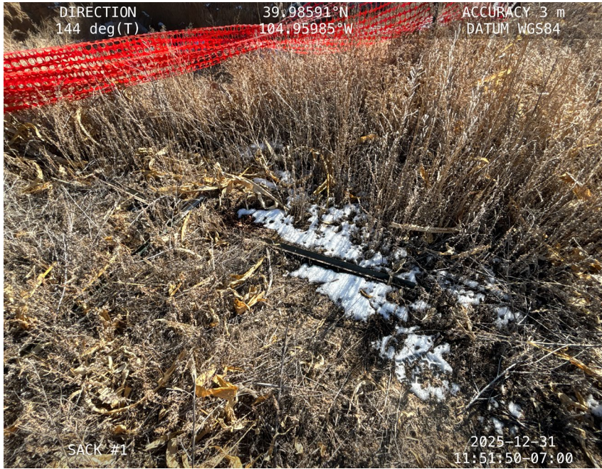
Fencing post trash