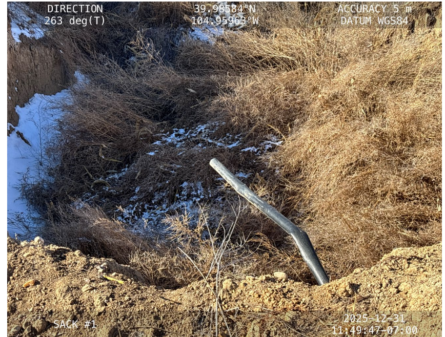
Excavation with torn fencing