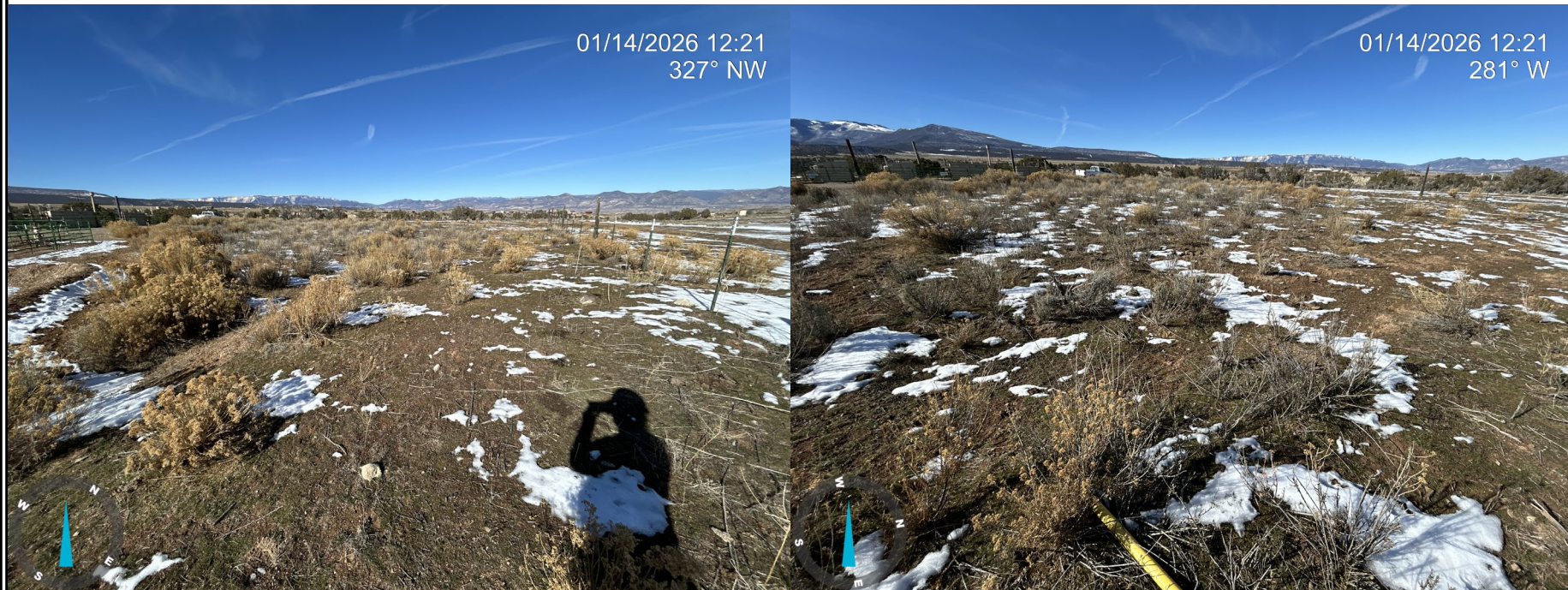
Photo 4: Photos showing an overview of the northeastern and northern interim area, respectively. Rubber rabbitbrush is present and interim areas are progressing towards 1003 reclamation requirements.