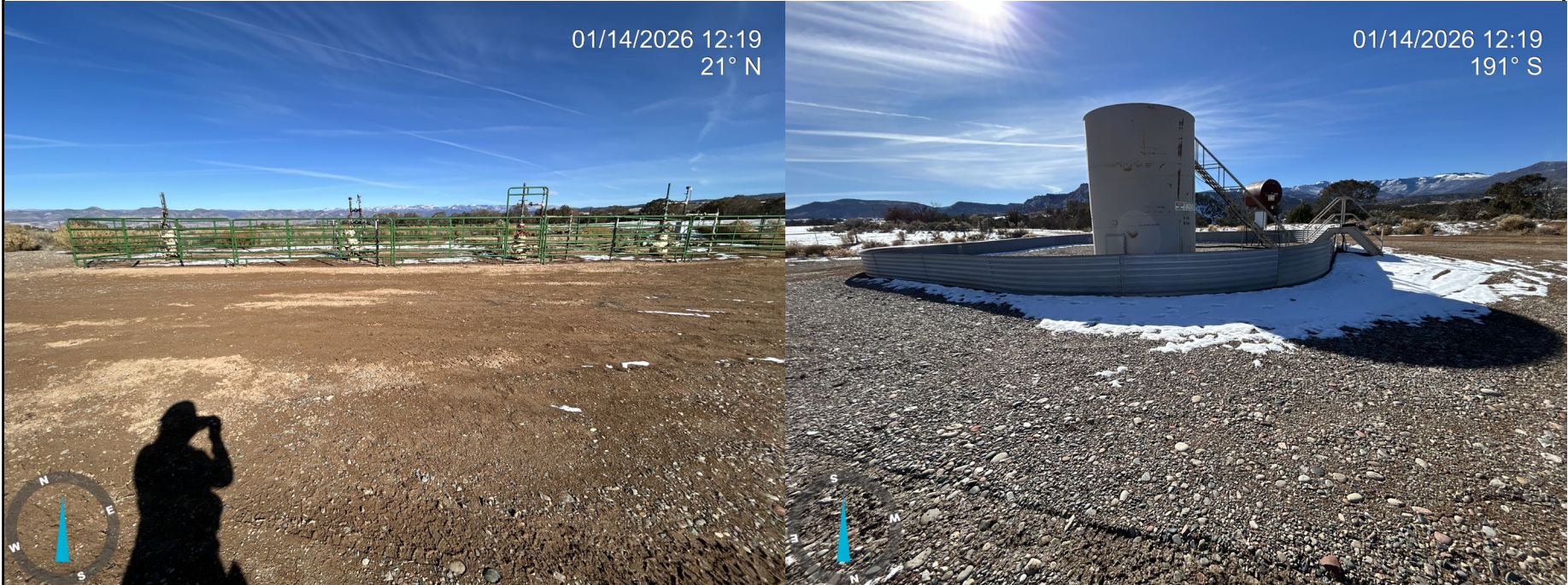
Photo 1: Photos showing an overview of the location looking north and south, respectively.