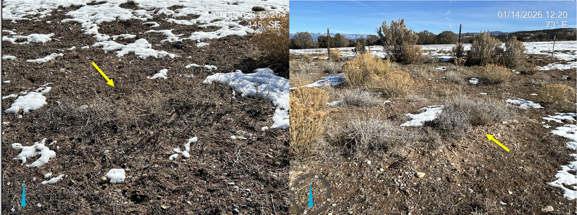
Photo 5: Photos showing examples of prickly Russian thistle, an undesirable plant species, is present in the interim areas. Weed control is required; comply with Rule 606.c.