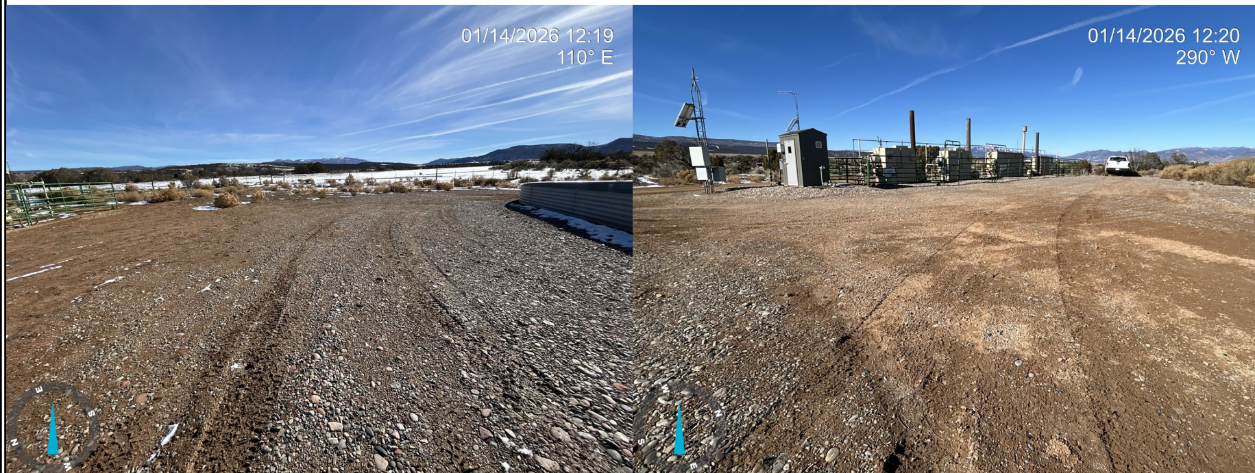
Photo 2: Photos showing an overview of the location looking east and west, respectively.