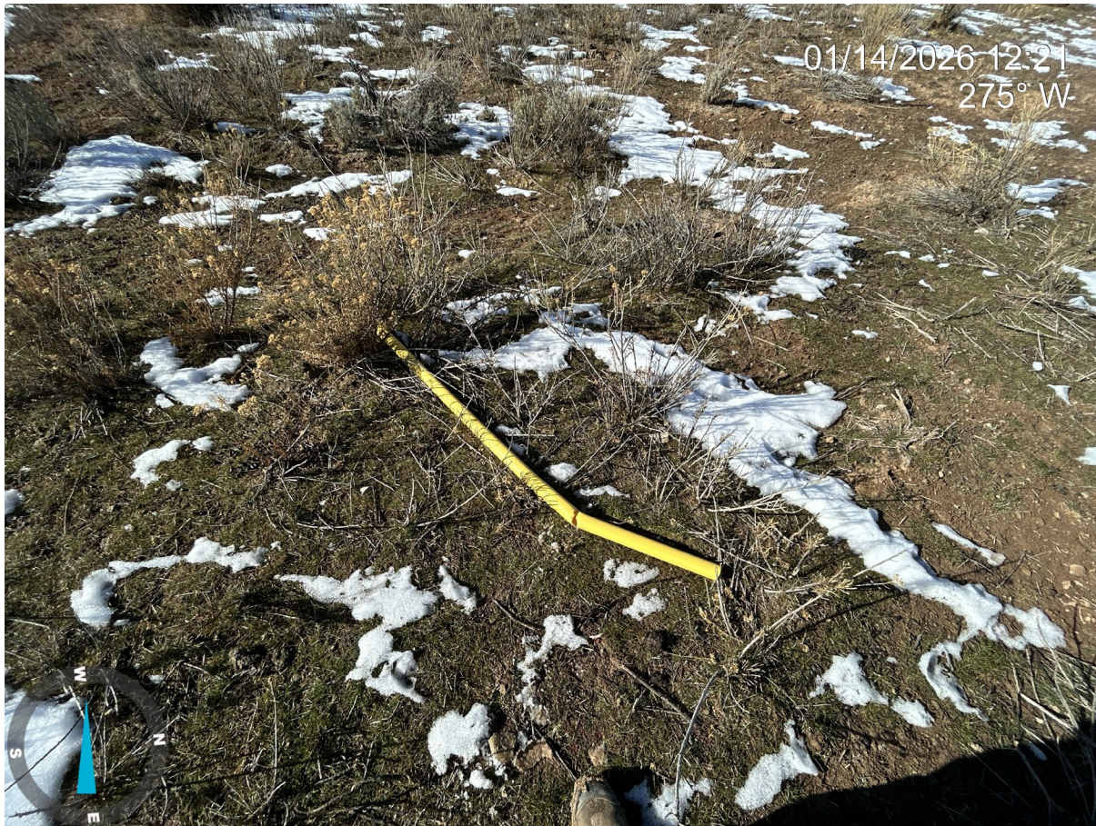
Photo 6: Photo showing some trash/debris that is present within the interim area. Comply with rule 606.d.