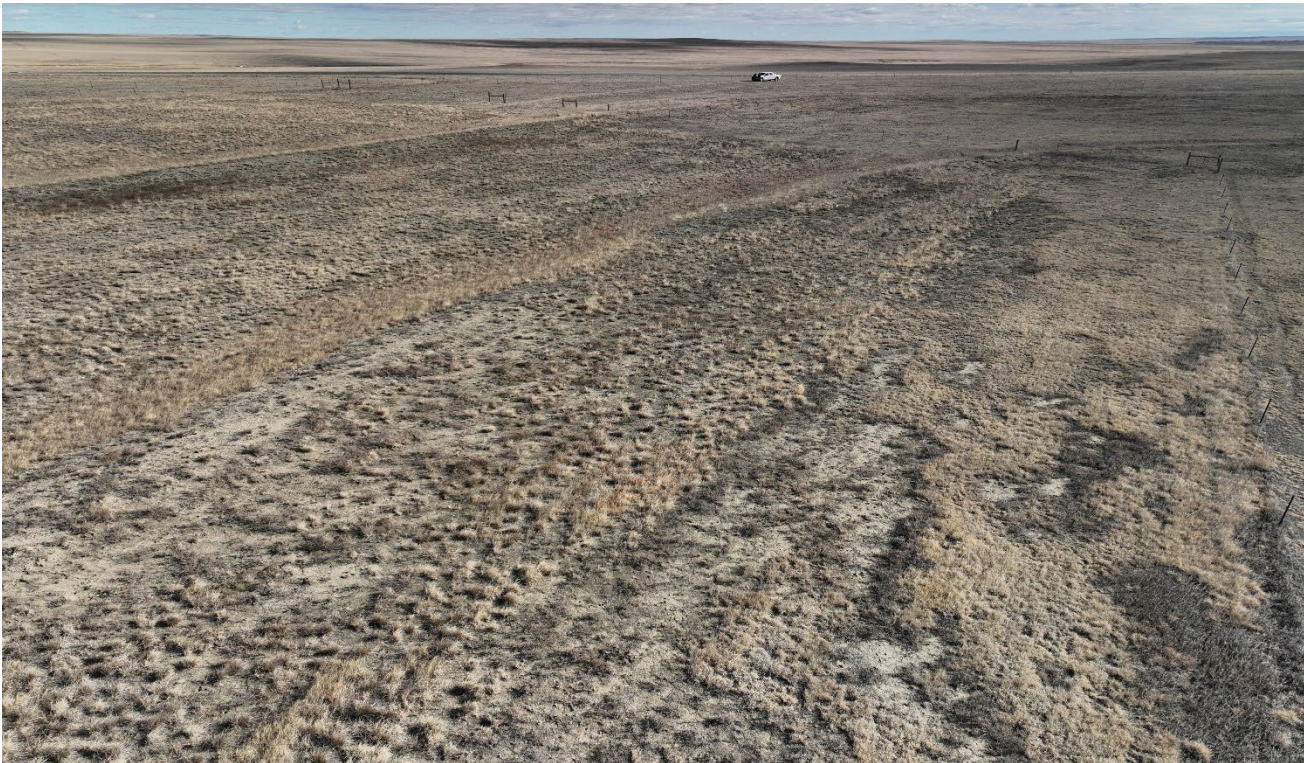
Photo 10. West side of the location facing southeast. There are areas along the western side that have not revegetated to reference area levels.