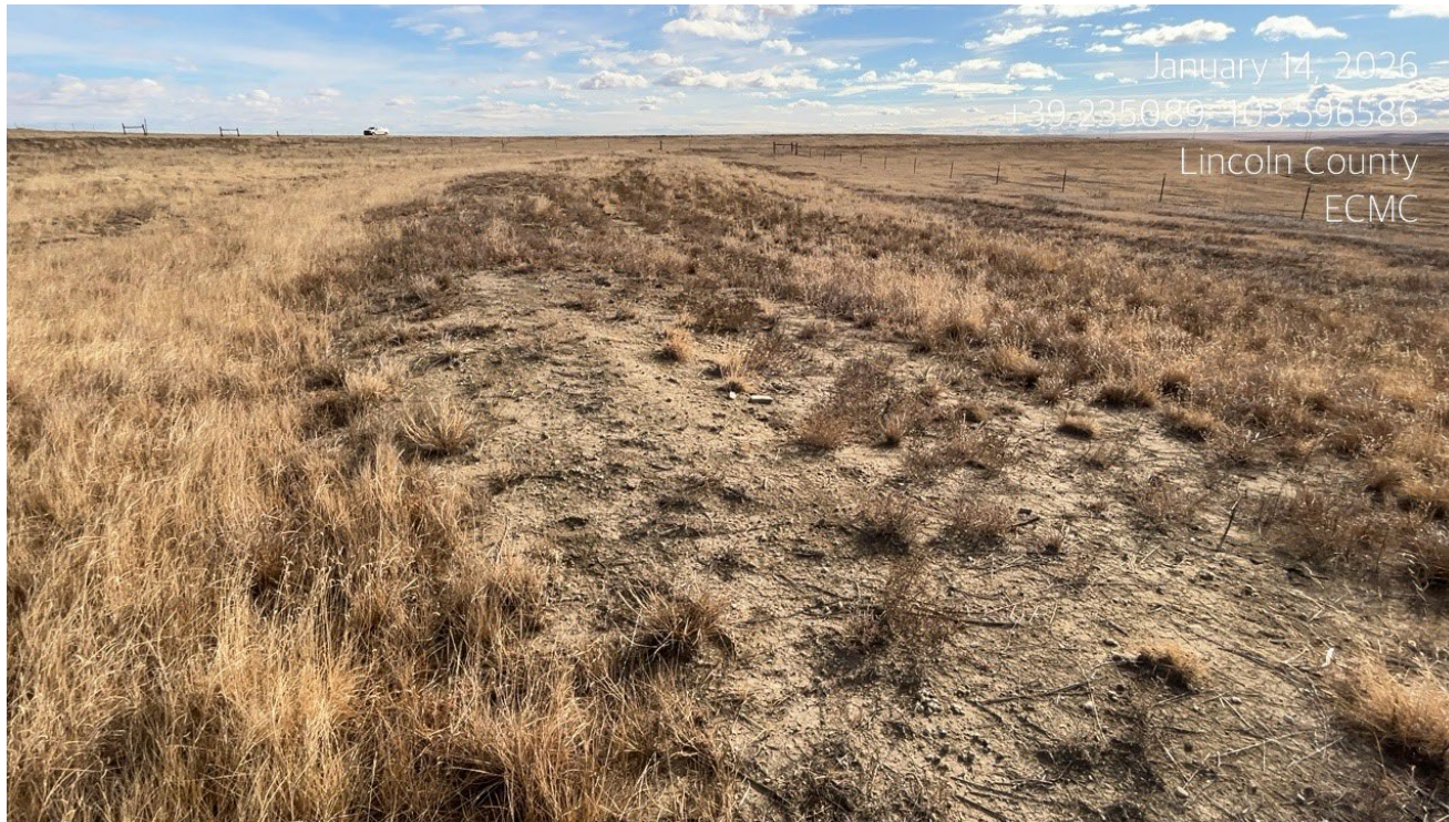
Photo 7. Facing southeast at the west side of the location. This area along the berm has not revegetated.