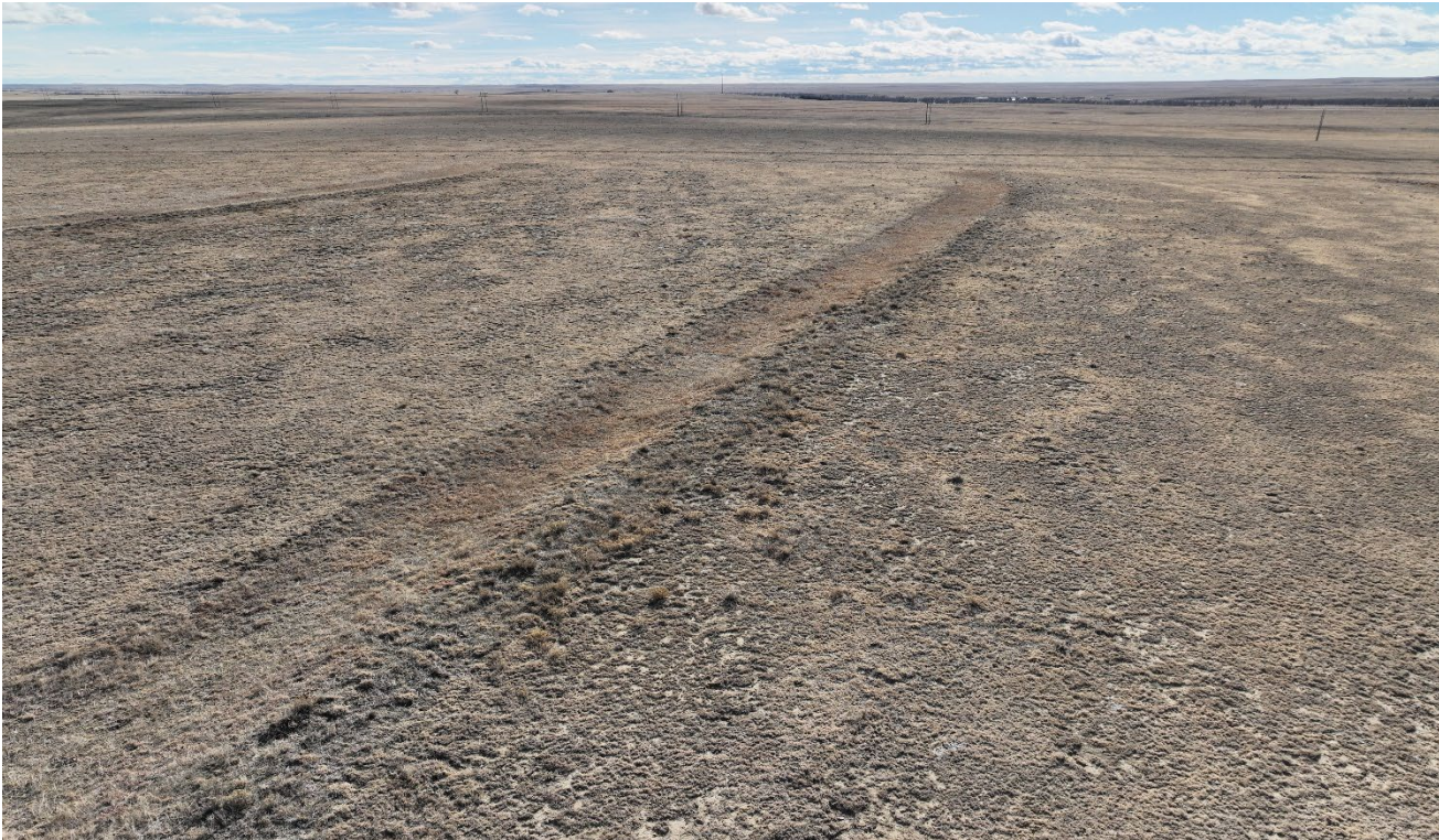
Photo 11. Drone aerial photo facing northwest toward the surrounding reference area.