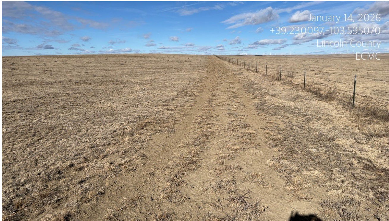
Photo 1. Facing north along the former access road. A two track road is still visible.