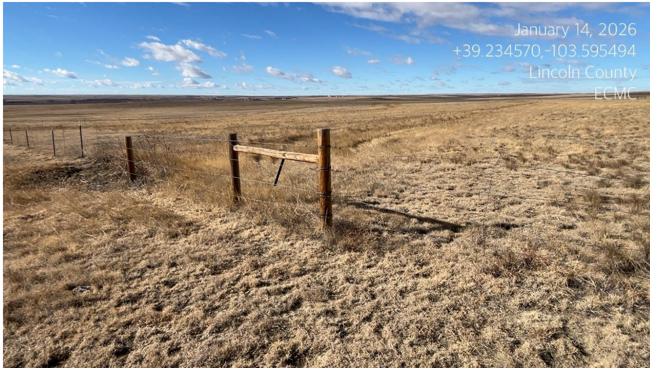
Photo 3. Facing northwest along the access road. The fence remains around the location.