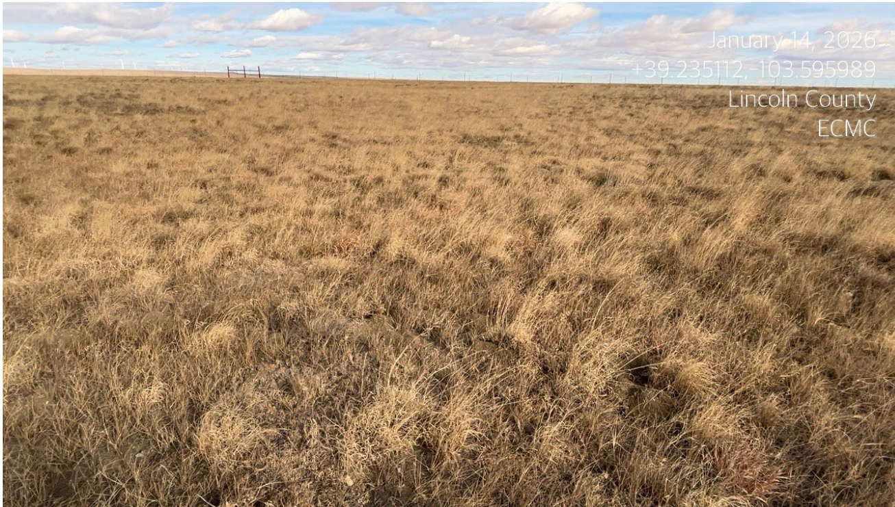
Photo 5. Facing east at the location. The perennial vegetation along the eastern side appears to be well established.