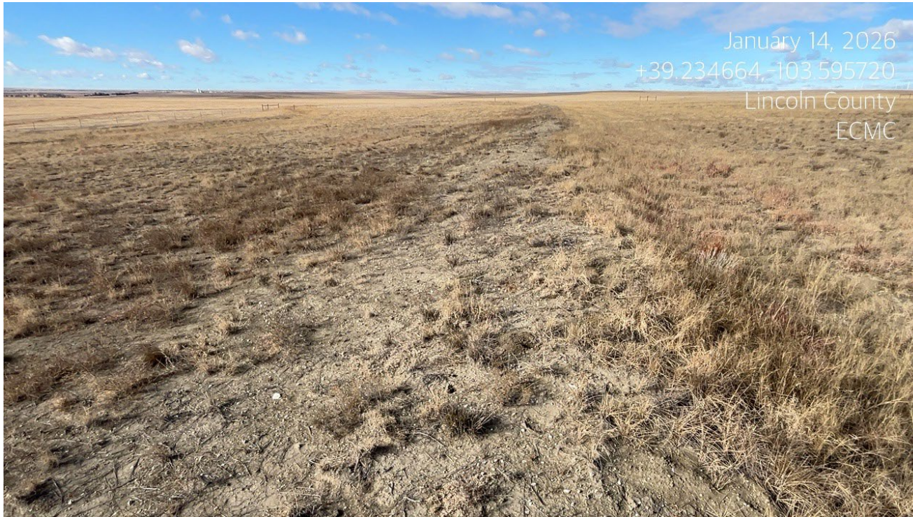
Photo 4. Facing northwest at the location. This area along the berm has not revegetated.