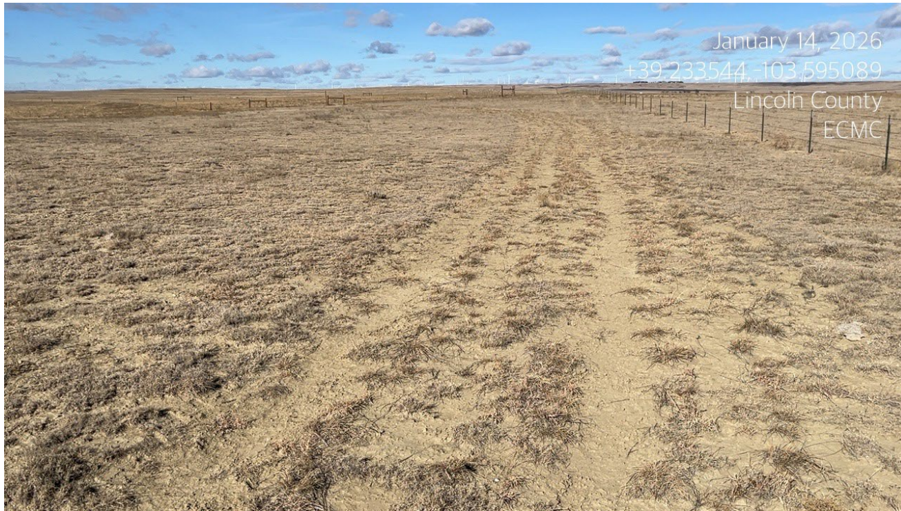
Photo 2. Facing north along the former access road. A two track road is still visible.