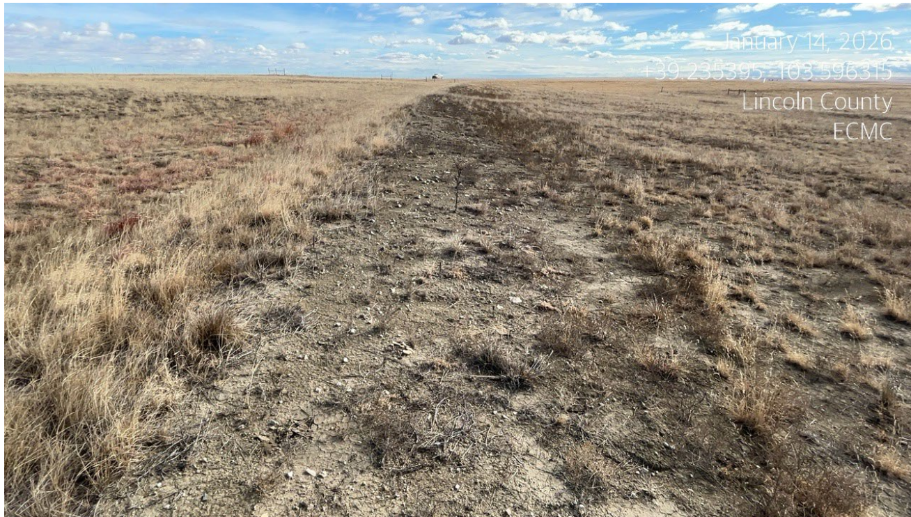
Photo 6. Facing southeast at the location. The area along the berm has not revegetated.