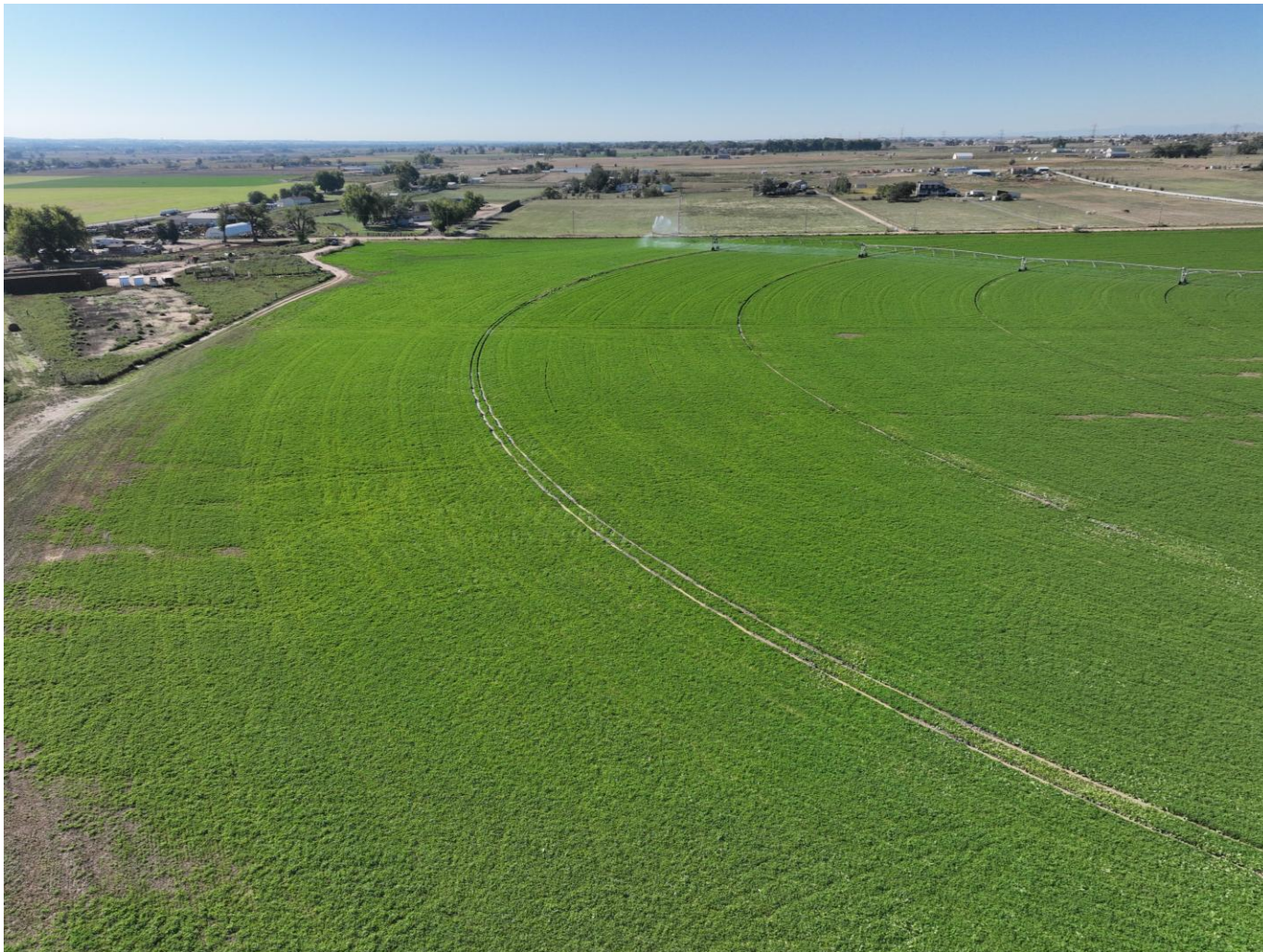
Photo 5. Drone aerial imagery taken north of well location, facing south (displaying the well and access road).