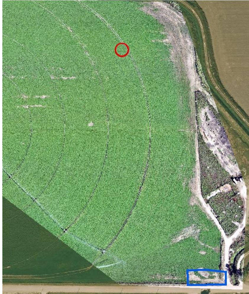
Photo 2. Orthomosaic (drone) imagery taken 9/18/2025 and NAIP aerial imagery (2023) illustrating the well location (red circle) and associated tank battery (blue polygon).