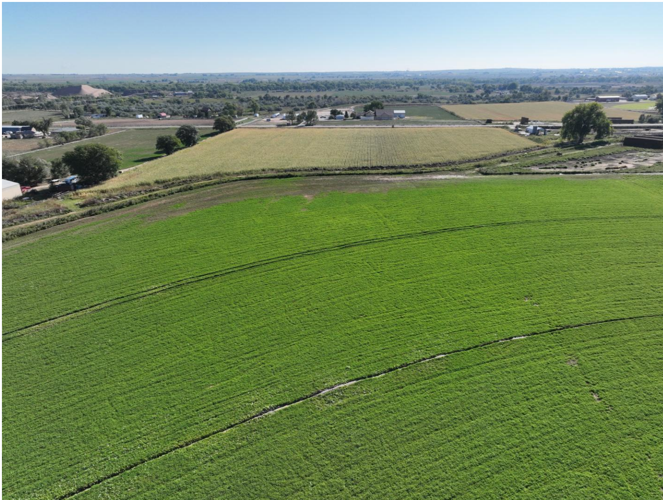
Photo 4. Drone aerial imagery taken west of well location, facing east (displaying the well).