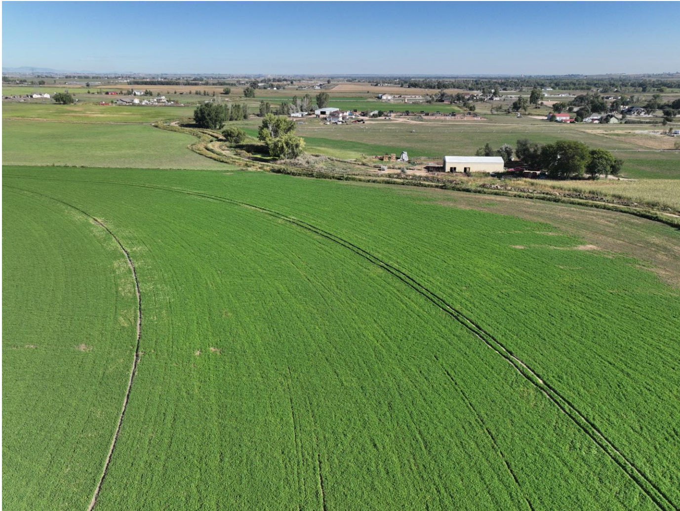
Photo 3. Drone aerial imagery taken south of well location, facing north (displaying the well and part of the access road).