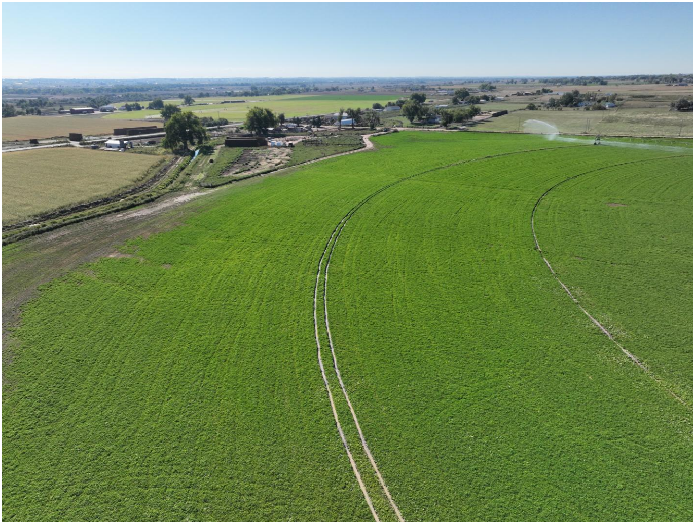
Photo 7. Drone aerial imagery taken northwest of well location, facing southeast (displaying the well and presumed flowline).