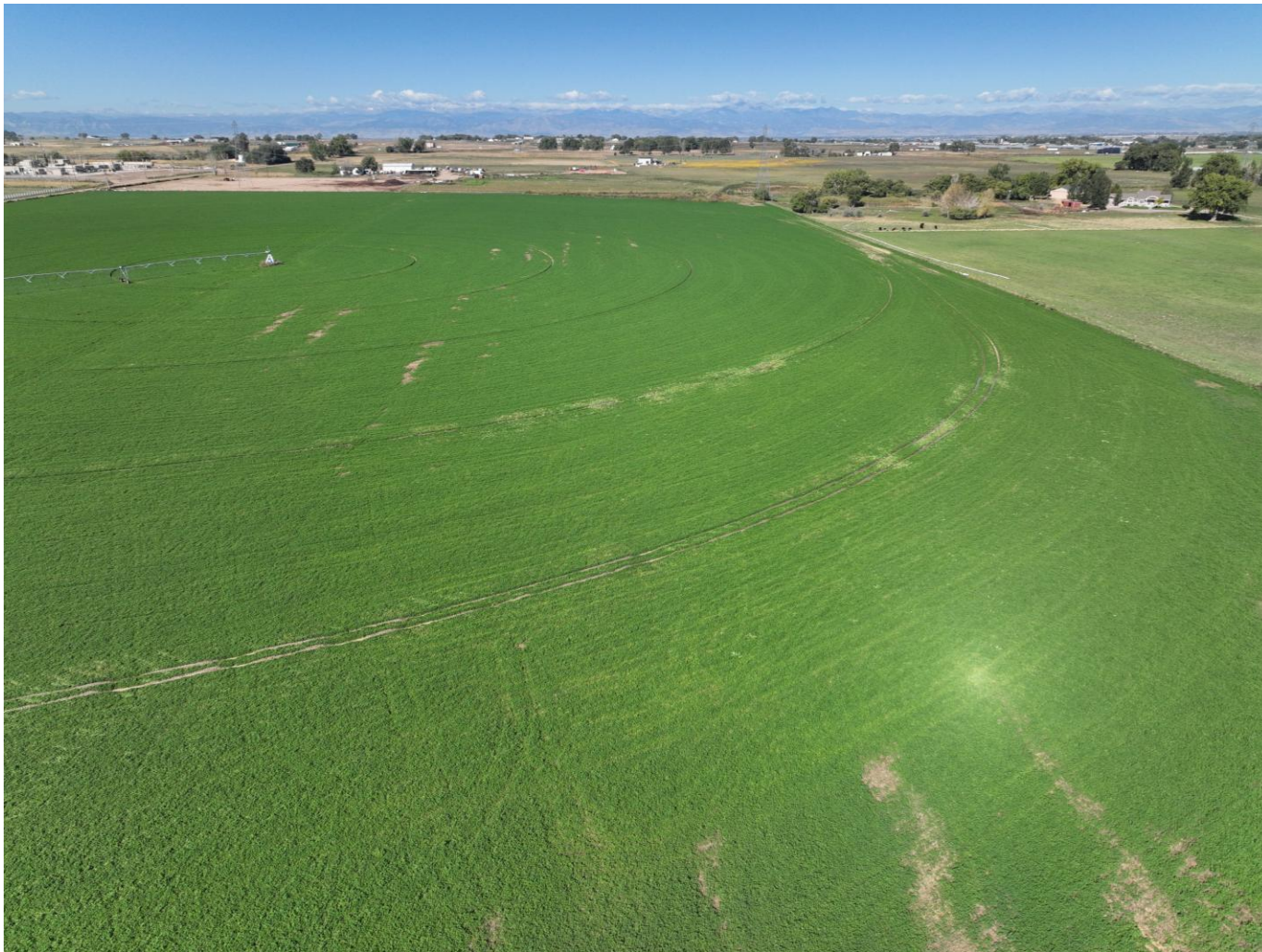
Photo 6. Drone aerial imagery taken east of well location, facing west (displaying the well).