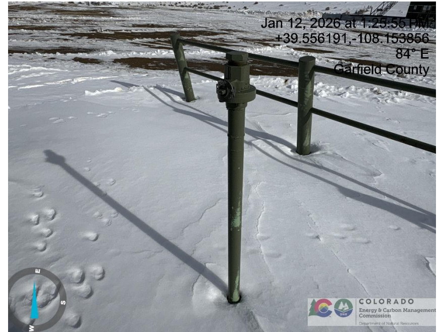
Photo # 102 Unused flowline lacks lockout tagout (OOSLAT) Line is located near pig station