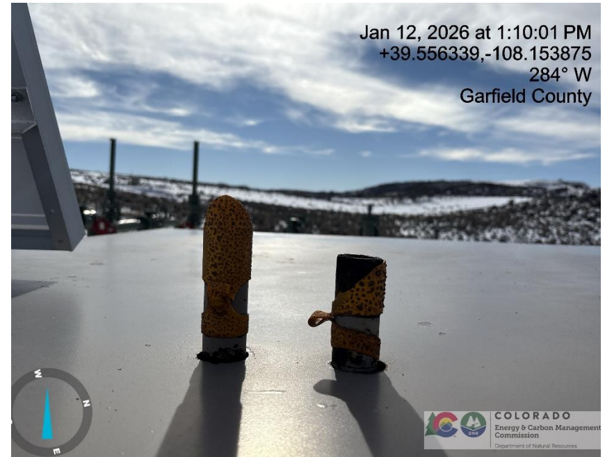
Photo # 98 PRV vent line does not comply with CECMC pressure safety device rules