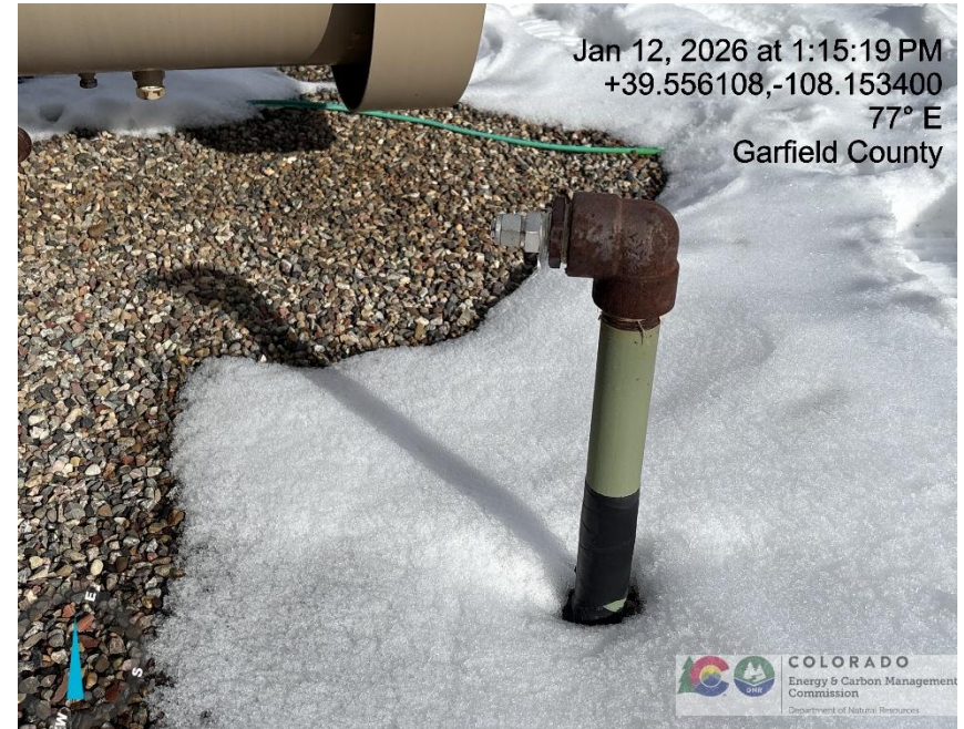
Photo # 99 Unused flowline lacks lockout tagout (OOSLAT) Line is located in secondary containment near tank heater