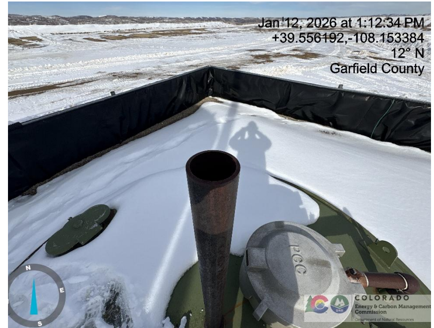
Photo # 95 Partially buried condensate tank not properly sealed & open to atmosphere (Additionally the open ended piping is also a wildlife hazard)

Photo # 96 Partially buried condensate tank not properly sealed & open to atmosphere (Additionally the open ended piping is also a wildlife hazard)