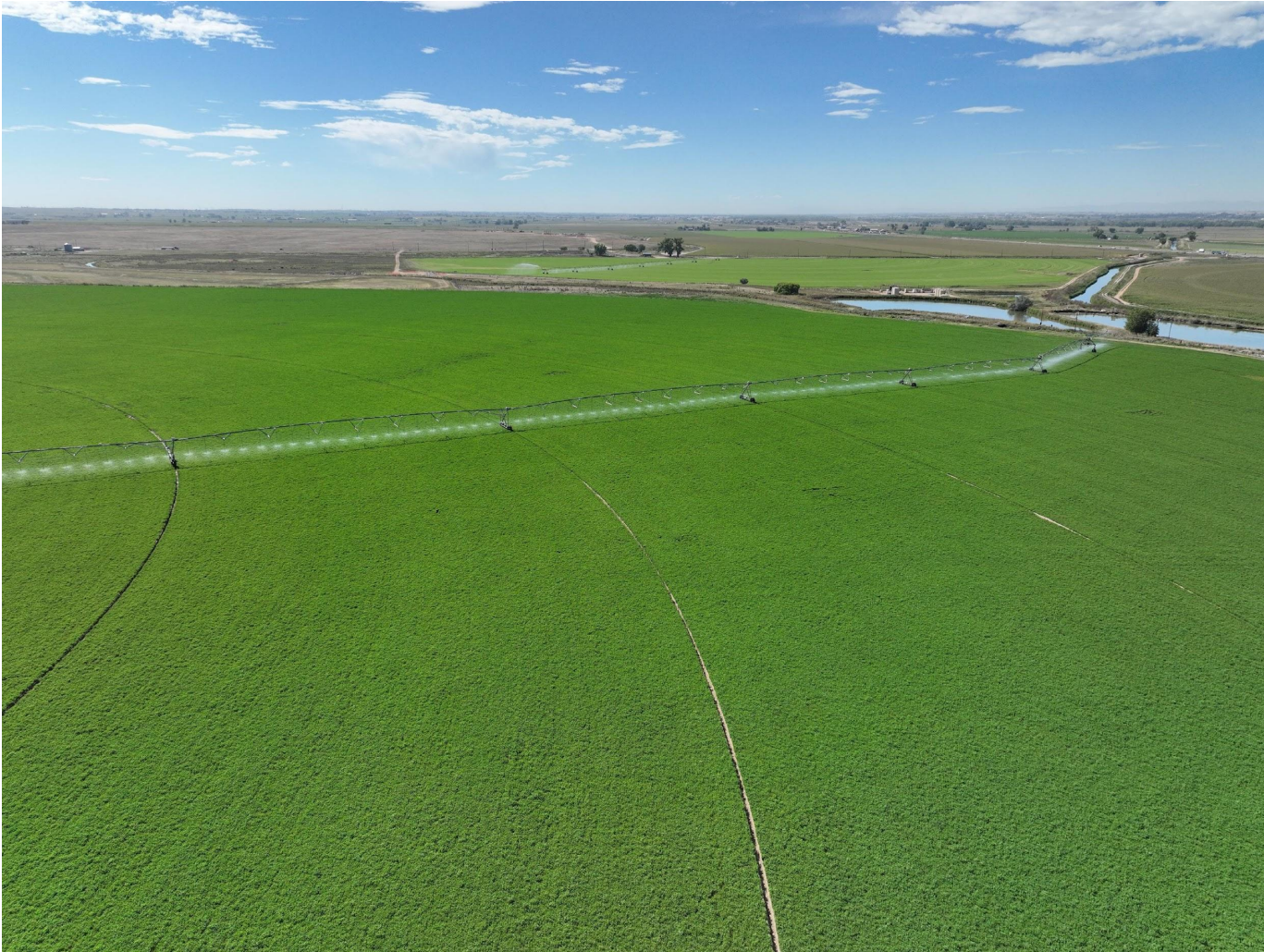
Photo 5. Drone aerial imagery taken north of well location, facing south (displaying the well).

Inspection Photos Location Name: Jim 1 Location ID: 336093