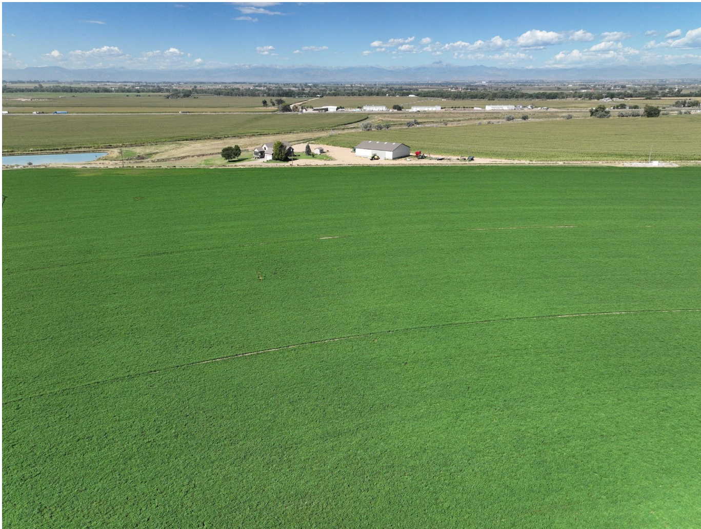
Photo 6. Drone aerial imagery taken east of well location, facing west (displaying the well and access road). Crop vegetation at the well pad and access road appears consistent with adjacent reference areas.