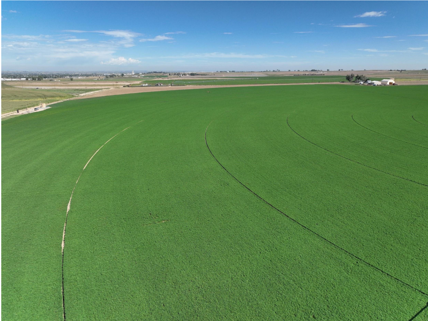
Photo 3. Drone aerial imagery taken south of well location, facing north (displaying the well).