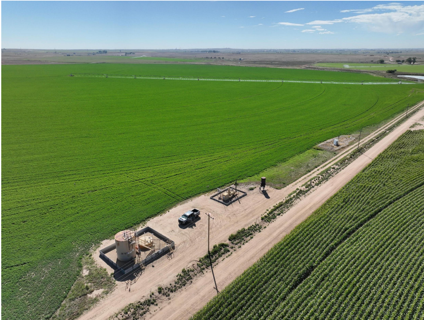
Photo 10. Drone imagery of active tank battery.