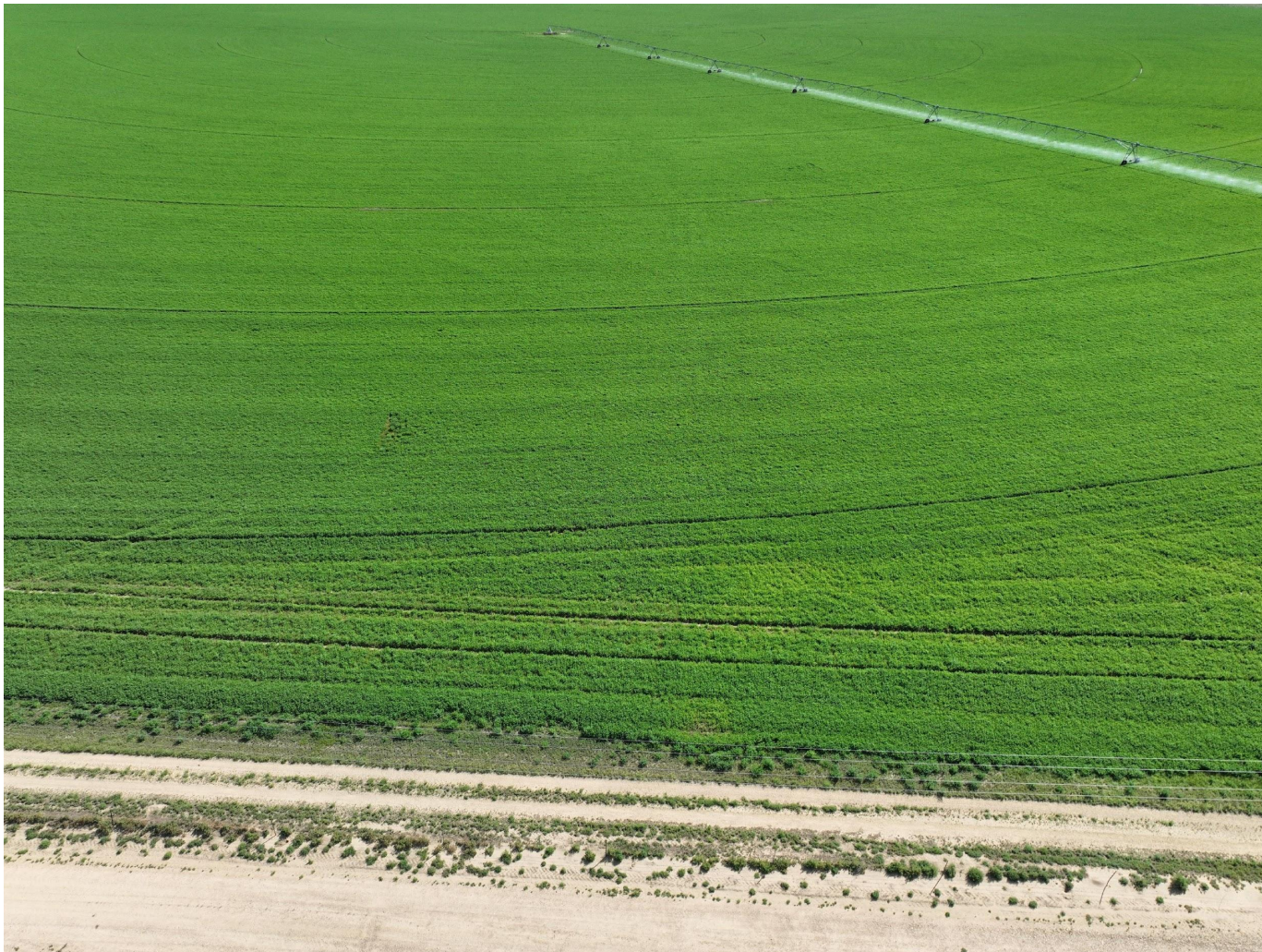
Photo 9. Drone aerial imagery taken west of the well access road takeoff, facing east (displaying the well access road and well).

Inspection Photos Location Name: Jim 1 Location ID: 336093