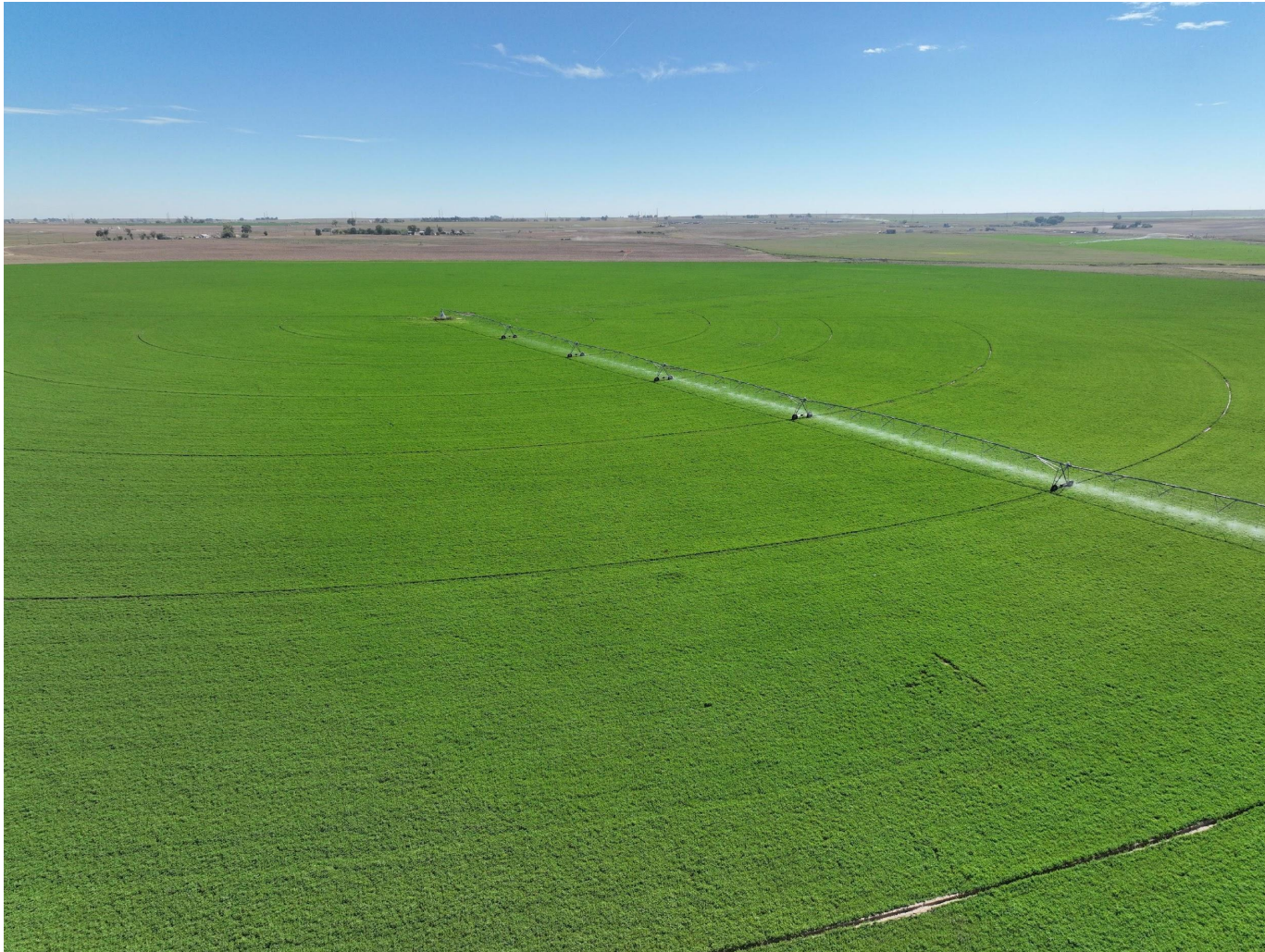
Photo 4. Drone aerial imagery taken west of well location, facing east (displaying the well).

Inspection Photos Location Name: Jim 1 Location ID: 336093