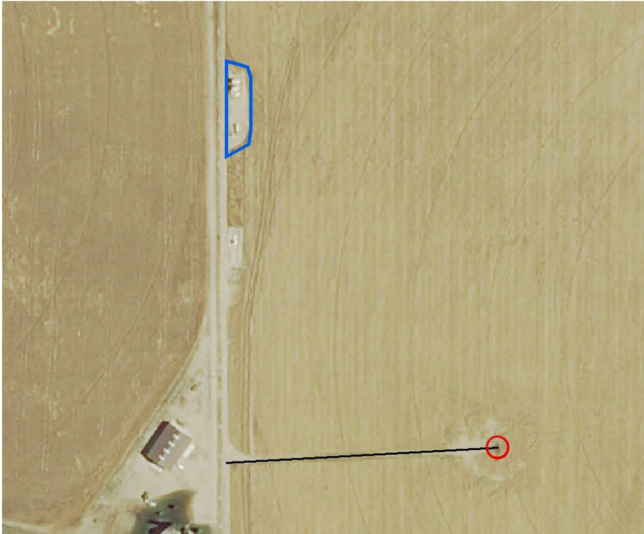
Photo 1. NAIP aerial imagery (2013) illustrating the well location (red circle), associated tank battery location (blue polygon), and well access road (black line). The tank battery is associated with location ID #488944 and remains active.