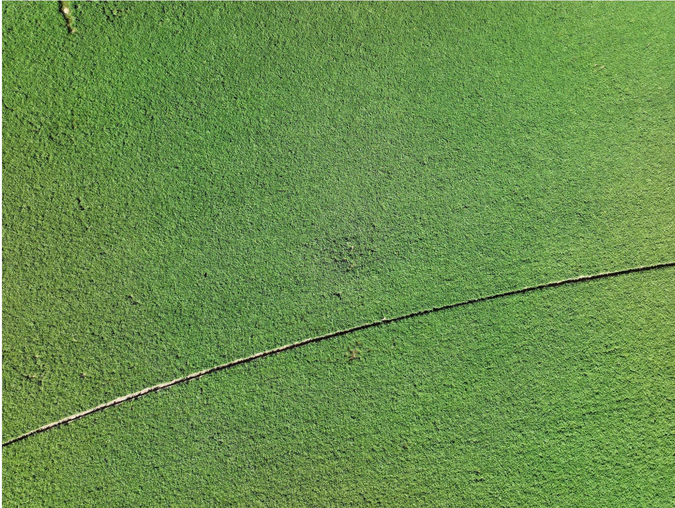
Photo 7. Drone aerial imagery directly above the well location, facing downward (displaying the well).