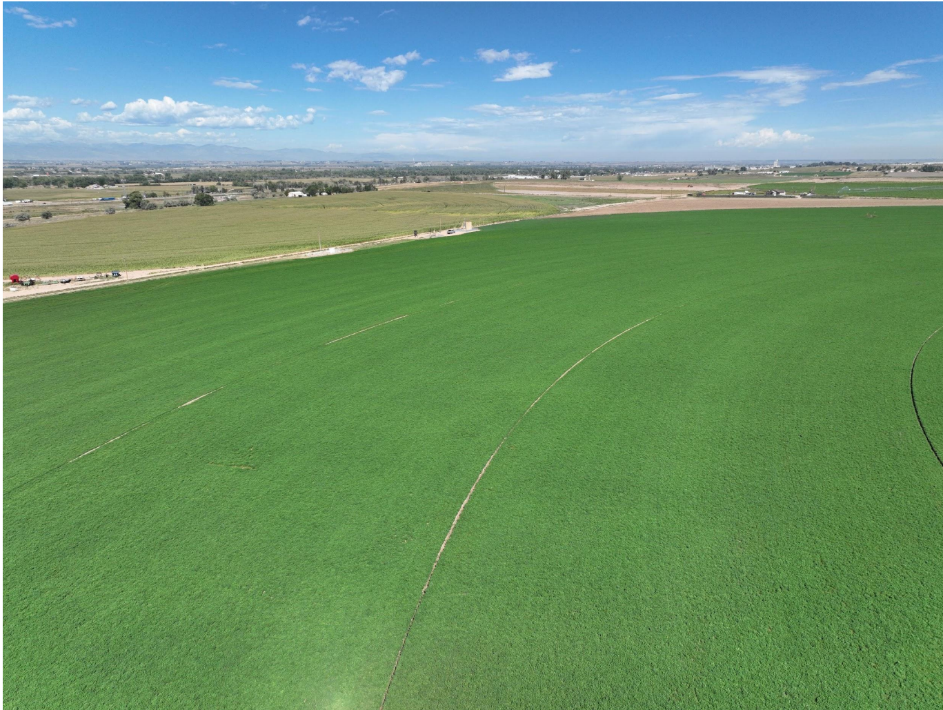
Photo 8. Drone aerial imagery taken southeast of the well location, facing northwest (displaying the well and presumed flowline).

Inspection Photos Location Name: Jim 1 Location ID: 336093