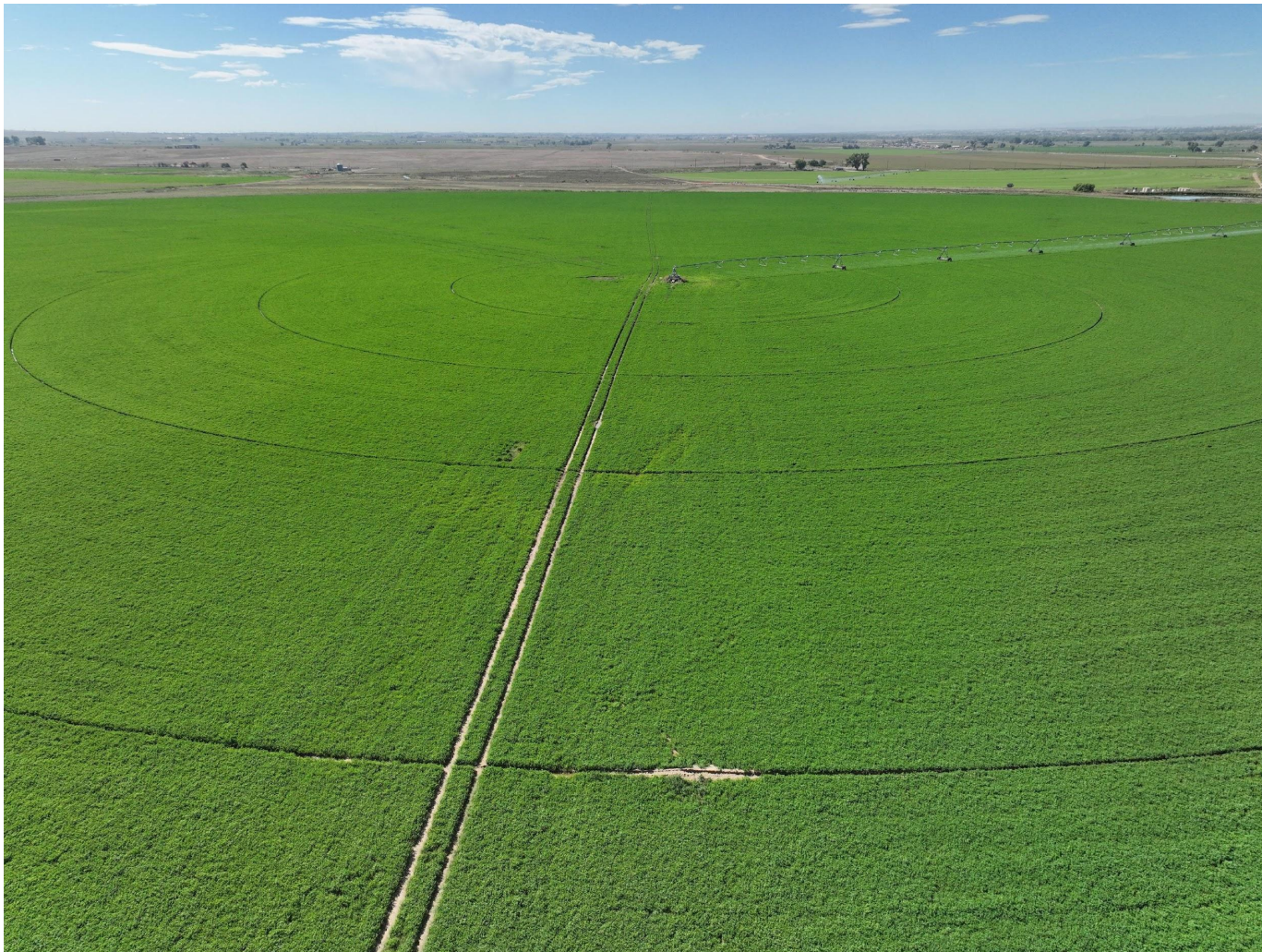
Photo 5. Drone aerial imagery taken north of well location, facing south (displaying the well).