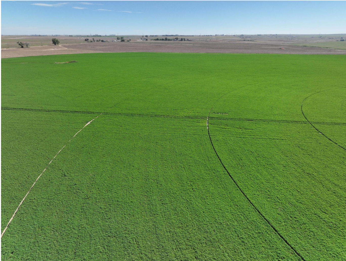
Photo 4. Drone aerial imagery taken west of well location, facing east (displaying the well).