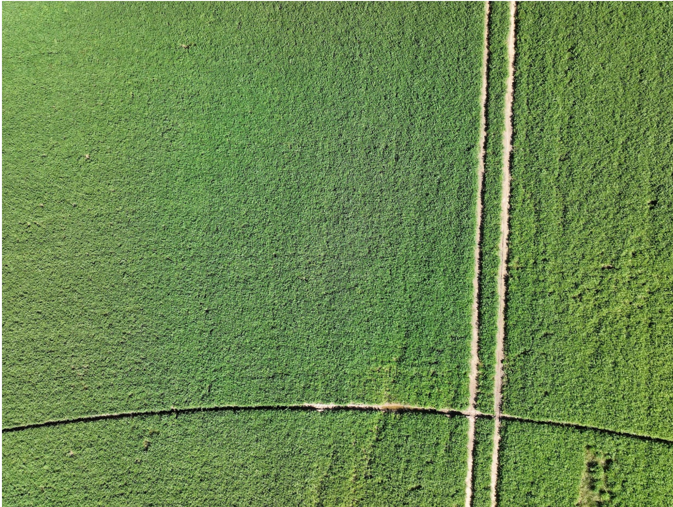
Photo 7. Drone aerial imagery directly above the well location, facing downward (displaying the well).