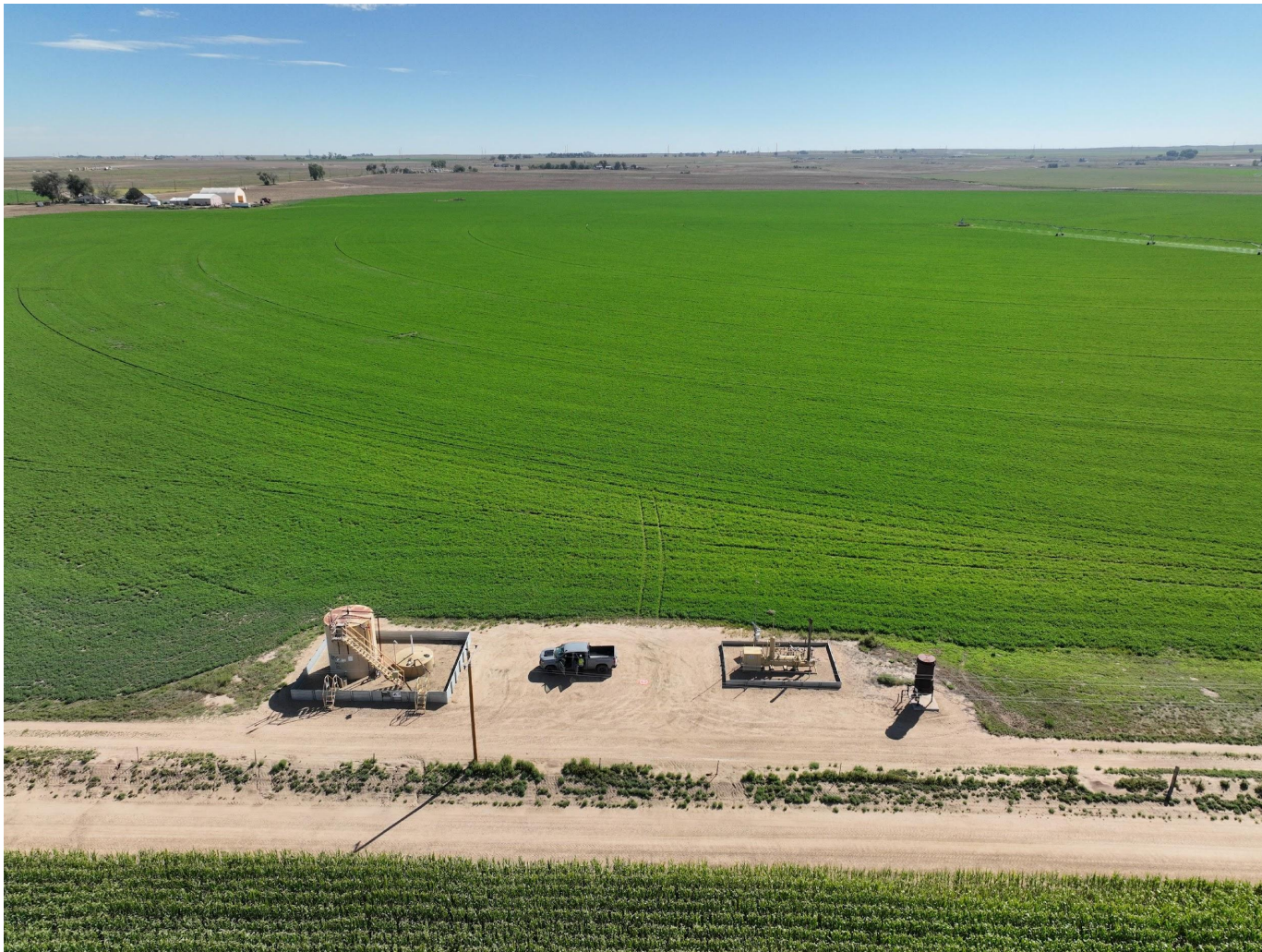
Photo 8. Drone imagery of the active tank battery,.