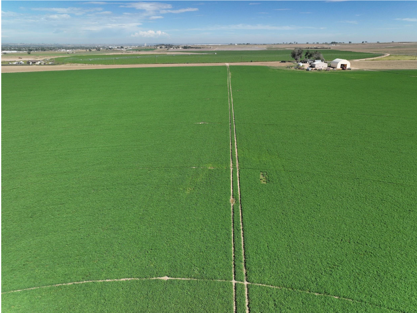
Photo 3. Drone aerial imagery taken south of well location, facing north (displaying the well).