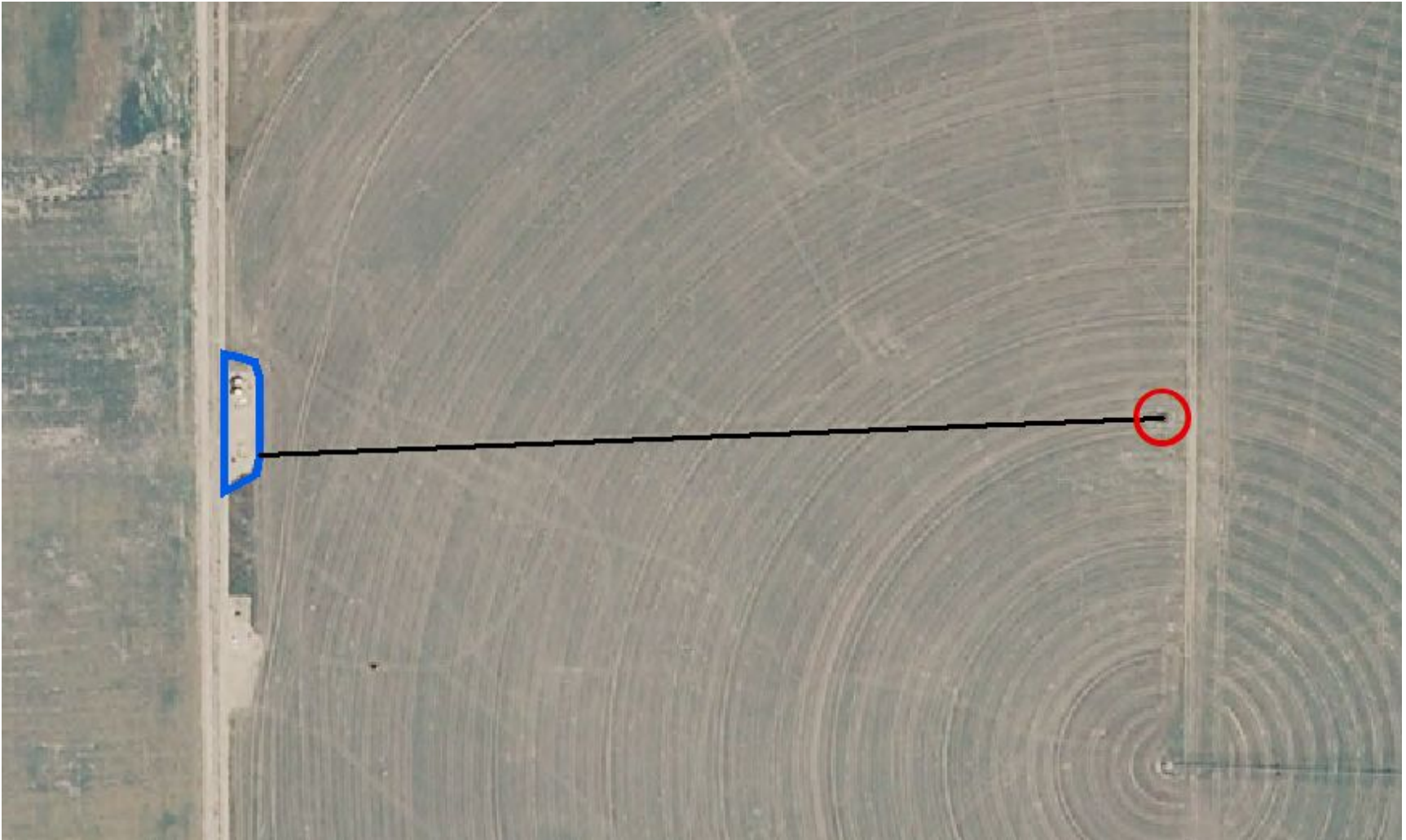
Photo 1. NAIP aerial imagery (2009) illustrating the well location (red circle), associated tank battery location (blue polygon), and well access road (black line). The tank battery is associated with location ID #488944 and remains active.