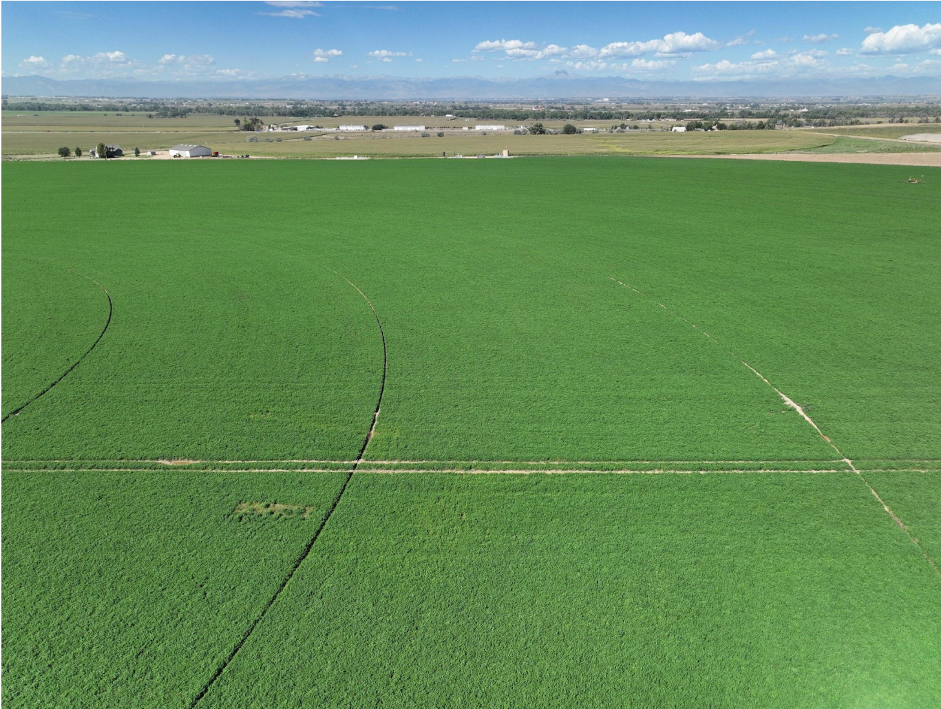
Photo 6. Drone aerial imagery taken east of well location, facing west (displaying the well, presumed flowline, and access road). Crop vegetation at the well pad and access road appears consistent with adjacent reference areas.